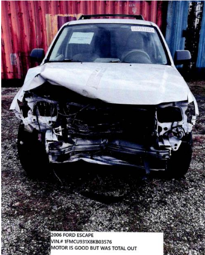
2006 FORD ESCAPE VIN.# 1FMCU931X8KB03576 MOTOR IS GOOD BUT WAS TOTAL OUT