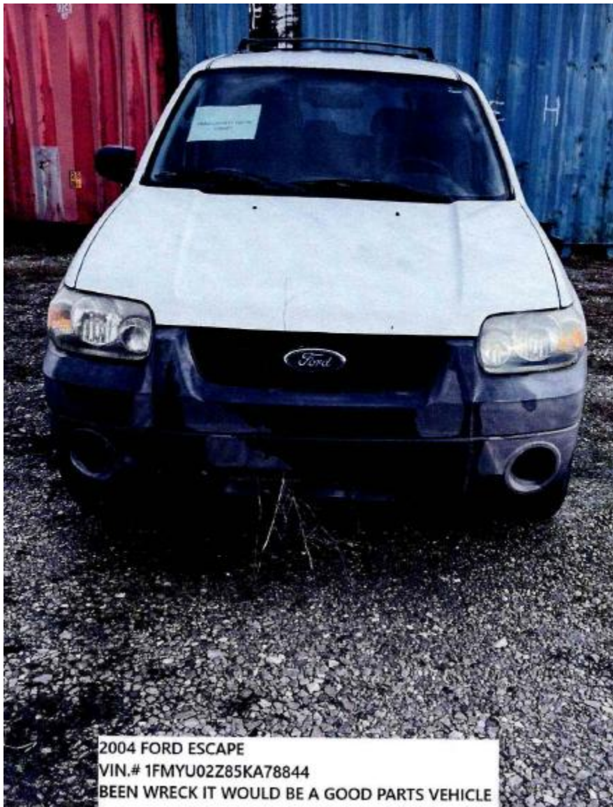
2004 FORD ESCAPE VIN.# 1FMYU02Z85KA78844 BEEN WRECK IT WOULD BE A GOOD PARTS VEHICLE