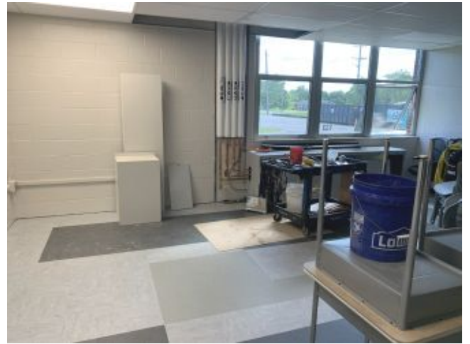
2026.05.04 – Classroom #133