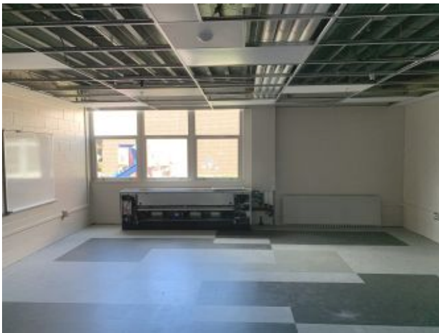
2026.04.30 – Classroom #131