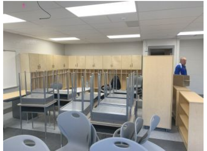
2026.05.04 – Classroom #131