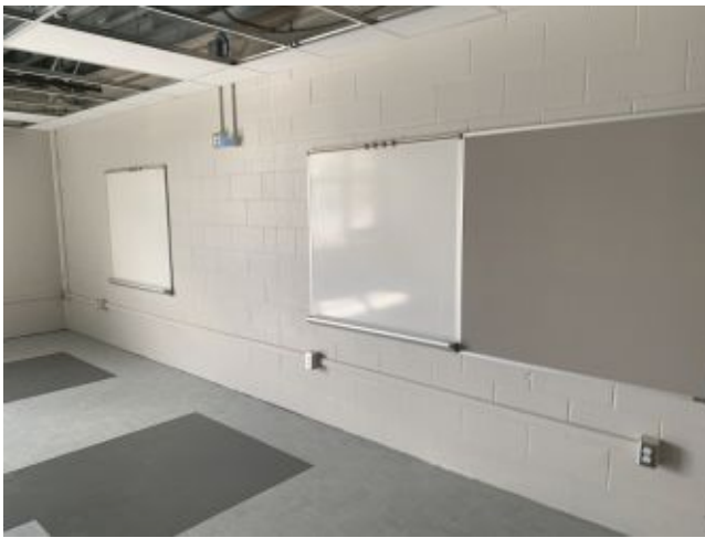
2026.04.30 – Classroom #112