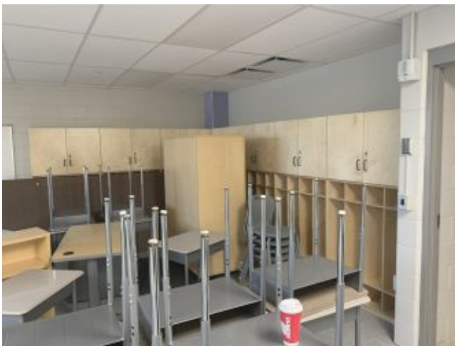
2026.05.04 – Classroom #133