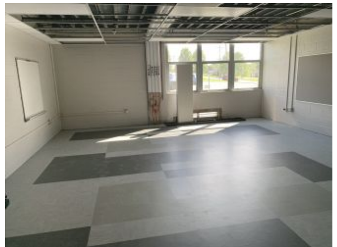
2026.04.30 – Classroom #133