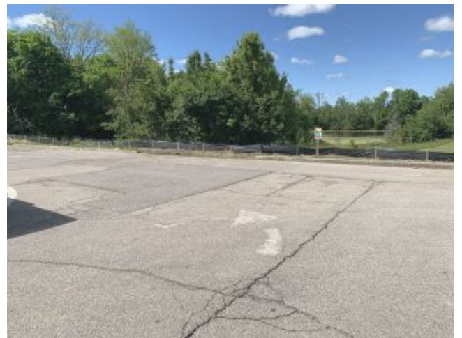
2026.05.04 – Erosion control measures