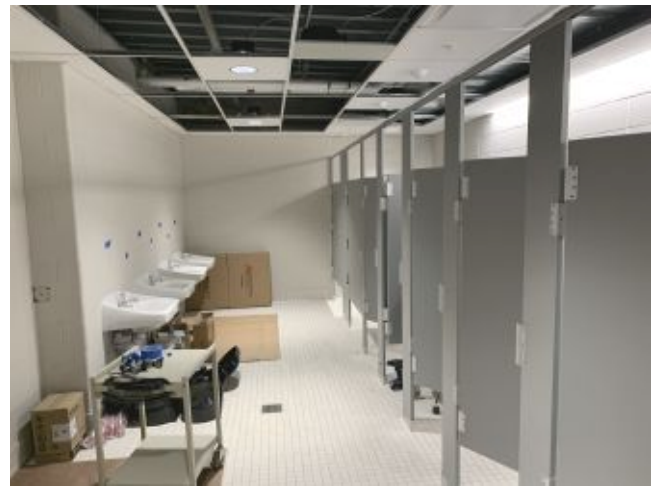
2026.04.30 – Girls #127