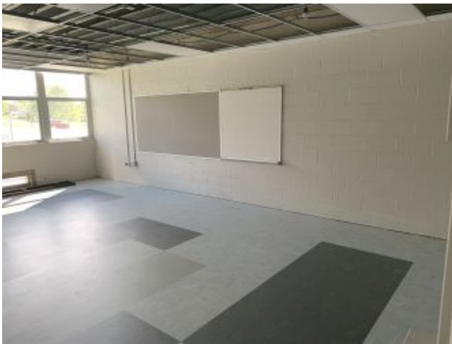
2026.04.30 – Classroom #133