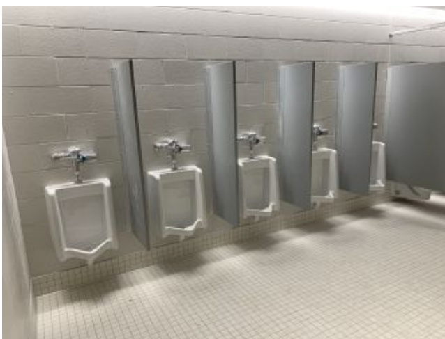
2026.04.30 – Boys #128