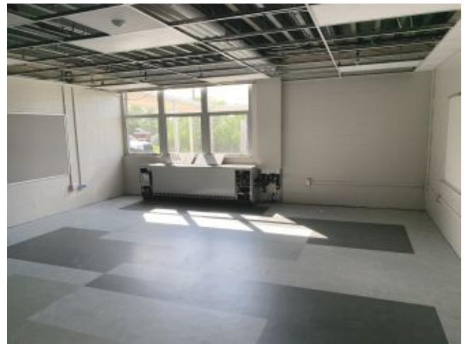
2026.04.30 – Classroom #112