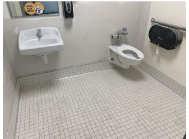
2026.04.30 – Restroom #139