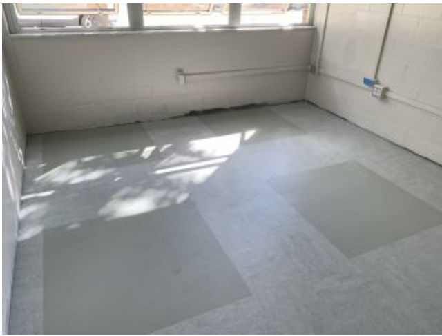
2026.04.30 – Resource #138