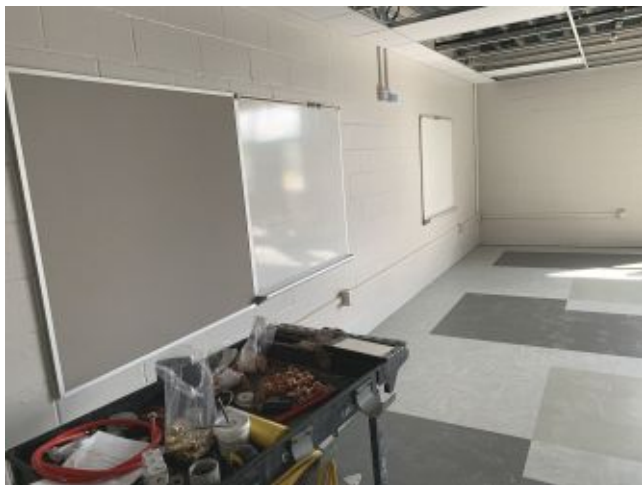
2026.04.30 – Classroom #133