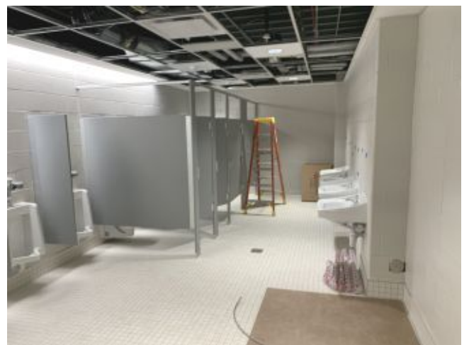
2026.04.30 – Boys #128