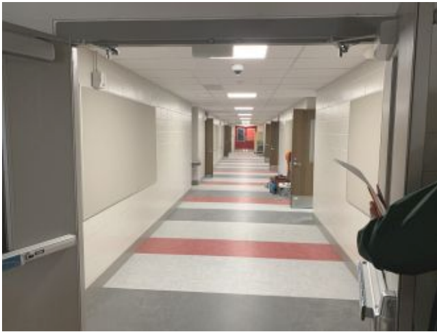
2026.05.04 – Corridor #132