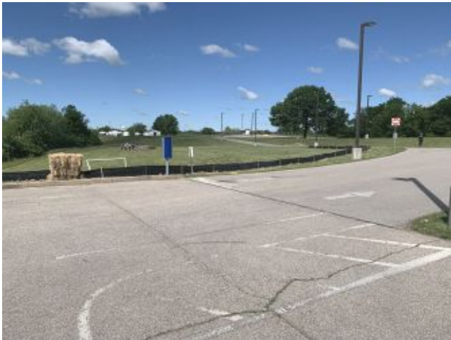
2026.05.04 – Erosion control measures