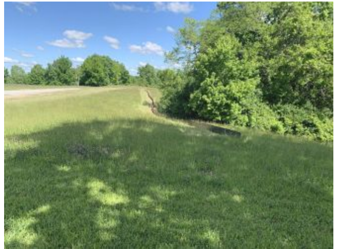
2026.05.04 – Erosion control measures