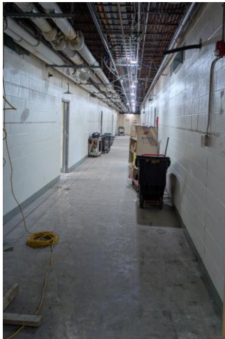
2026.05.12 – Corridor #103 looking west