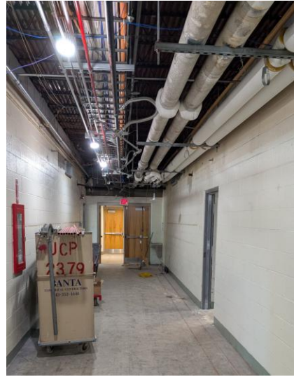
2026.05.12 – Corridor #103 looking east