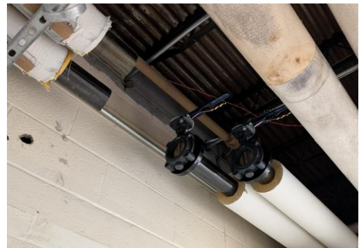
2026.05.12 – Corridor #103 shutoff valve installation