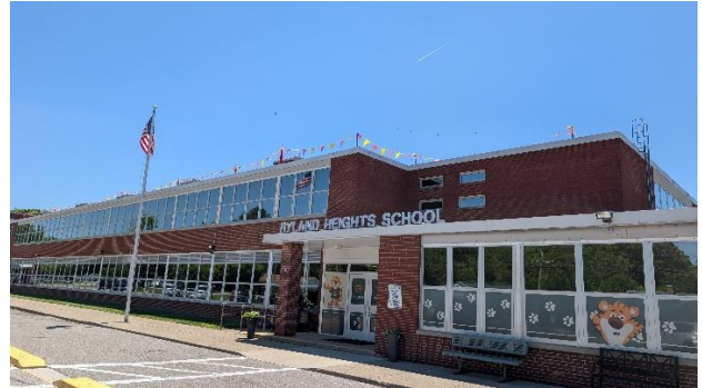
2026.05.12 – Visual Safety perimeter setup on roof