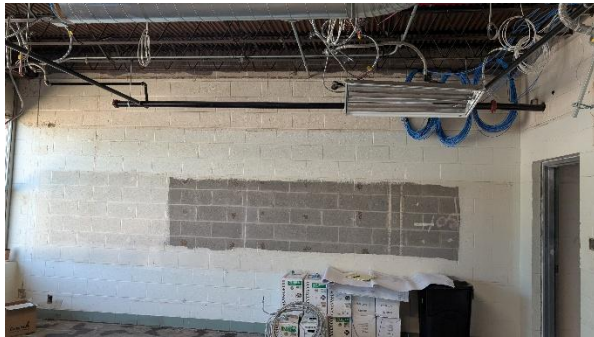
2026.05.12 – Classroom #130 looking east