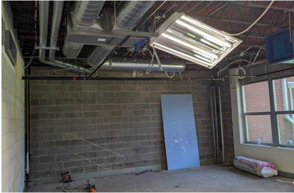
2026.05.12 – Classroom #129 looking east