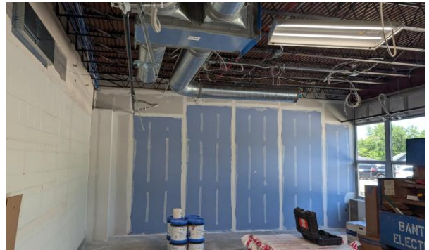
2026.05.12 – Classroom #130 looking west