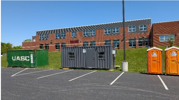
2026.05.12 – Contractor field office, storage, and temporary toilets