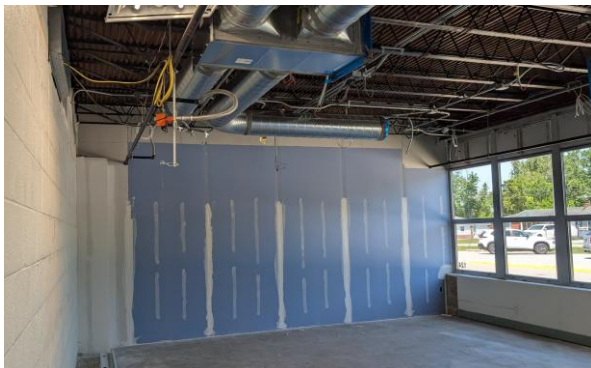
2026.05.12 – Classroom #124 looking west