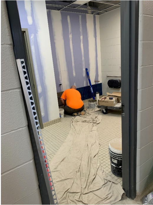
2026.05.05 – Phase 3 ADA restroom