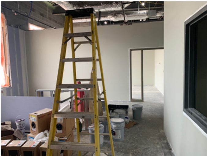
2026.05.05 – New Addition – reception