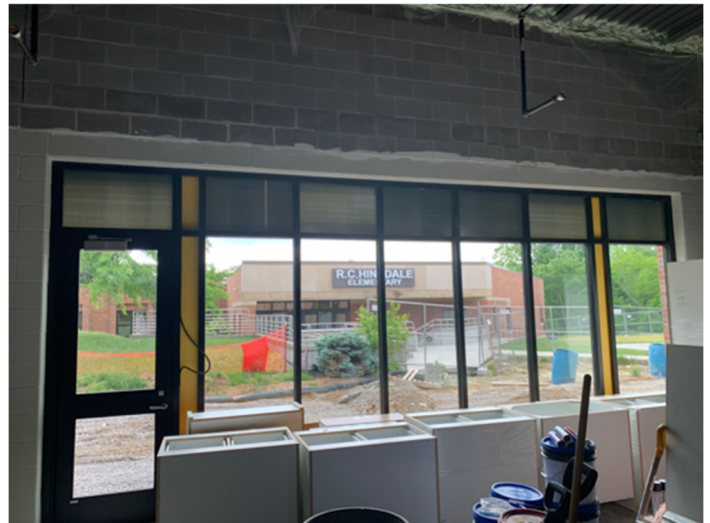
2026.05.05 – New addition – art classroom