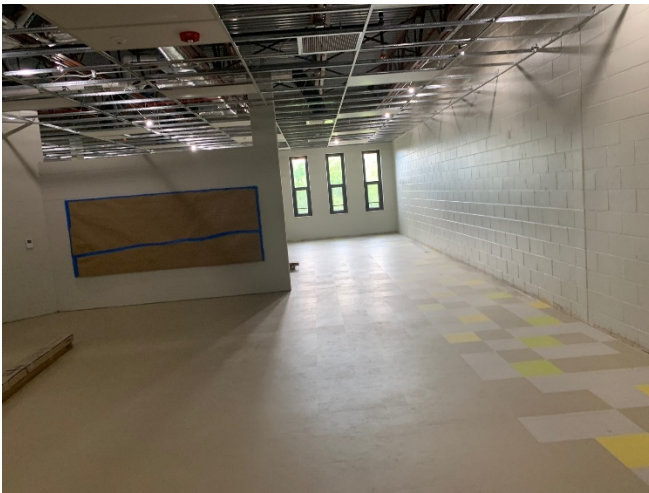
2026.05.05 – Phase 3 kindergarten classroom pod