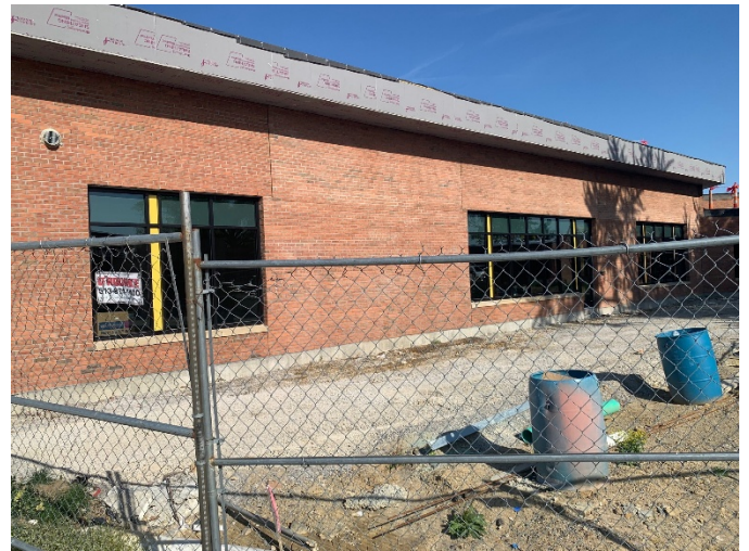
2026.04.21 – Addition east side elevation