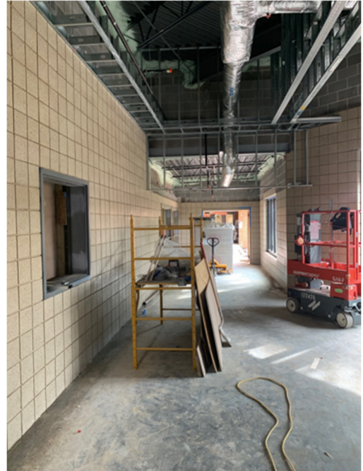
2026.05.05 – Addition main corridor @ ex. bldg