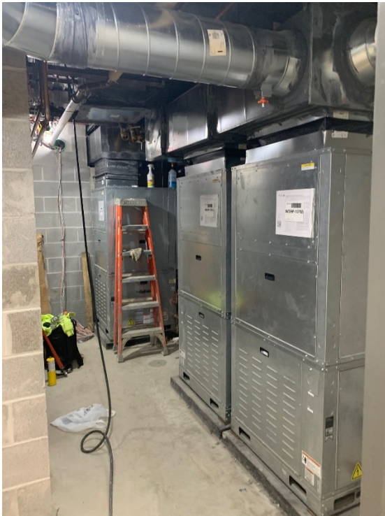
2026.05.05 – Phase 3 mechanical room