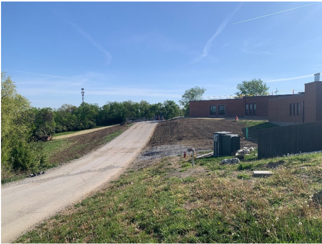
2026.04.21 – Loop road – west side