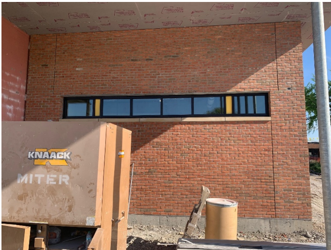
2026.04.21 – Addition front elevation