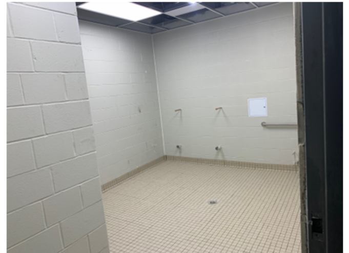
2026.05.05 – Kindergarten bathrooms