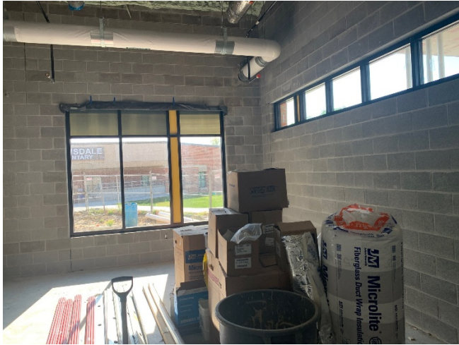
2026.05.05 – New addition – teacher's workroom