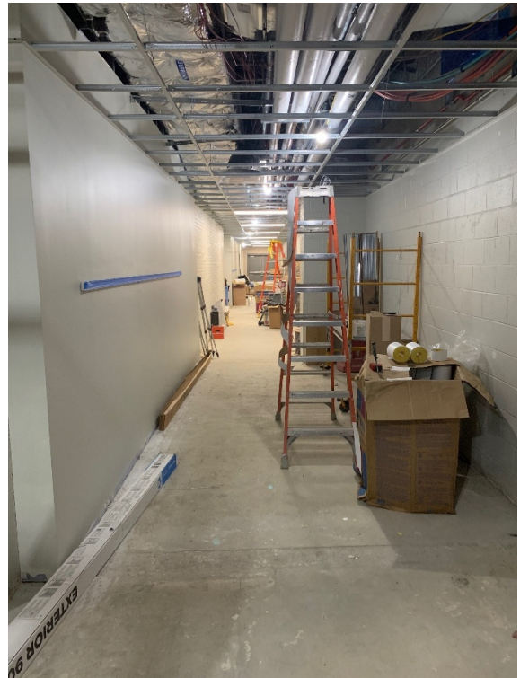
2026.05.05 – Phase 3 corridor