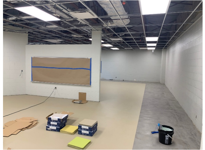
2026.05.05 – Phase 3 classroom pod