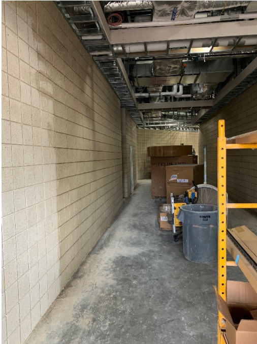
2026.05.05 – Addition main corridor