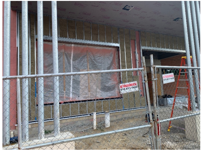
2026.05.05 – Addition front elevation