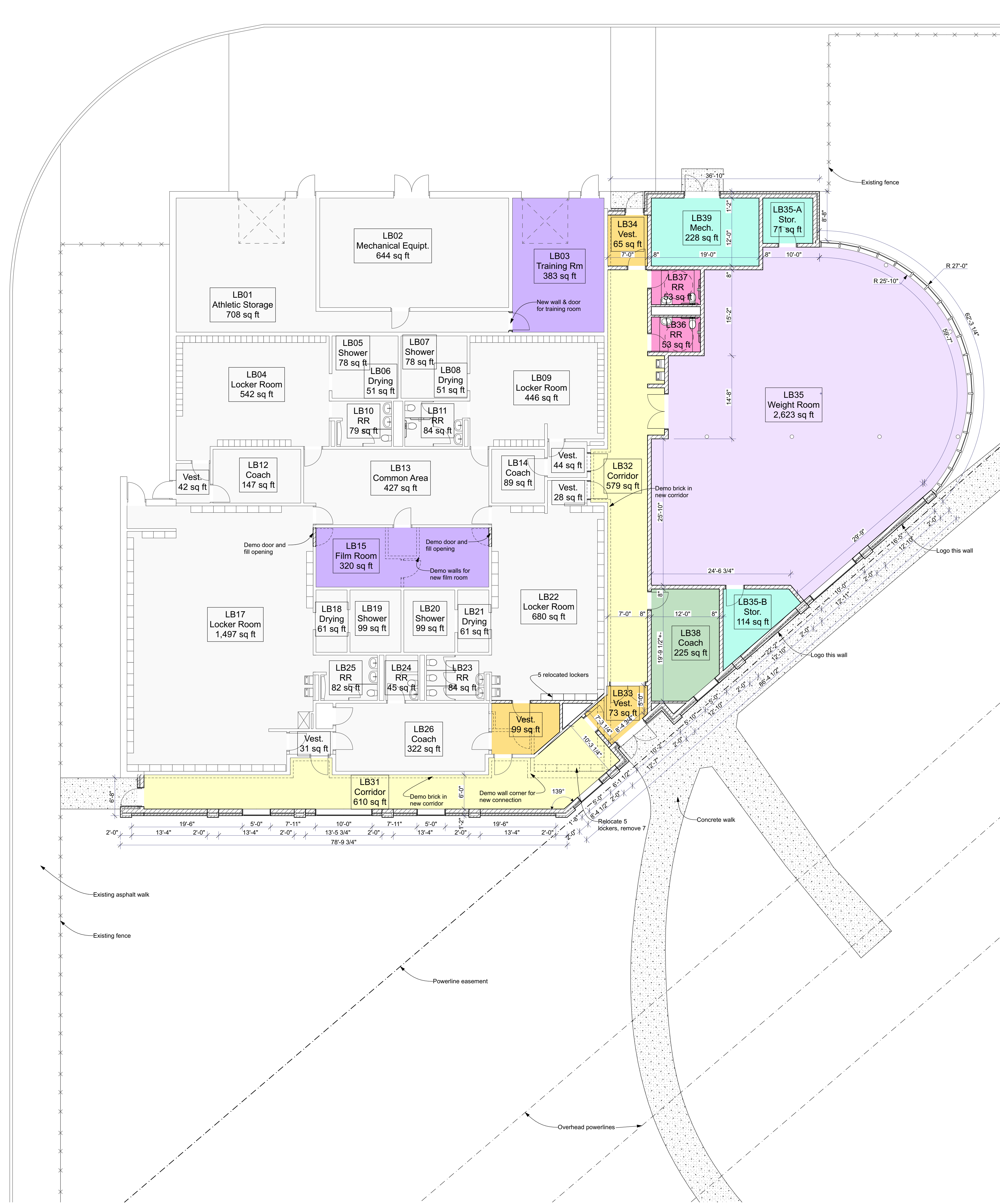
1 Floor Plan / Site Plan A1 Scale: 1/8" = 1'-0"

REH&A ARCHITECTS ROBERT EHMET HAYES & ASSOCIATES, PLLC 465 Centre View Blvd., Crestview Hills, KY 41017 • (859) 331-3121