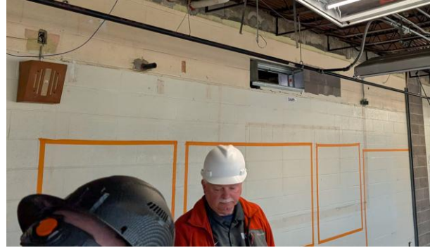
2026.03.30 – Typical Classroom (#126) Mock-up