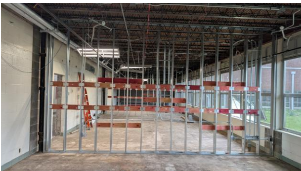
2026.04.14 – Classroom #125 looking east