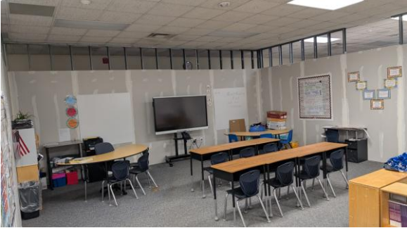
2026.03.30 – Temporary Classroom #5 in Media Center