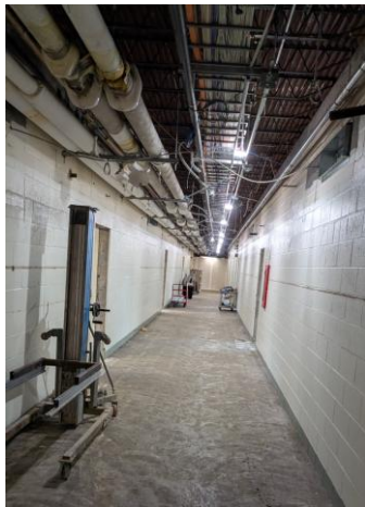
2026.04.14 – Corridor #103 looking west