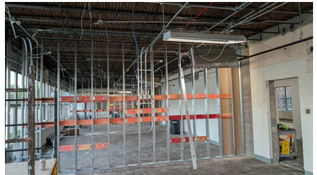
2026.04.14 – Classroom #126 looking east