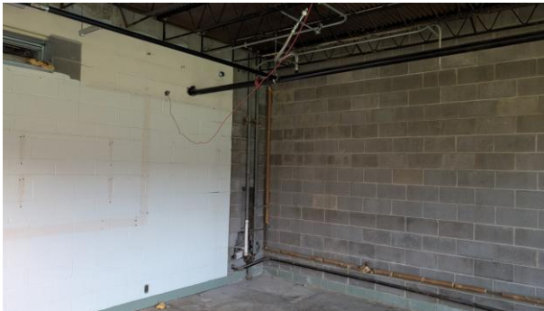
2026.04.14 – Classroom #129 Northeast Corner