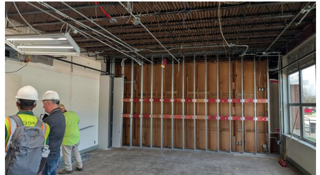
2026.04.14 – Classroom #124 looking west