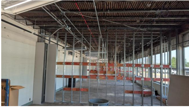
2026.04.14 – Classroom #130 looking west