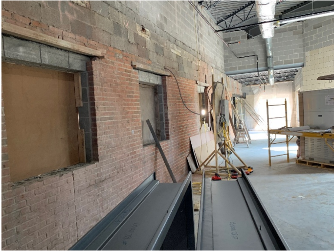
2026.04.07 – New window/door openings to exist corridor