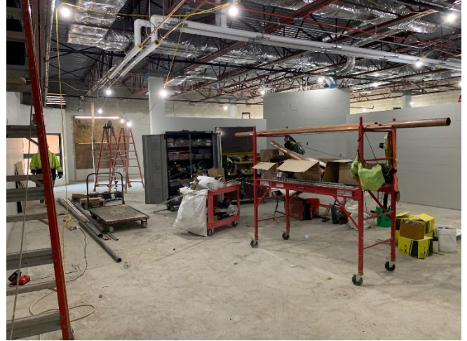
2026.04.07 – Phase 3 Kindergarten pod