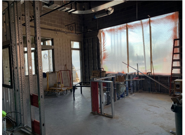
2026.04.07 – New addition reception area