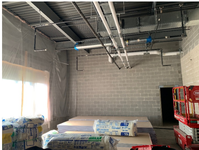
2026.04.07 – New addition – Art classroom