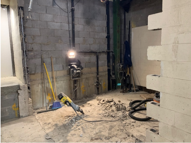
2026.04.07 – Phase 3 boys bathroom