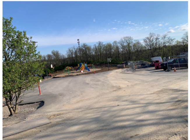
2026.04.17 – Rear playground