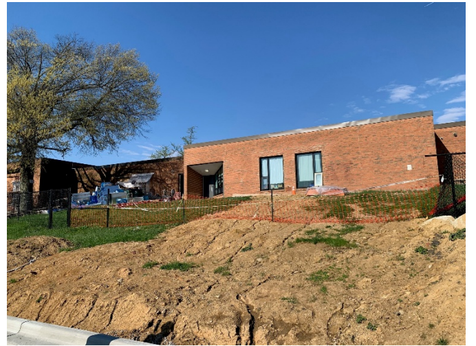
2026.04.07 – Phase 3 new windows