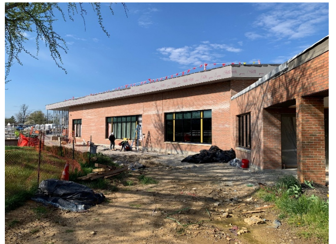
2026.04.07 – New addition – east elevation