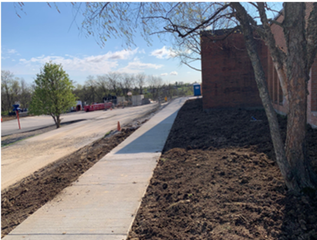
2026.04.17 – New concrete sidewalk from classrooms