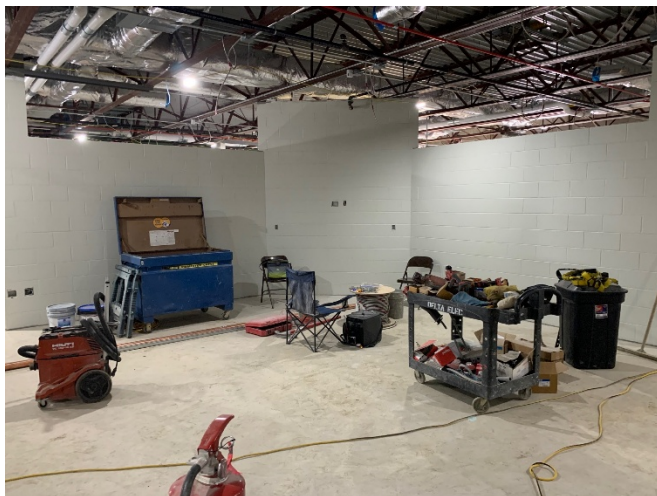
2026.04.07 – Phase 3 typical classroom pod