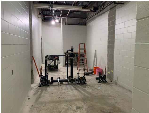
2026.04.07 – Phase 3 Kindergarten bathrooms