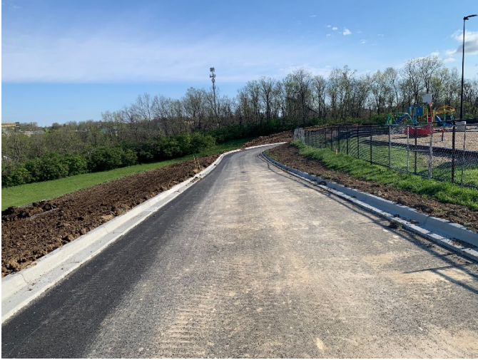
2026.04.07 – Loop road – west side looking north