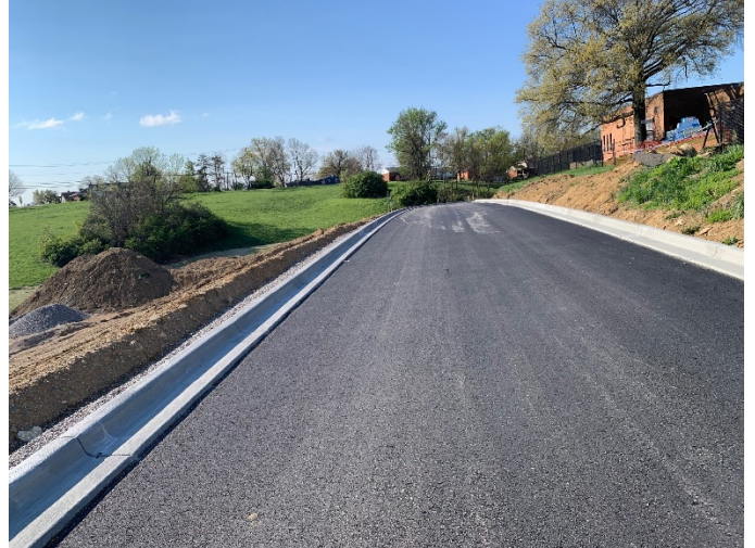
2026.04.07 – Loop road – east side looking south