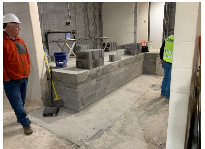
2026.04.07 – Phase 3 boys bathroom