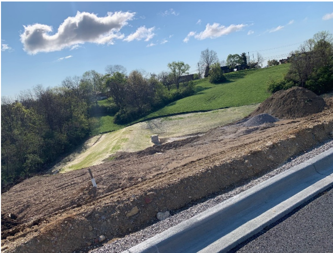
2026.04.07 – Retention basin