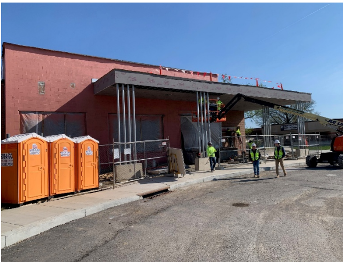
2026.04.07 – New Addition – front entry