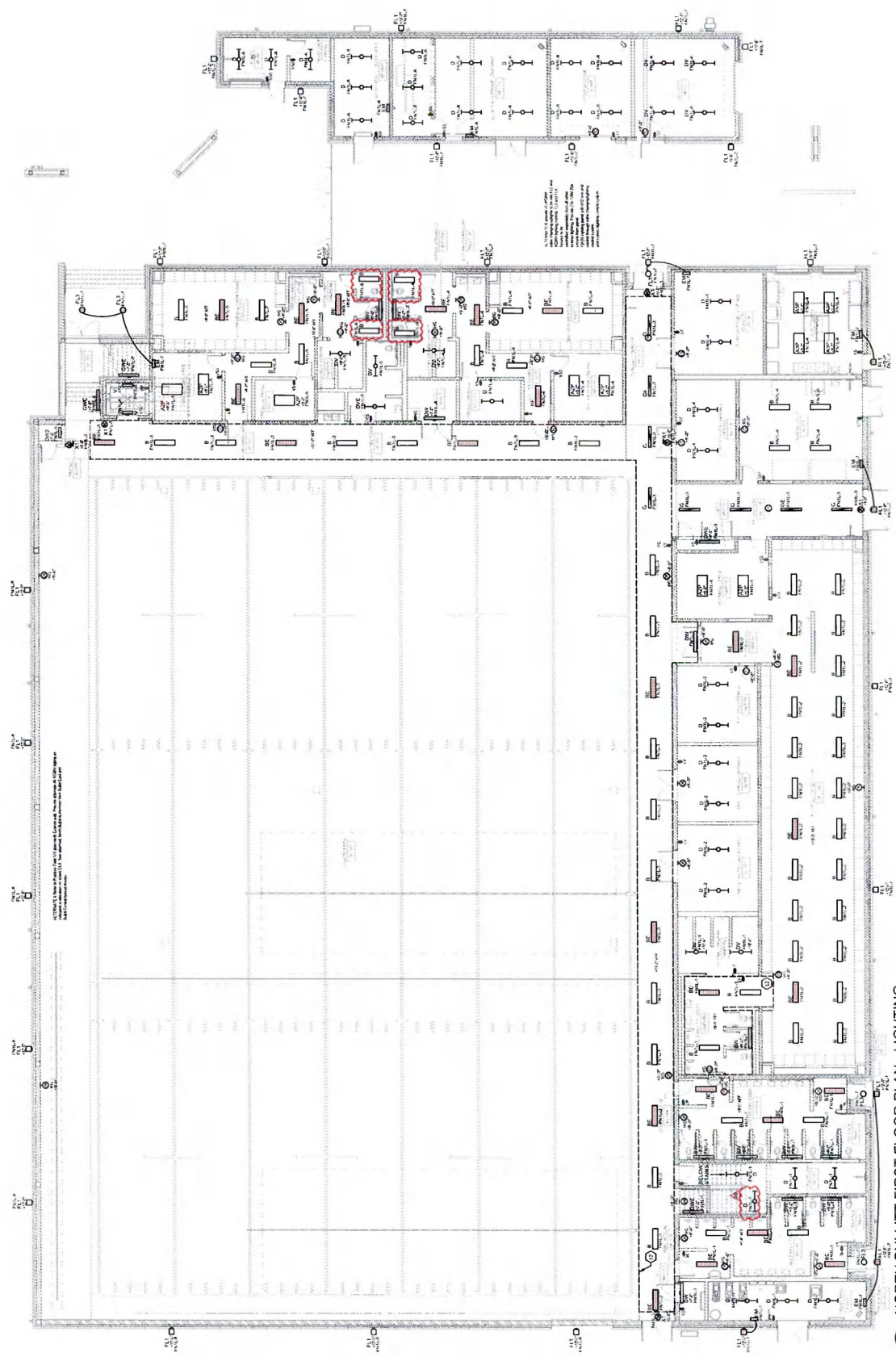
1 NORTH BULLITT FIRST FLOOR PLAN - LIGHTING SCALE: 3/8" = 1'-0"