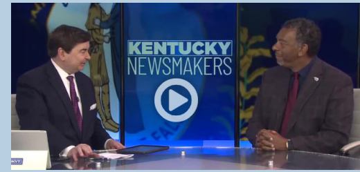
Kentucky Newsmakers, March 15