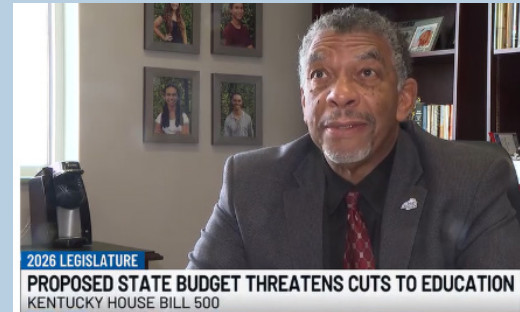
WKYT, Spectrum News, March 4