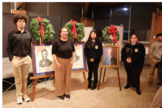
A group of people standing in front of a group of portraits during the Gallaudet & Clerc Banquet.