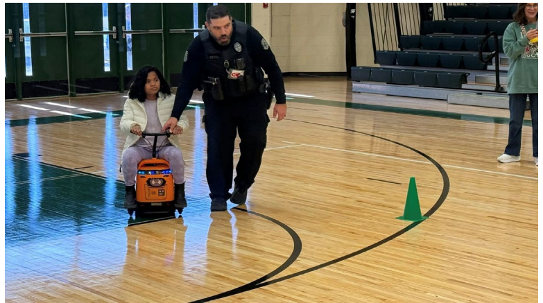
A KSD SRO pushing a child on a machine scooter during an informative presentation on the importance of safe driving.