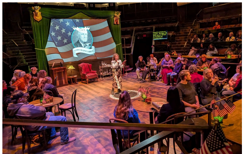
A person on stage with a crowd of people when the Actors Theatre of Louisville hosted the middle and high school Colonels for a showing of "FDR's Very Happy Hour."