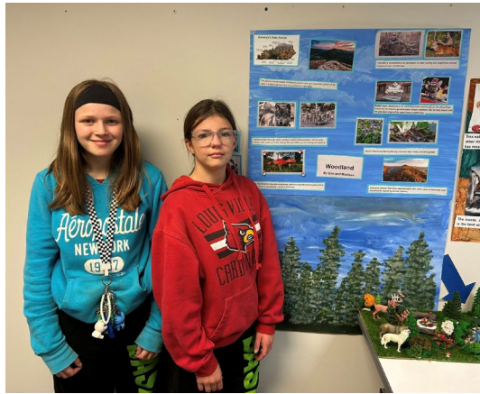
Two girls standing next to a storyboard during the Storyboard Exposition.