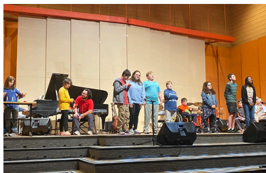
KSB students on stage at the start of the fall concert "You are the Music in Me."