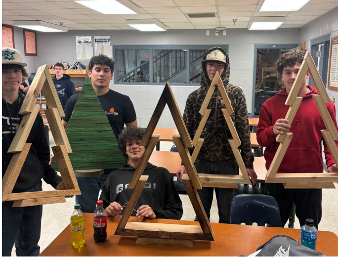
Monroe County ATC carpentry students show off their 2025 holiday projects.

Monroe County ATC carpentry students embraced the 2025 holiday season by creating festive projects that showcased advanced craftsmanship. Through these builds, they mastered precise measurement and layout techniques, accurate length and angle cuts, and the proper use of hand and power tools. Students practiced fastening methods including nailing, screwing and countersinking, with attention to structural integrity and finish quality. Students applied problem-solving skills to repurpose scrap lumber efficiently, reinforcing concepts of material optimization and sustainable practices.