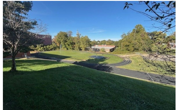
KSB's athletic field is ready for use in early spring. The site has been regraded and covered in sod with new long jump, triple jump and shot-put areas.