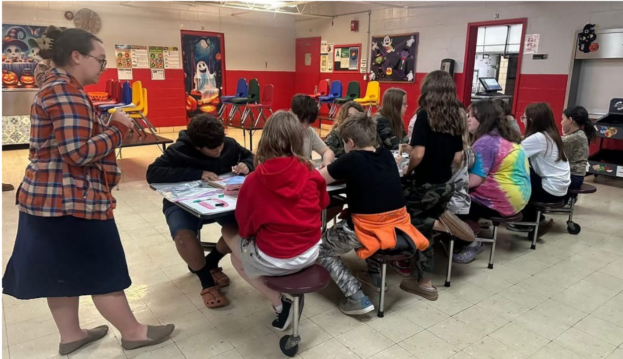
Clay County ATC Health partnered with Big Creek Elementary to teach the importance of hygiene.