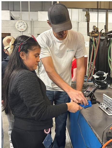
A student gets assistance while working in robotics, engineering and manufacturing during a visit to Bluegrass Community & Technical College (BCTC) to explore their Robotics and Advanced Manufacturing programs.