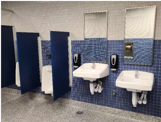
2026.01.21 – New finishes in Boys Restroom