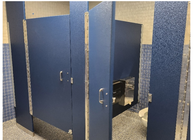
2026.01.21 – New finishes in Girls Restroom