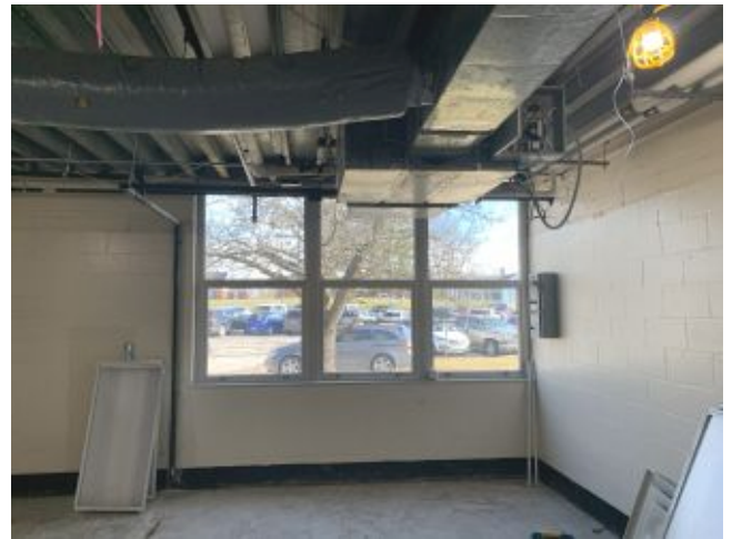
2026.01.08 – Resource #138