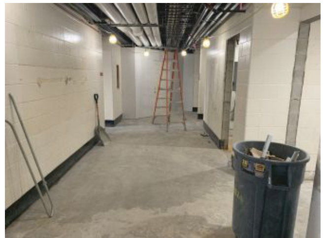
2025.01.08 – Looking towards phase 2