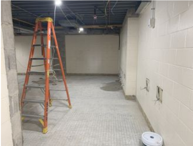
2026.01.08 – Boys #128