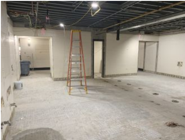
2026.01.08 – Girls #127 and Boys #128