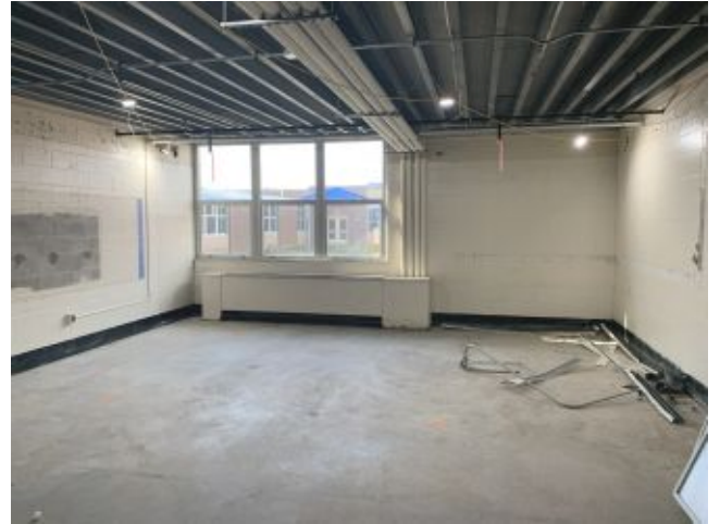
2026.01.08 – Classroom #130