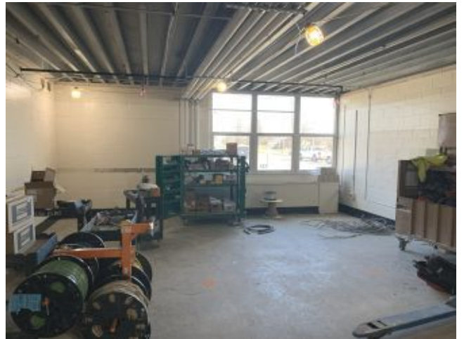
2026.01.08 – Classroom #133