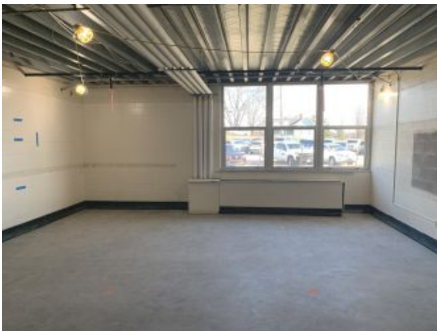
2026.01.08 – Mockup Classroom #135