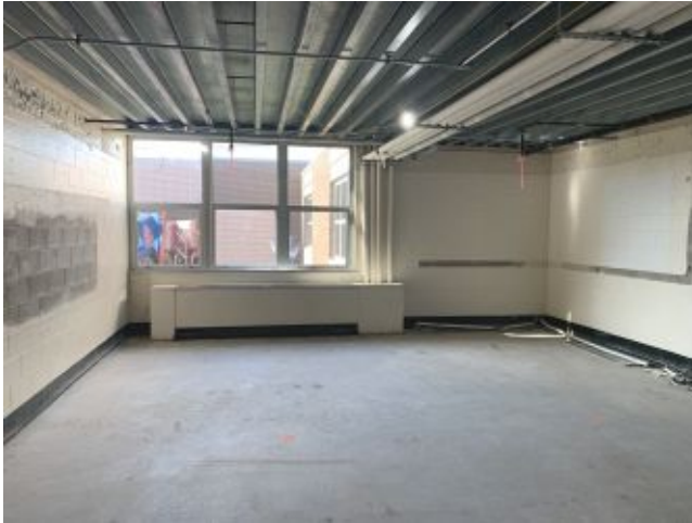
2026.01.08 – Classroom #131