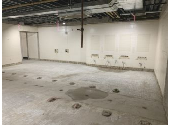
2026.01.08 – Girls #127 from Boys #128