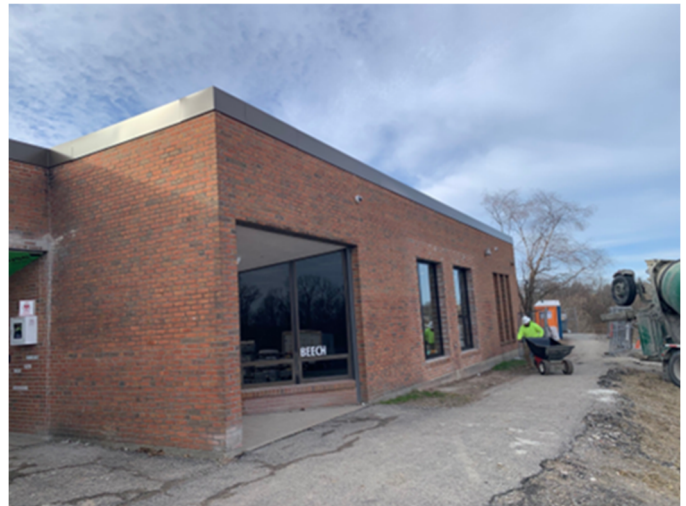
2026.01.13 – New metal fascia and windows