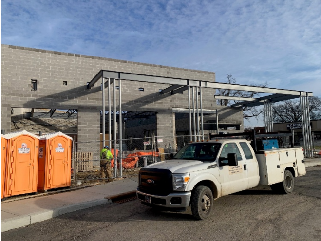
2026.01.13 – New addition canopy framing