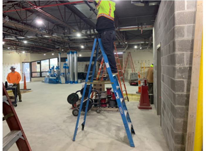
2026.01.13 – Phase 2 Media center