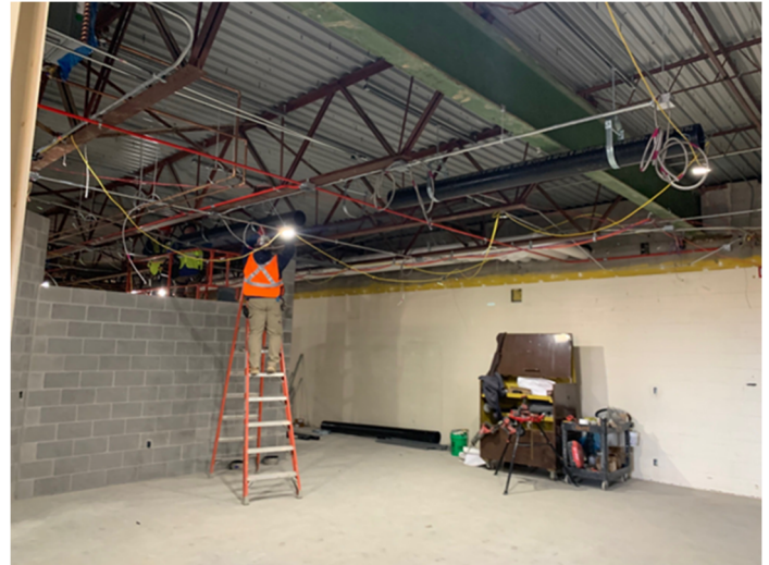
2026.01.13 – Phase 2-Classroom-storm piping