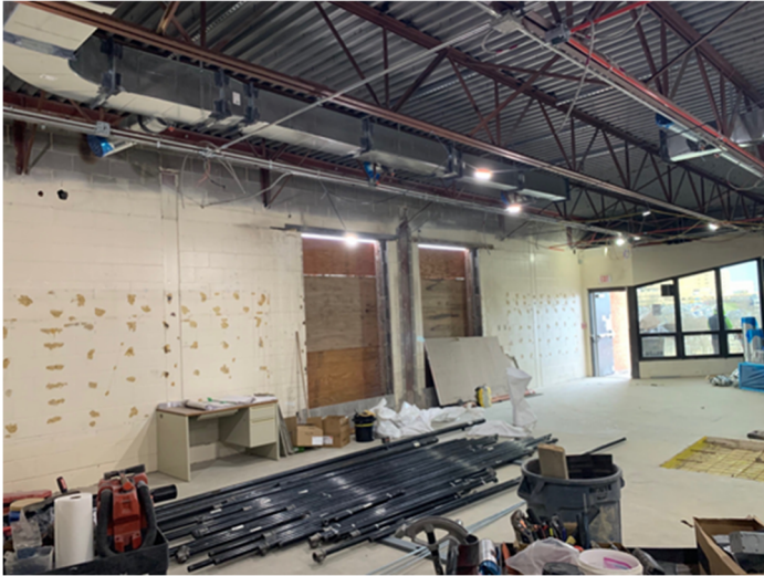
2026.01.13 – Phase 2 Media center