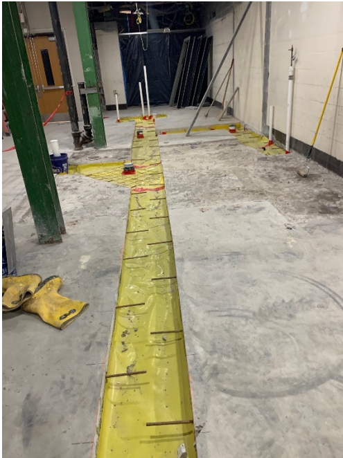
2026.01.13 – Phase 2 Bathrooms underslab rough-in