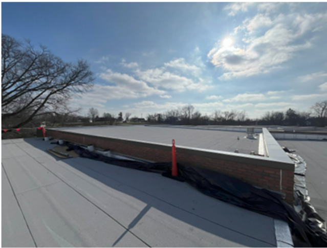
2026.01.13 – New replacement roofing and copings