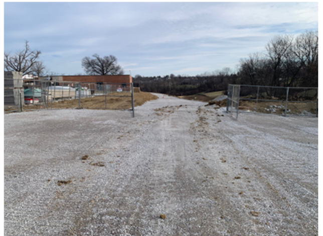
2026.01.13 – Loop road stone base