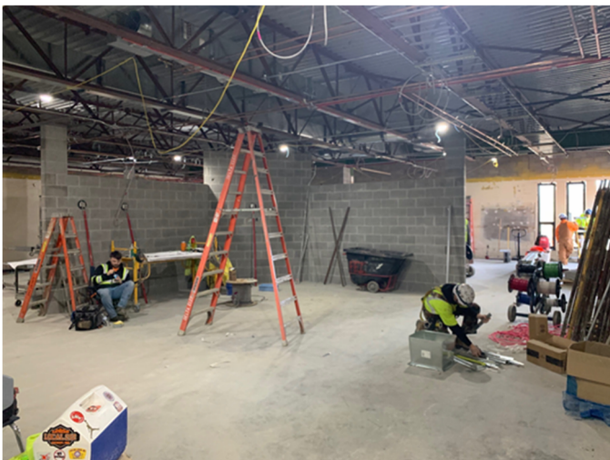
2026.01.13 – Phase 2 classroom