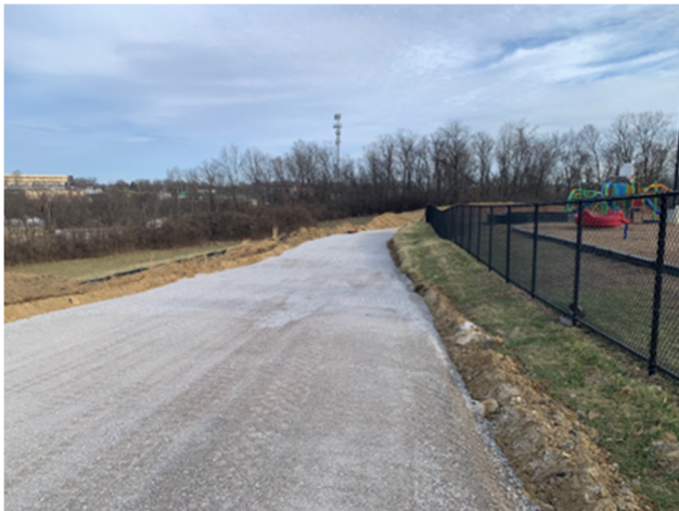
2026.01.13 – Loop road stone base