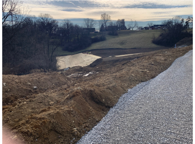
2026.01.13 – Straw mat installation at retention basin