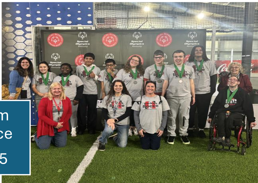
Team Bocce 2025