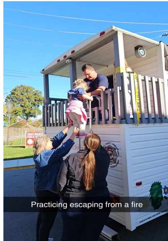
Practicing escaping from a fire