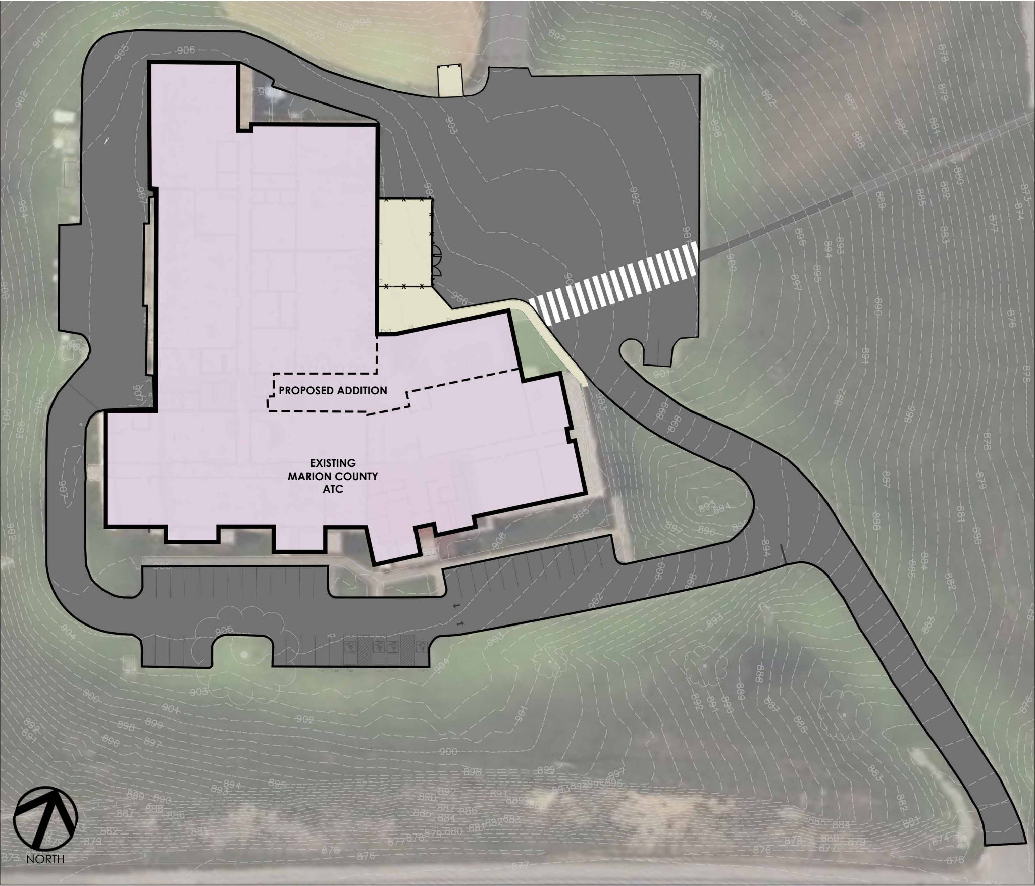
MARION COUNTY AREA TECHNOLOGY CENTER - SITE DEVELOPMENT LEBANON, KENTUCKY