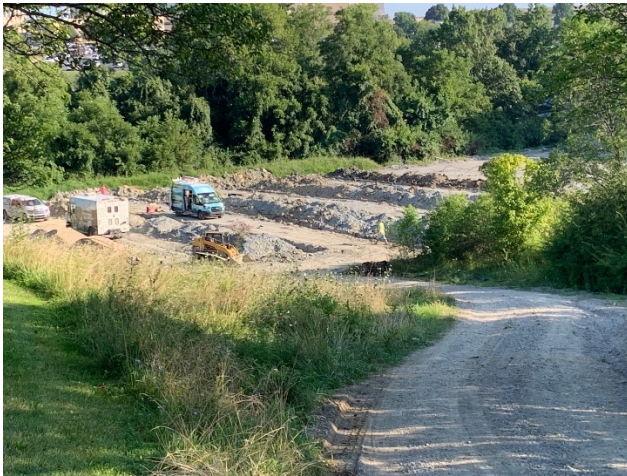
2025.08.13 – Geothermal well field.

33.01: Storm piping and head wall on west side of school has been replaced