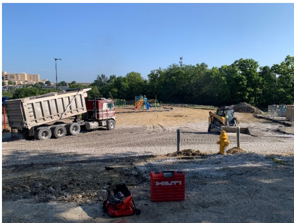
2025.08.13 – Rear playground stone base