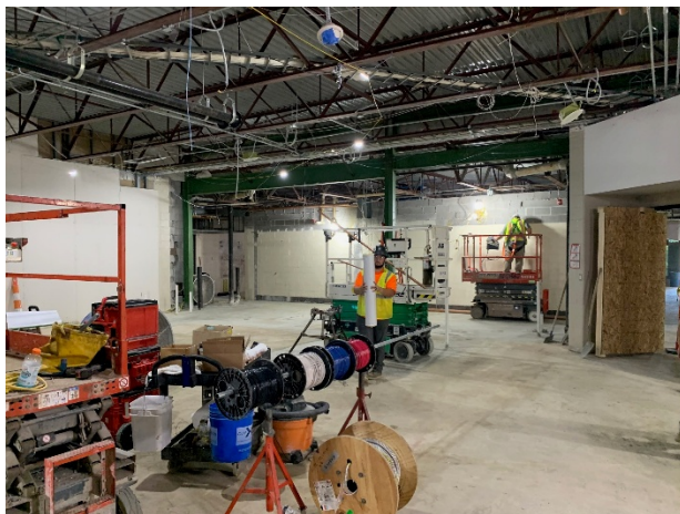
2025.08.13 – Bathroom underslab plumbing roughin