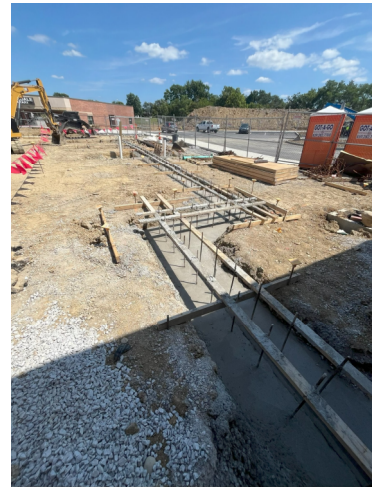
2025.08.13 – New addition footings