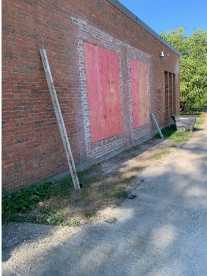
2025.08.13 – New classroom window openings-exterior view