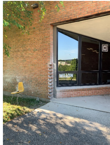
2025.08.13 – Brick tuckpointing/repair