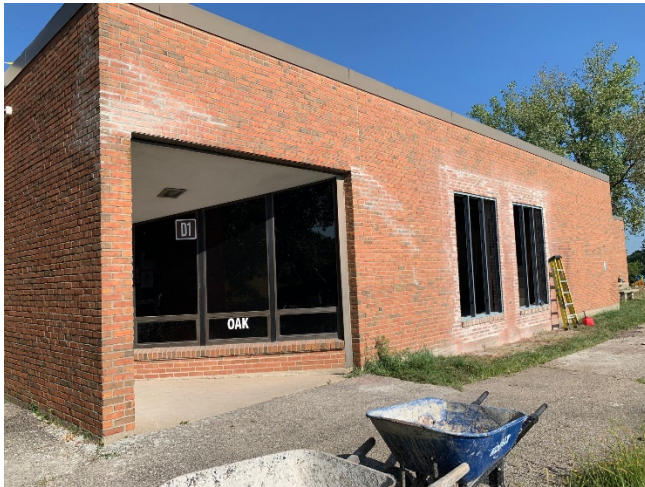
2025.87.13 – Brick tuckpointing/repair