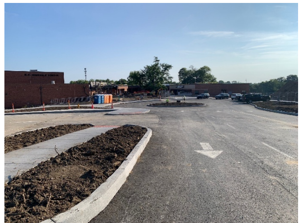
2025.08.13 – Completed new bus loop