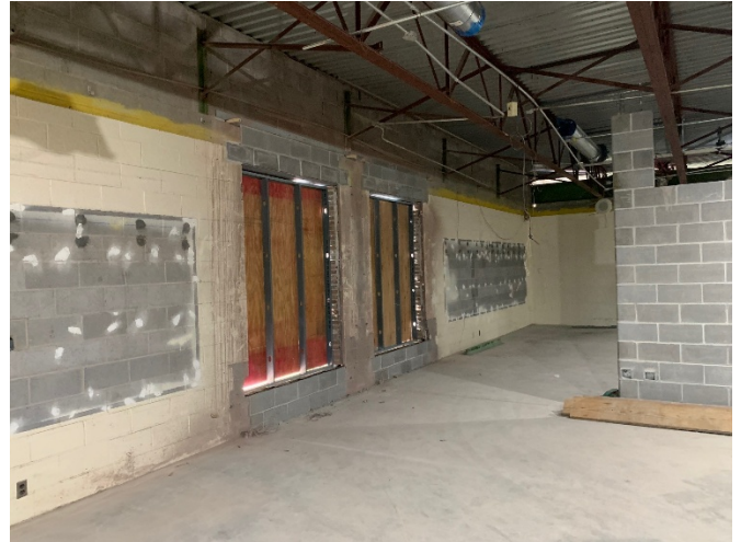
2025.08.13 – New classroom window openings – interior view