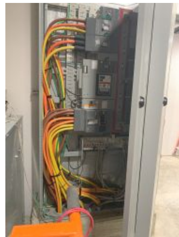
2025.05.27 – Electrical #120