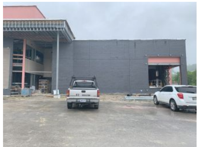
2025.05.27 – Exterior from southwest