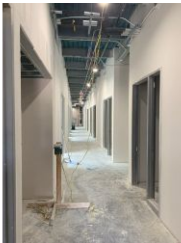
2025.06.10 – First floor east corridor, looking south