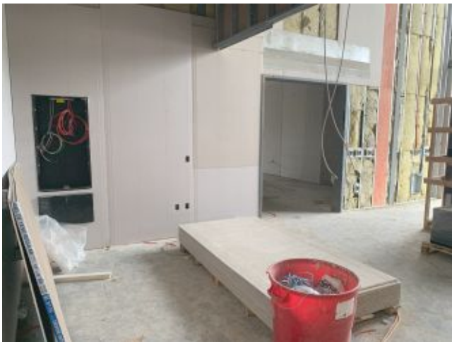
2025.05.27 – Entry Lobby / Reception Desk area