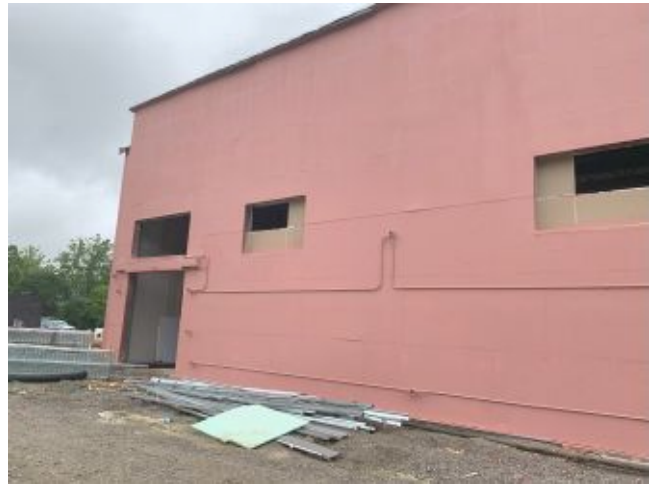
2025.05.27 – East elevation, south end