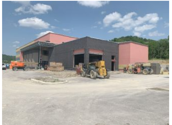
2025.06.10 – Exterior from southwest