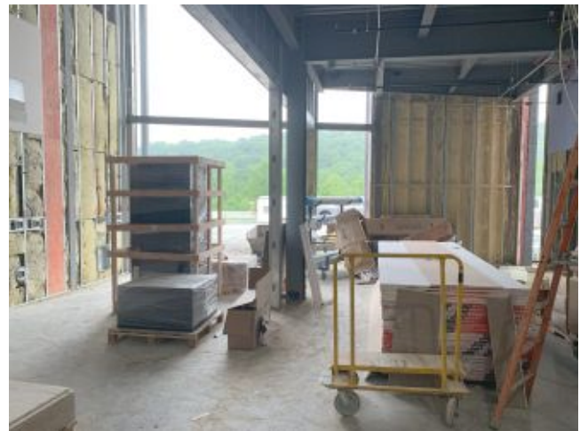
2025.05.27 – Entry Lobby / Vestibule