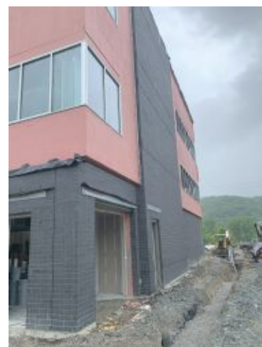
2025.05.27 – North elevation from northeast