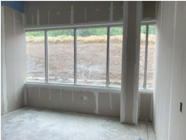
2025.05.27 – Office #159