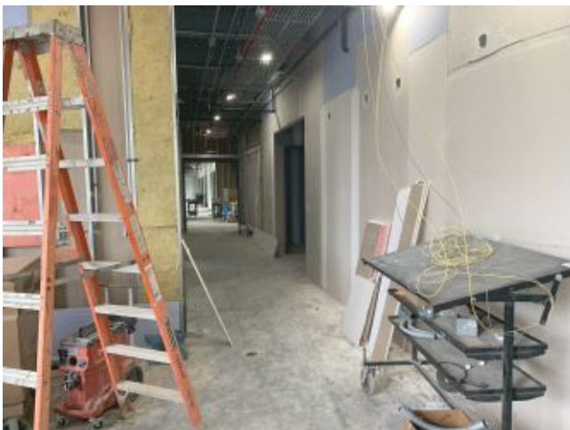
2025.05.27 – Corridor 100B