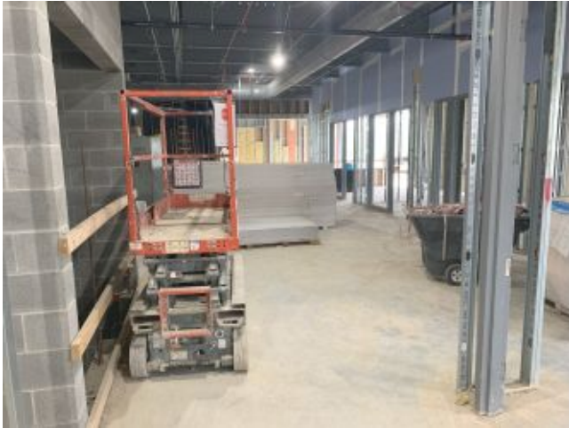
2025.05.27 – Open Office #2021