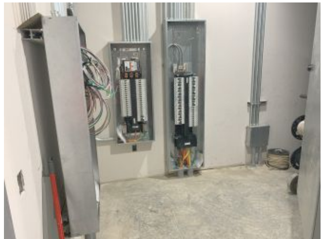
2025.05.27 – Electrical #120