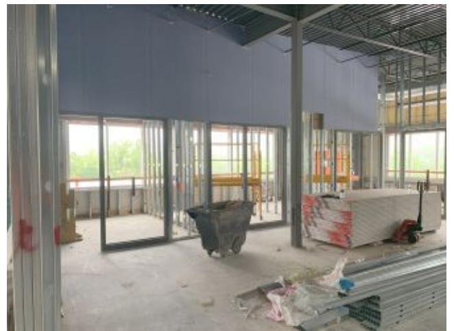
2025.05.27 – Open Office #301