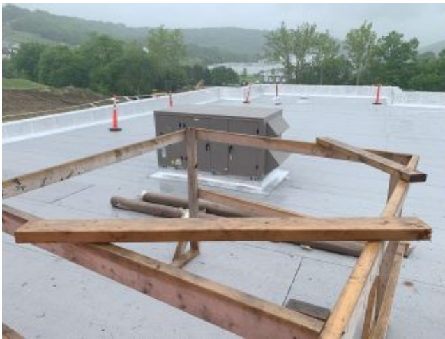
2025.05.27 – Roof over board room