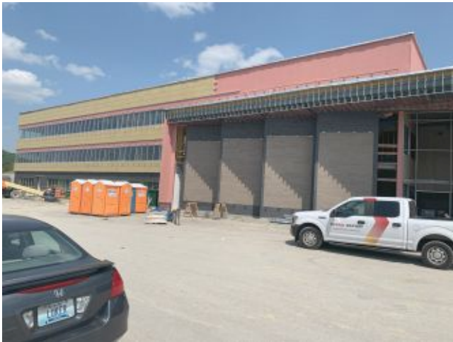
2025.06.10 – Exterior from southwest