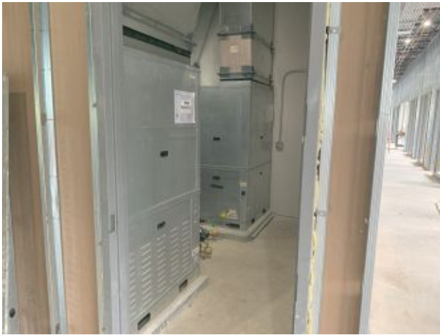
2025.05.27 – Mechanical #354