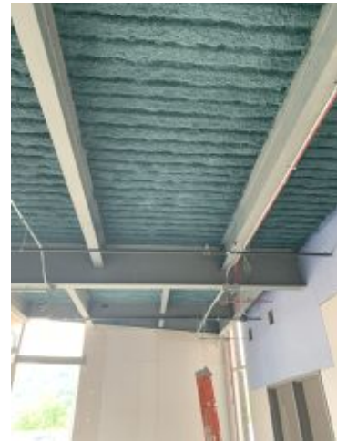
2025.06.10 – Entry lobby