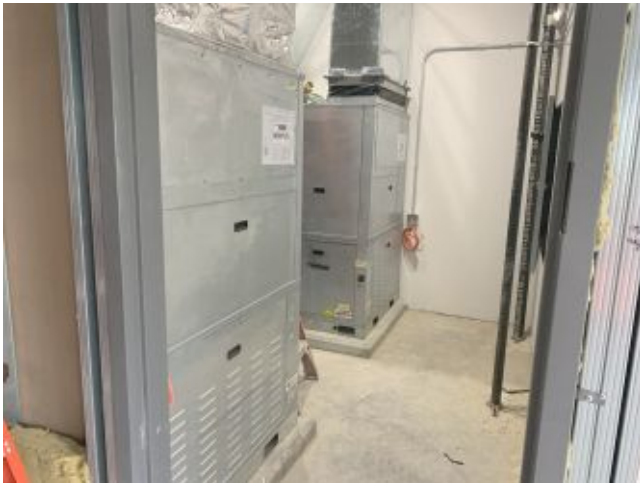
2025.05.27 – Mechanical #216