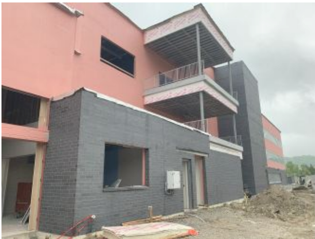
2025.05.27 – East elevation, south end