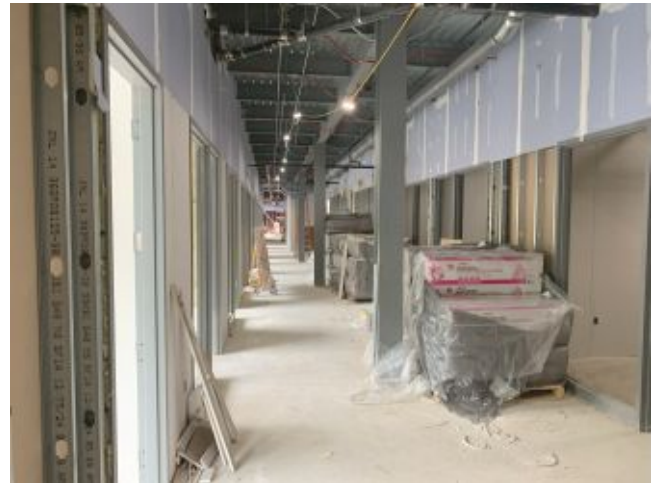
2025.05.27 – Second floor east corridor, looking south