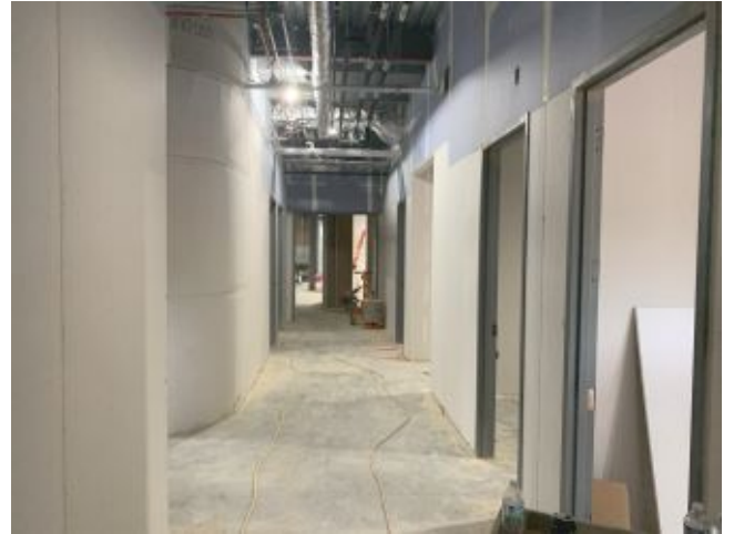
2025.05.27 – Corridor #100C