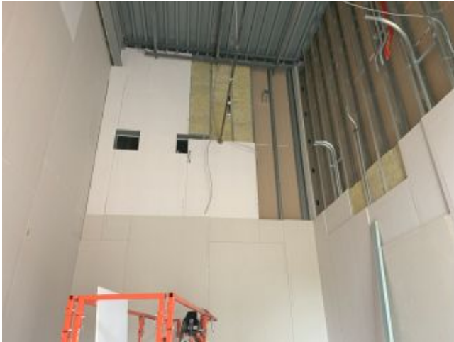
2025.05.27 – Board Conference #104