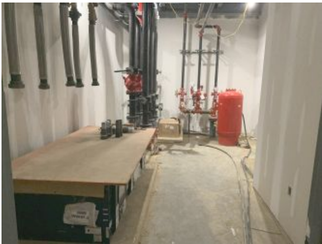
2025.05.27 – Mechanical #119