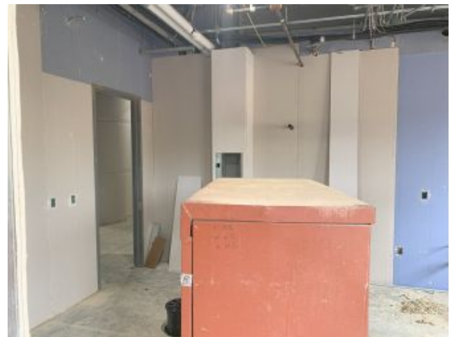
2025.05.27 – Catering #105