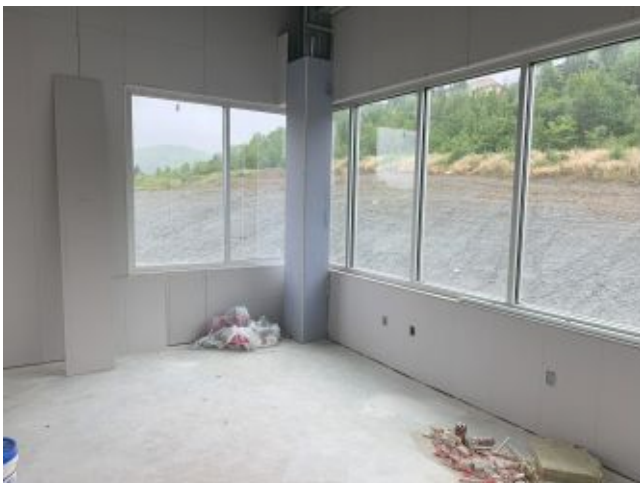
2025.05.27 – Office #233