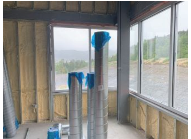
2025.05.27 – Office #339