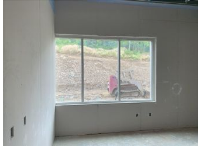
2025.05.27 – Office #160