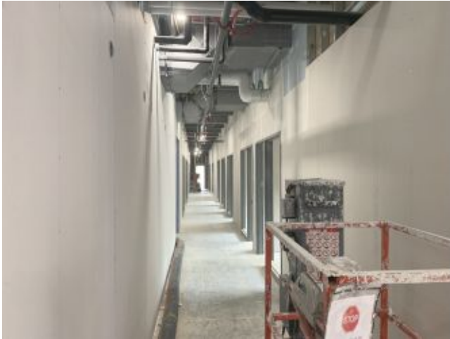
2025.05.27 – First floor east corridor, looking north