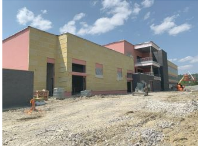
2025.06.10 – Exterior from southeast