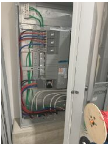
2025.05.27 – Electrical #120