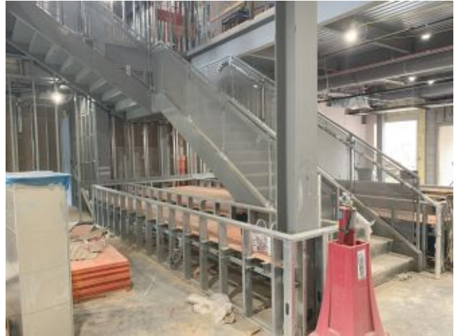
2025.05.27 – Open stair