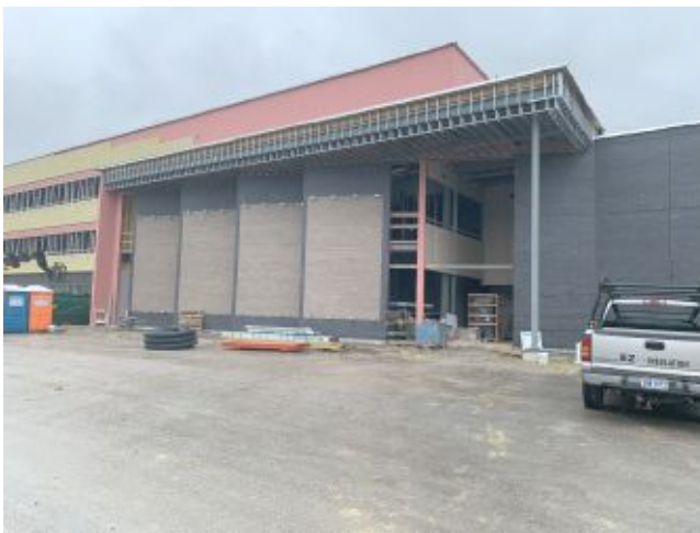
2025.05.27 – Exterior from southwest