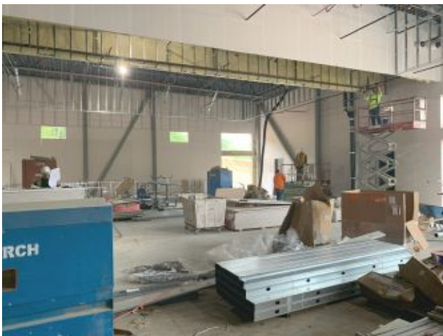
2025.05.27 – Southeast corner of board room