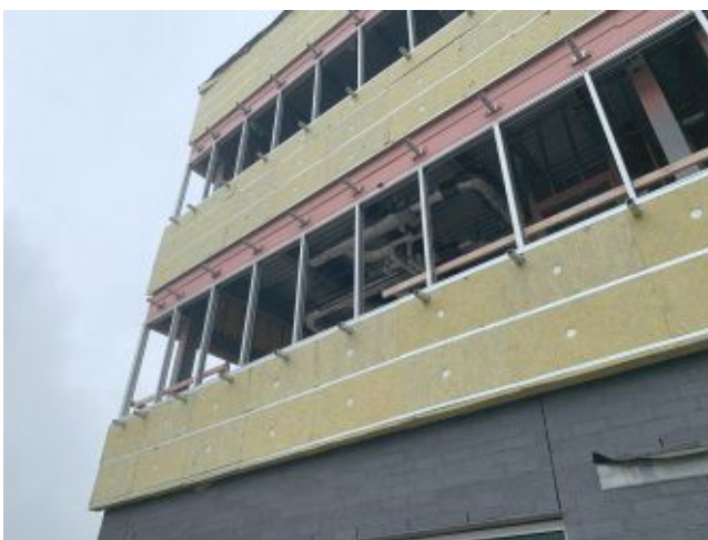
2025.05.27 – West elevation, north end