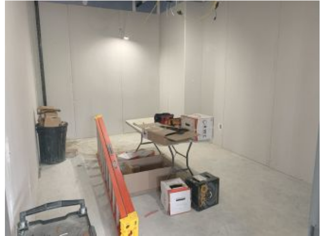
2025.05.27 – Storage #219