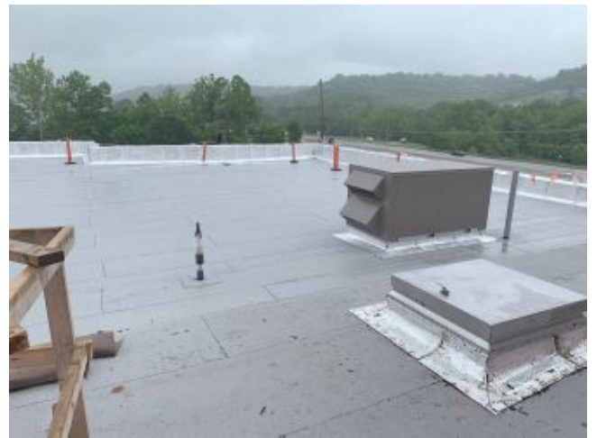
2025.05.27 – Roof over board room