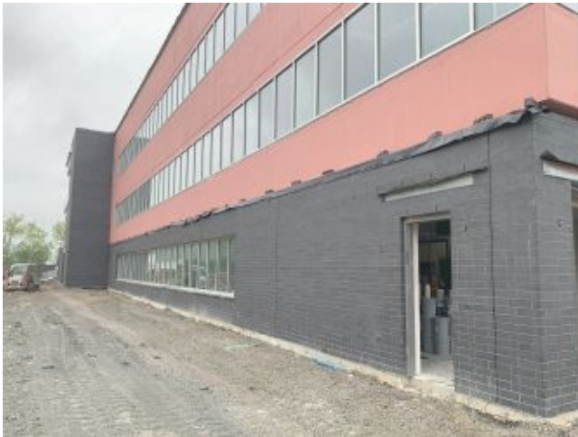
2025.05.27 – East elevation from northeast