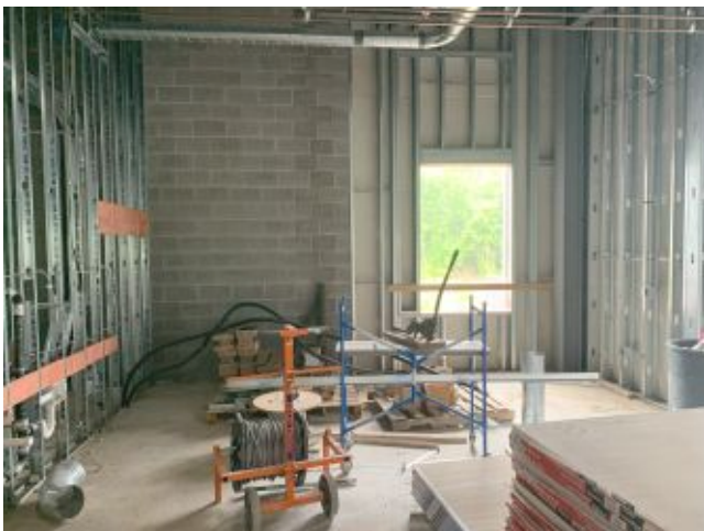
2025.05.27 – Kitchen / Break #305