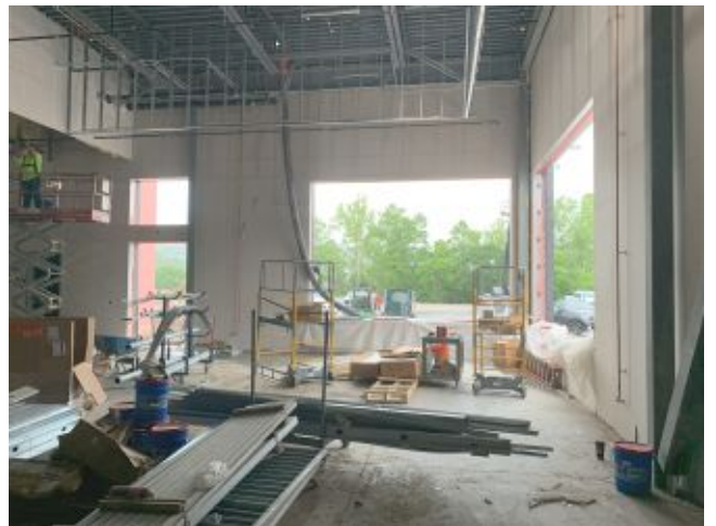
2025.05.27 – Southwest corner of board room