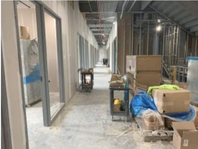
2025.05.27 – First floor west corridor, looking north