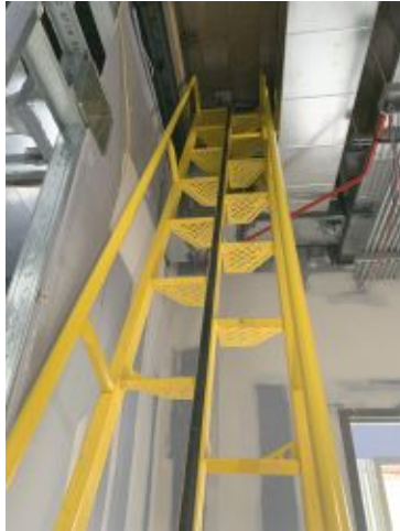
2025.06.10 – Third floor roof ladder