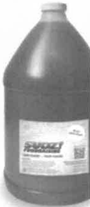
Blue Liquid Dish Soap