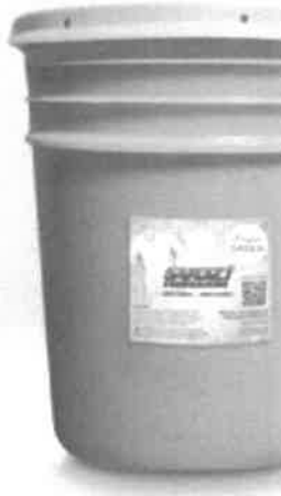
Green Laundry Detergent