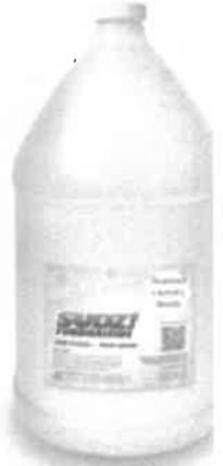
Scented Laundry Beads