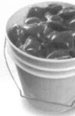
Laundry Detergent Packs