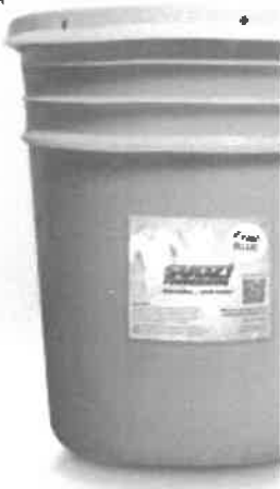
Blue Laundry Detergent