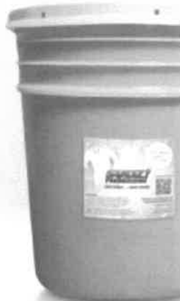
Fabric Softener – Original