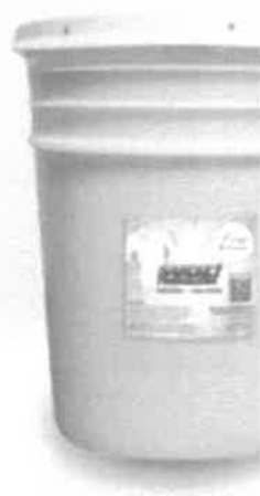
Free and Clear Laundry Detergent