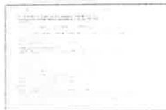
File facpac06-02].pdf JOHN HAGAN CODELL