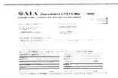
File aia template for proj... JOHN HAGAN CODELL