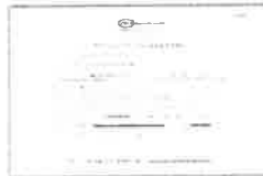
File OKI Price.pdf JOHN HAGAN CODELL