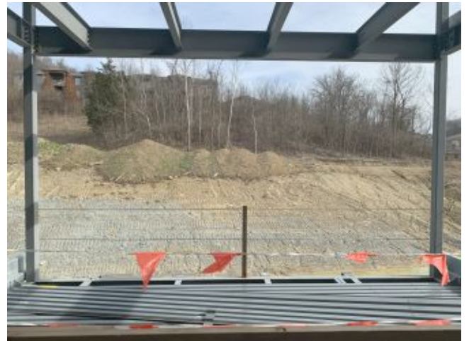
2025.03.04 – Looking out towards Outdoor Patio #252