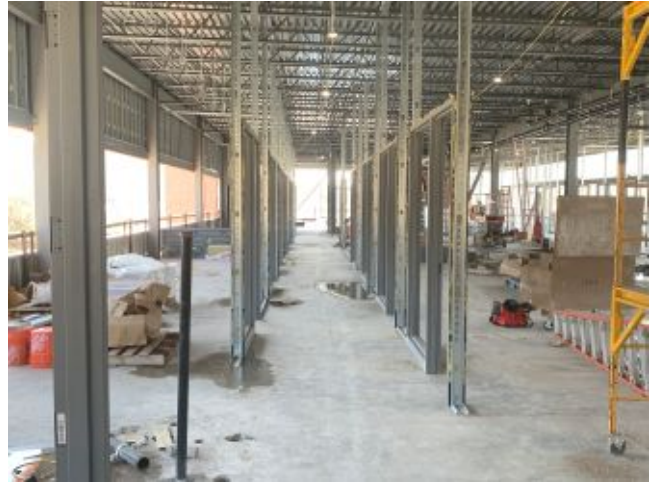
2025.03.18 – Third floor, west corridor, looking north