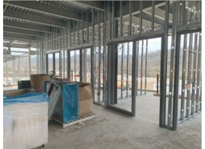
2025.03.04 – Offices #204-#206