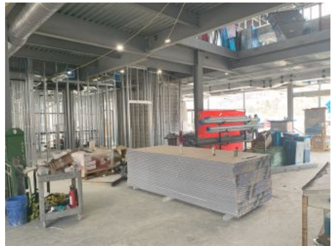
2025.03.04 – Looking southwest towards Work room #122