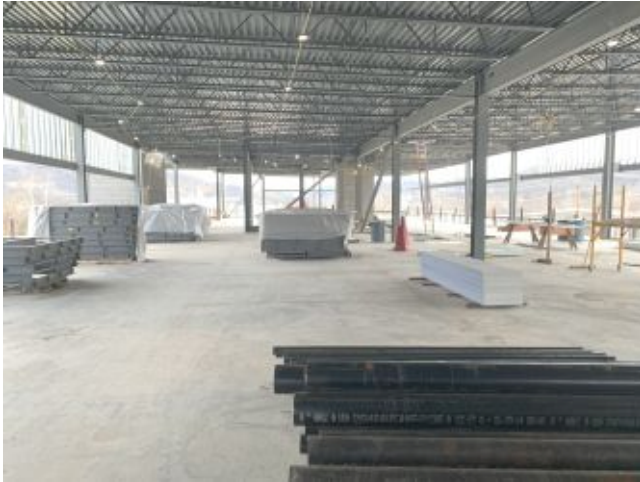
2025.03.04 – Third floor looking south