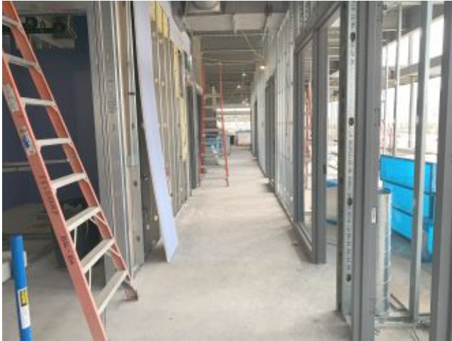
2025.03.04 – Second floor, west corridor, looking south