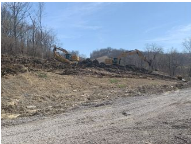
2025.03.18 – Drying grading materials