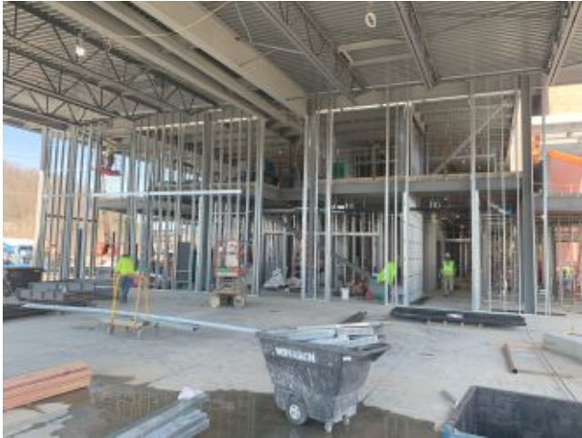
2025.03.18 – Board Room looking north