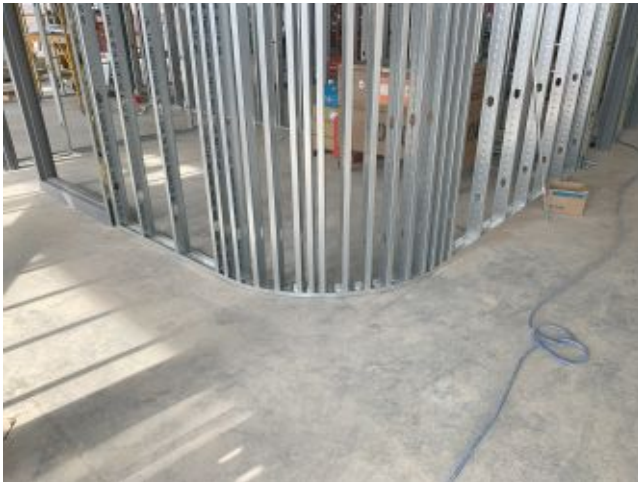
2025.03.04 – Corner of Huddle Room #115