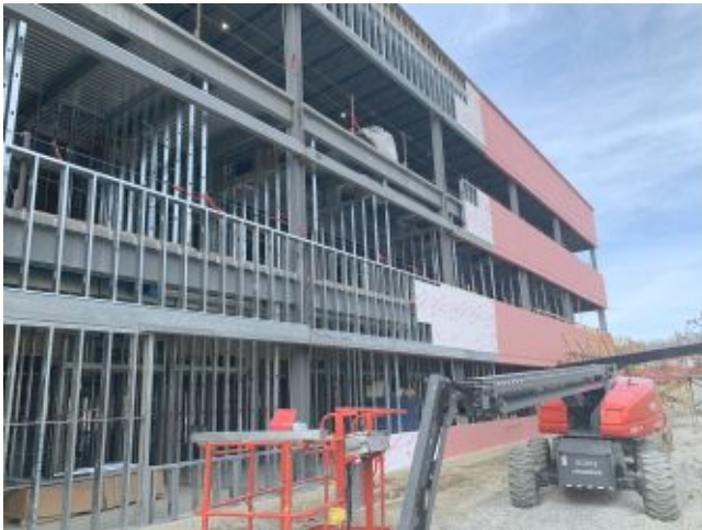
2025.03.04 – Exterior east elevation