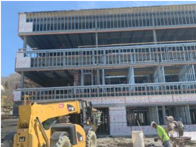
2025.03.18 – Exterior west elevation