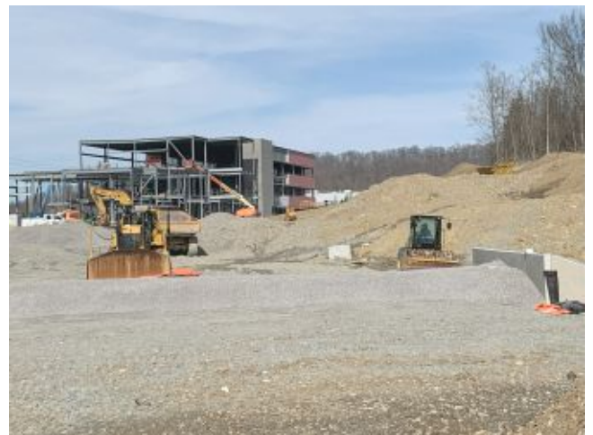
2025.03.04 – Site from southeast