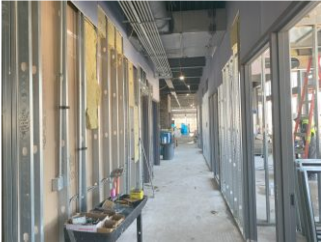
2025.03.18 – Second floor west corridor