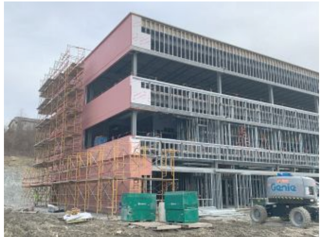
2025.03.04 – Exterior north elevation