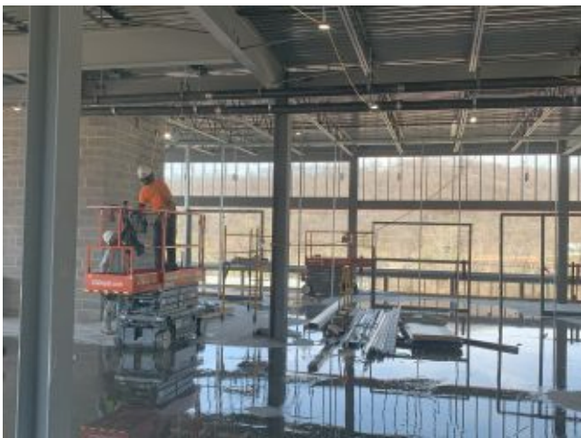
2025.03.18 – Third floor looking east