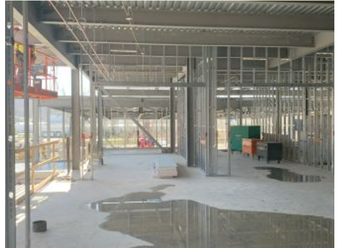
2025.03.18 – Second floor looking towards Break #210