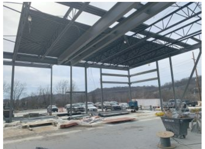
2025.03.04 – Board Room looking southwest