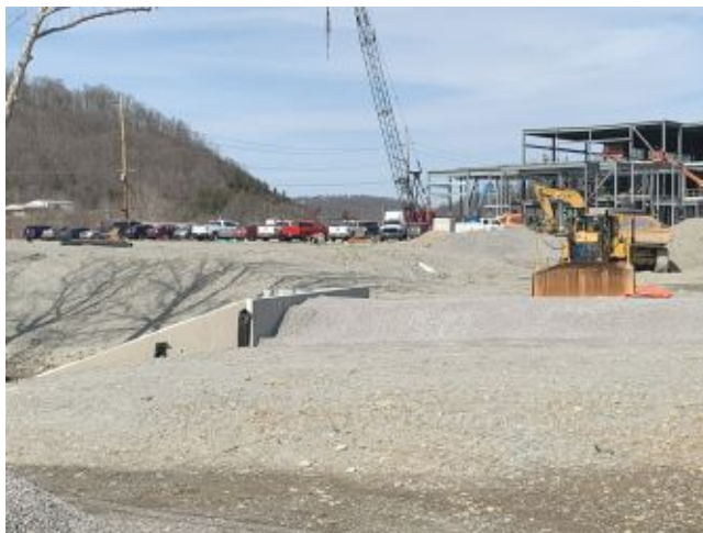
2025.03.04 – Site from southeast

32.01: 2025.03.18 – Remaining storm structures were staged on-site for installation.