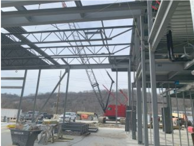
2025.03.04 – Board Room looking west