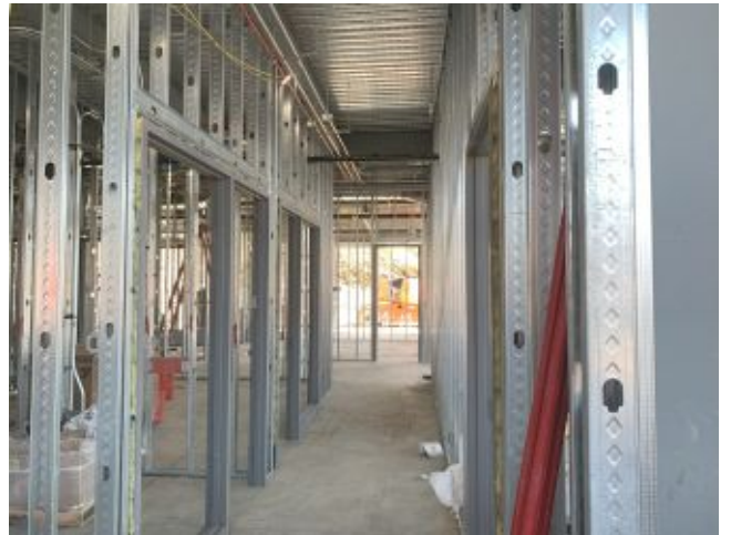
2025.03.18 – Looking towards Safety Office #116