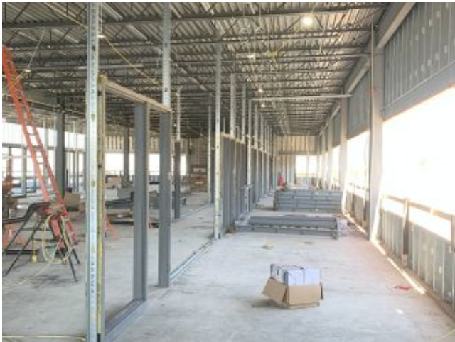
2025.03.18 – Third floor looking north