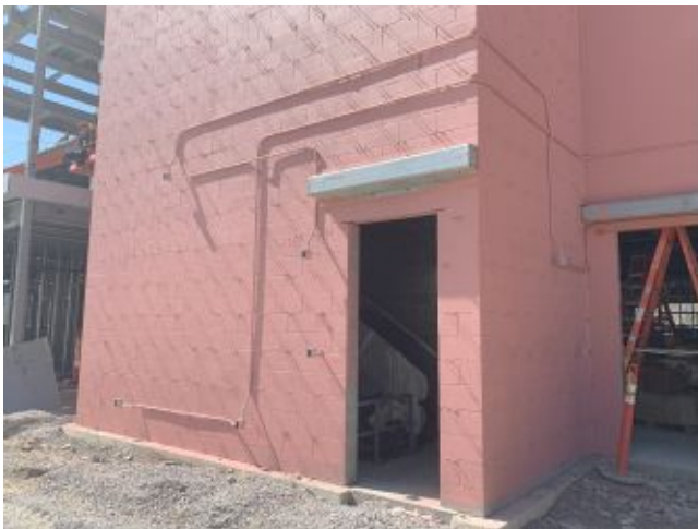
2025.03.18 – Exterior east elevation