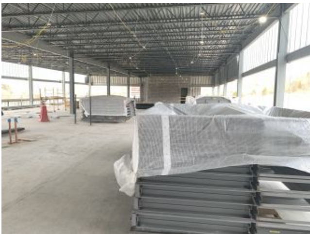
2025.03.04 – Third floor looking north