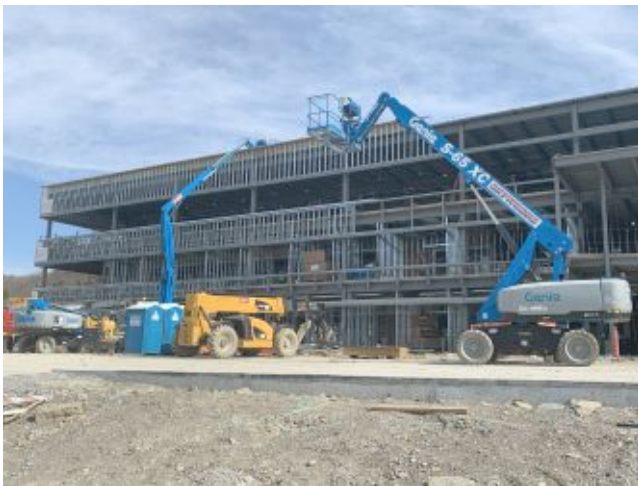
2025.03.04 – Exterior west elevation