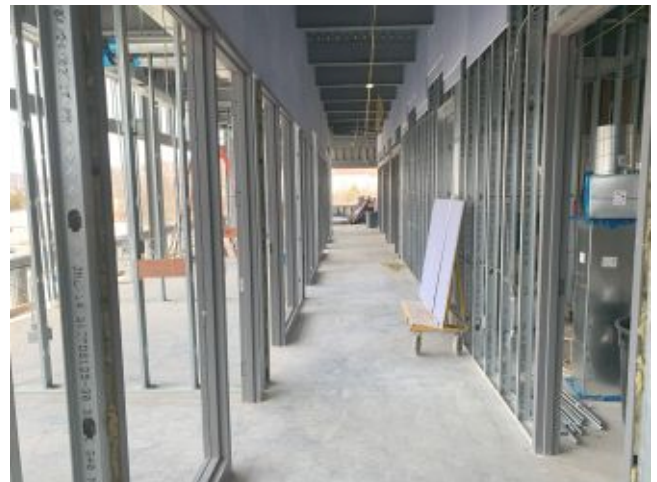
2025.03.04 – Second floor, west corridor, looking north