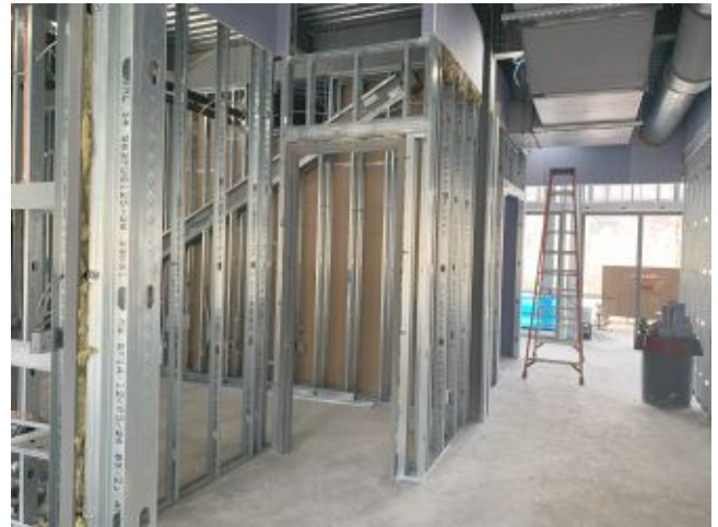
2025.03.04 – Looking southwest towards Women #246