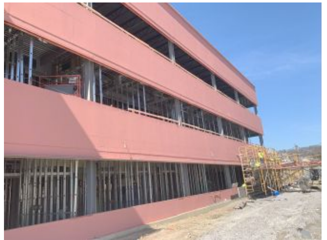
2025.03.18 – Exterior east elevation