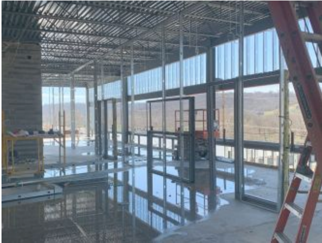
2025.03.18 – Third floor looking southwest