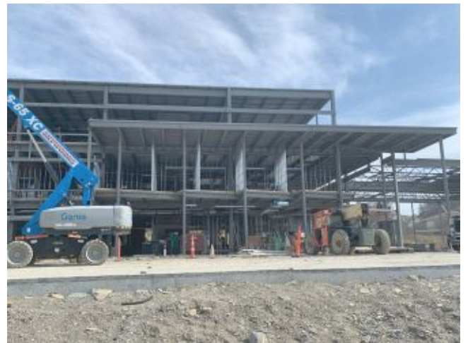
2025.03.04 – Exterior west elevation