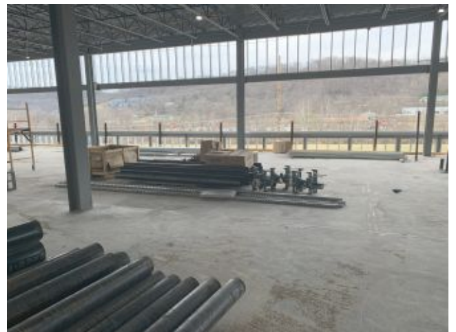
2025.03.04 – Third floor looking west