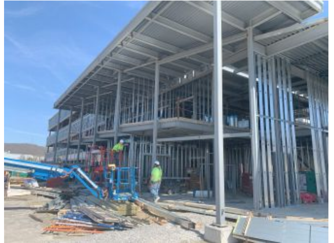
2025.03.18 – Entry and sawtooth