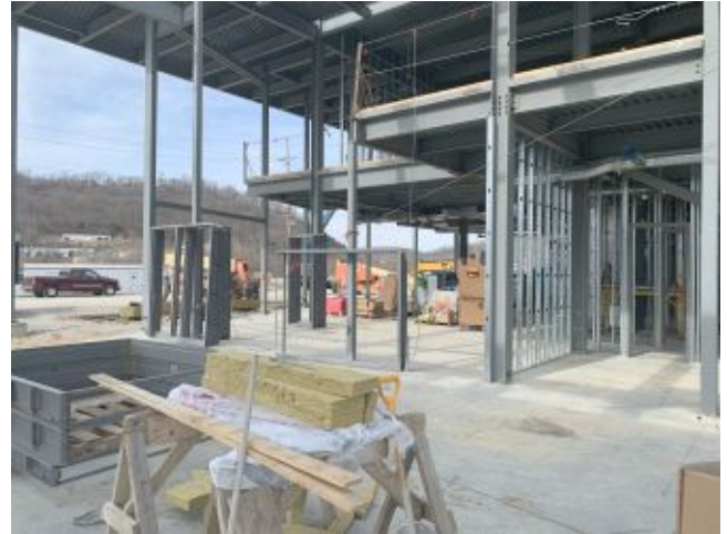
2025.03.04 – Board Room looking towards Entry Lobby