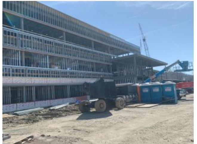
2025.03.18 – Exterior west elevation