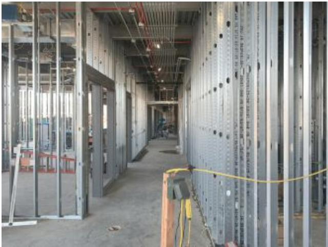
2025.03.18 – Corridor #100B