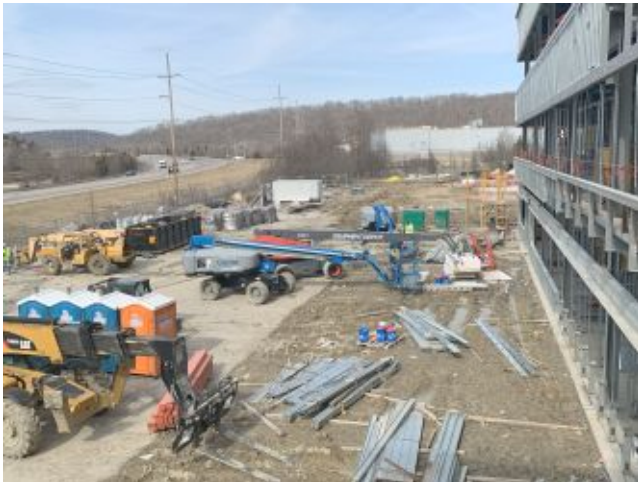
2025.03.04 – Site from Conference #202