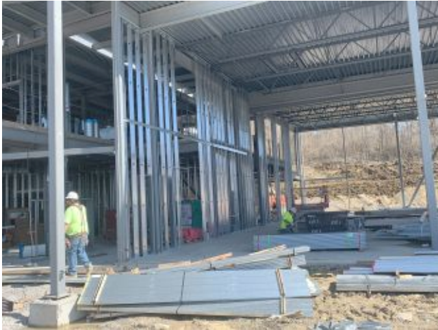
2025.03.18 – North wall of Board Room from outside