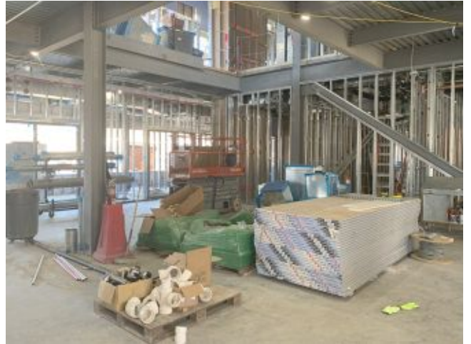
2025.03.18 – Monumental stair area