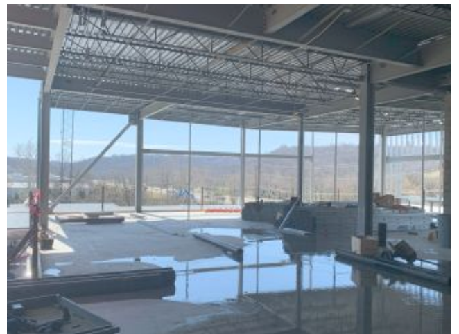
2025.03.18 – Third floor looking south