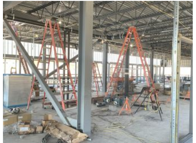
2025.03.18 – Third floor looking northwest