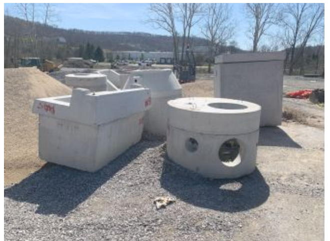
2025.03.18 – Storm structures