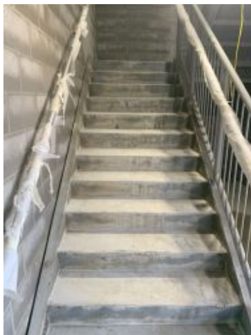
2025.03.18 – Stair #1