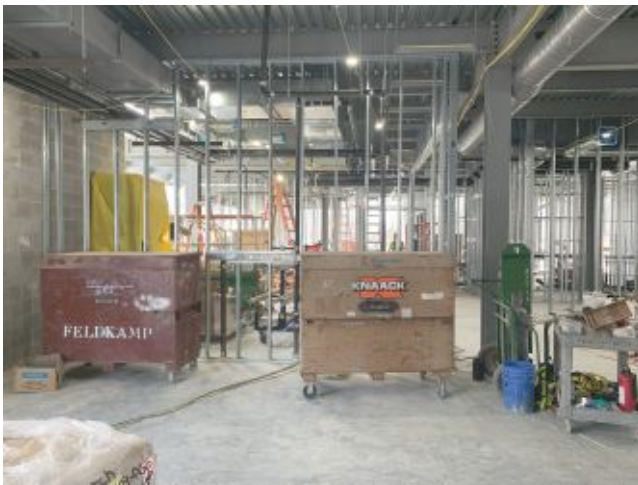
2025.03.04 – Looking south towards Breakroom #165