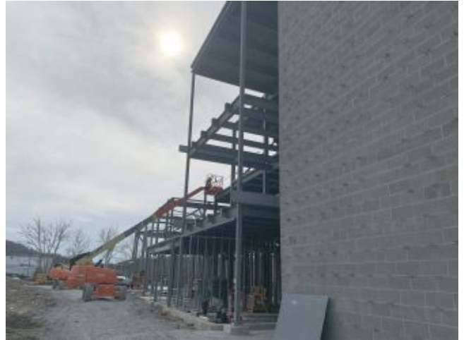
2025.03.04 – Exterior east elevation