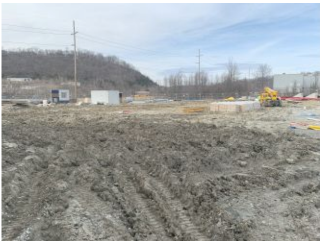
2025.03.04 – North parking lot area