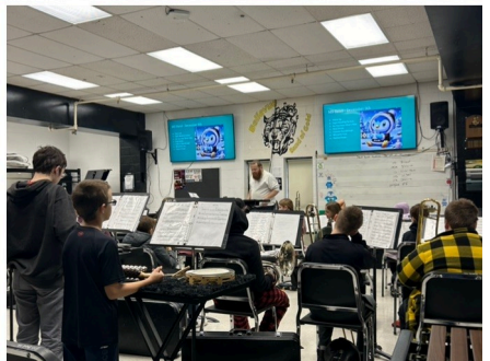
Boys Basketball win over Dayton, Educators Rising Field Trip ER Field Trip, New to the Vue #2 GES Holiday Program, NttV #2, Scholastic Observation of MS Band