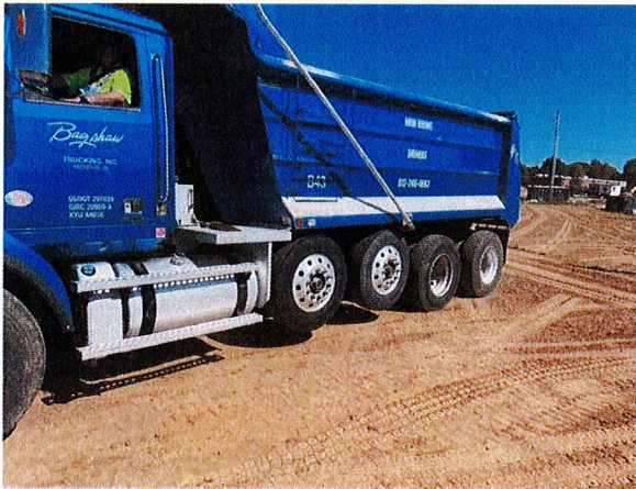
Proofroll of Softball field

Inspector Bobby Jackson and Dave Hagan with Calhoun Construction observed excavation of an soft spot in subgrade located near the Baseball Field back stop foundation area. Excavated area was contained debris and organic materials not allowed in specification section 3.06. S&ME recommends that the unsuitable soils be removed and backfilled with flowable fill or lean concrete.