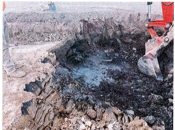
Excavated ditch at Baseball field Back Stop area