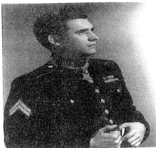
UNITED STATES CONGRESSIONAL MEDAL OF HONOR