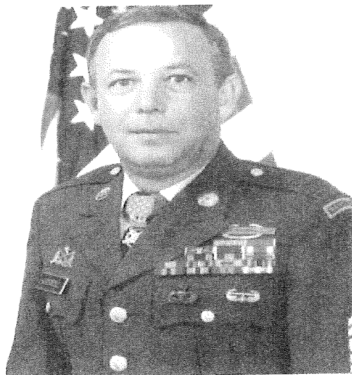
UNITED STATES CONGRESSIONAL MEDAL OF HONOR