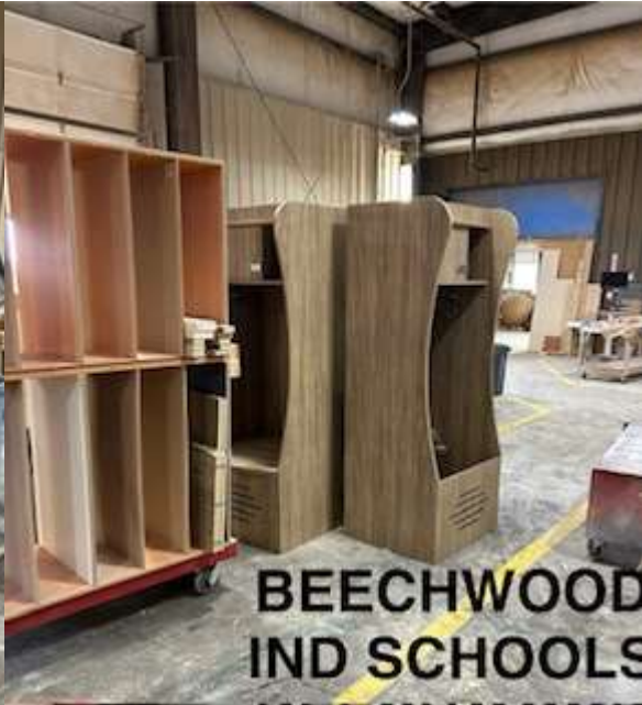
BEECHWOOD IND SCHOOLS