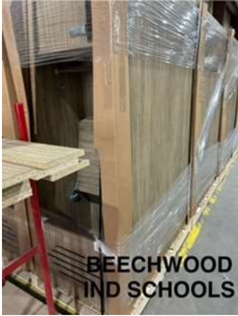
BEECHWOOD IND SCHOOLS