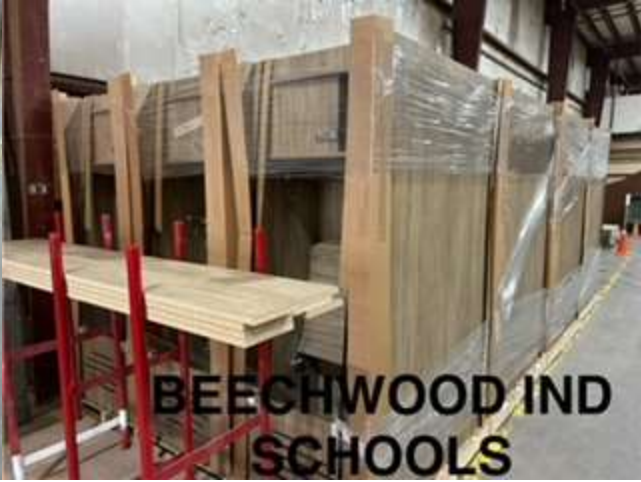
BEECHWOOD IND SCHOOLS