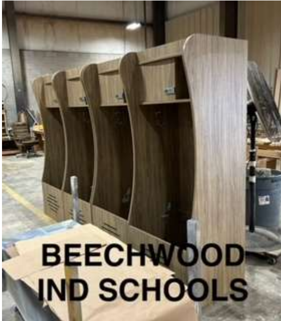
BEECHWOOD IND SCHOOLS