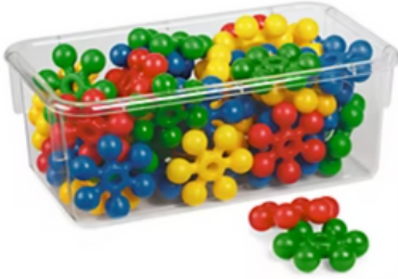
Lid for Lakeshore Clear-View Storage Box