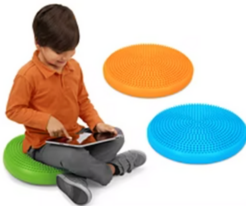
Flex-Space Wobble Cushion