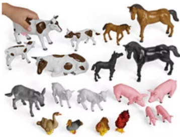
Classic Farm Animal Collection