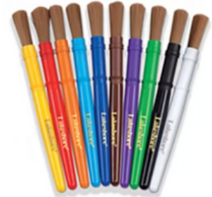
Nylon-Bristle Paintbrushes - Set of 10