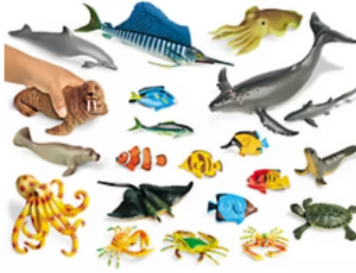
Classic Ocean Animal Collection