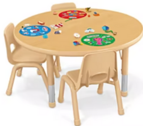
Heavy-Duty Adjustable Round Tables