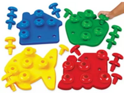
My First Pegboard Set