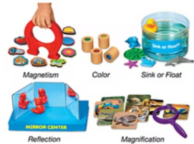
Lakeshore Toddler Science Center