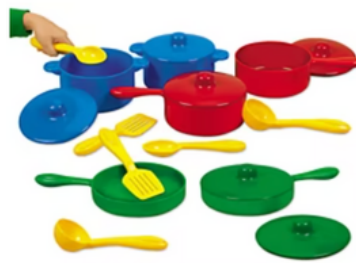
Indestructible Pots & Pans Playset