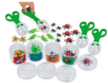
Scoop-A-Bug Sorting Kit