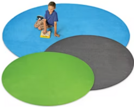
Flex-Space Comfy Round Classroom Carpets