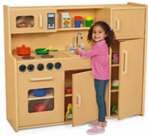
Heavy-Duty All-In-One Kitchen