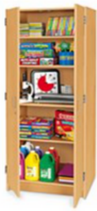
Heavy-Duty 6-Foot Locking Storage Cabinet