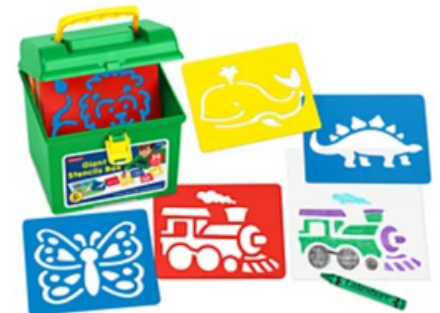
Giant Stencils Box