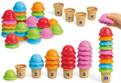
Lakeshore Counting Cones