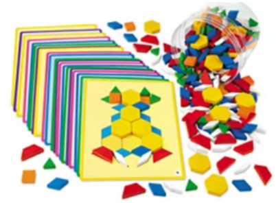
Pattern Blocks Design Cards