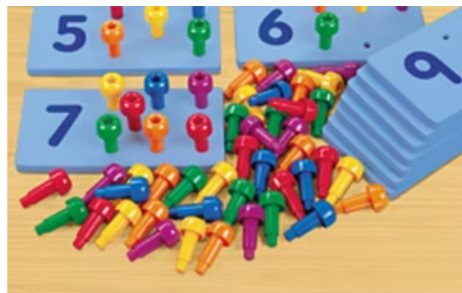
Peg Number Boards