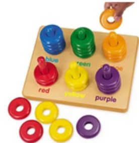
Color Rings Sorting Board