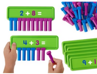
It's a Snap! Simple Addition Center