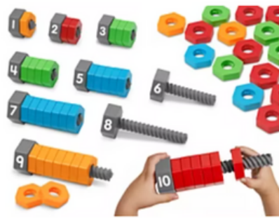
Nuts About Counting!