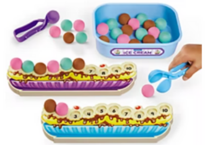
Squeeze, Scoop & Count Ice Cream Shop