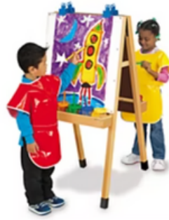
Lakeshore Heavy-Duty Hardwood Easel