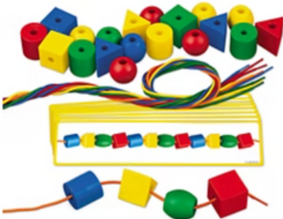
Indestructible Giant Beads & Patterns