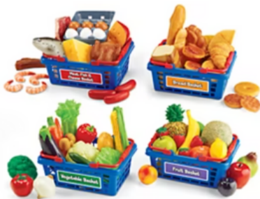
Let's Go Shopping Food Baskets - Complete Set