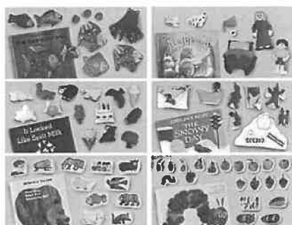
Hardcover books sold separately.

Take A Look At This Super-Cool Item I Found At LakeshoreLearning.Com!