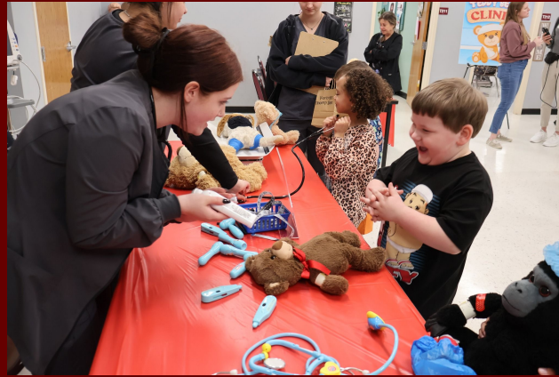
TEDDY BEAR CLINIC AT HCHS