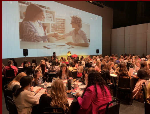
YOUNG WOMEN FROM NMS AND SMS PARTICIPATE IN JUNIOR ACHIEVEMENT MISS BUSINESS PROGRAM WITH LOCAL WOMEN LEADERS