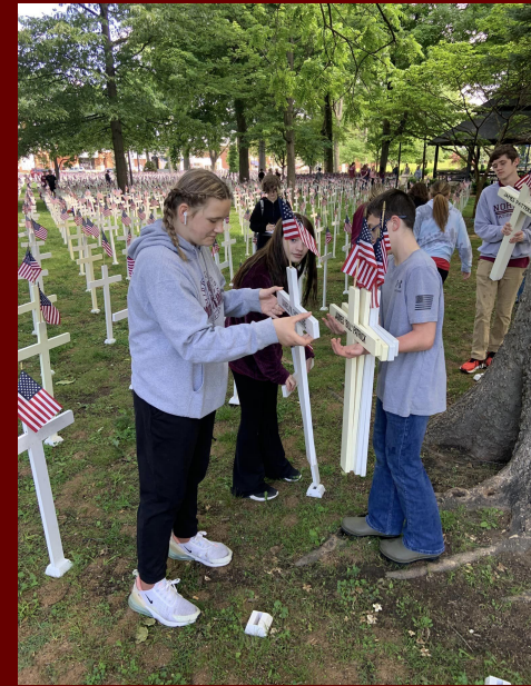
NORTH MIDDLE SCHOOL STUDENTS VOLUNTEER WITH MEMORIAL DAY CROSSES