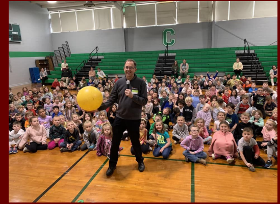
METEOROLOGISTS FROM 14 NEWS VISITS OUR SCHOOLS TO TALK ABOUT THE ECLIPSE