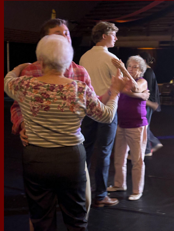
GOLDEN GALA SENIOR CITIZEN PROM AT HCHS