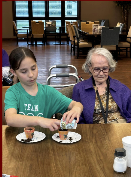
CAIRO ELEMENTARY STUDENTS VOLUNTEERING AT HOMEPLACE.