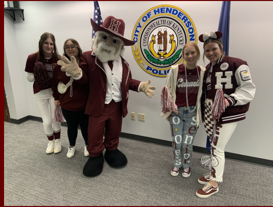
HCHS STUDENT AMBASSADORS VISIT HPD DURING COLONEL MOVEMENT