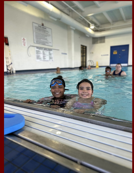
EAST HEIGHTS ELEMENTARY 3RD GRADE STUDENTS PARTICIPATE IN SWIM PROGRAM AT YMCA