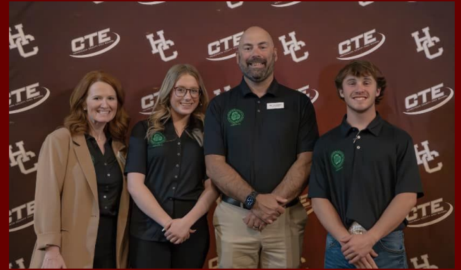
37 CTE STUDENT SIGNED WITH 21 LOCAL BUSINESSES