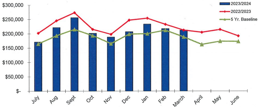
Total Energy Cost 2023/2024 Fiscal Year