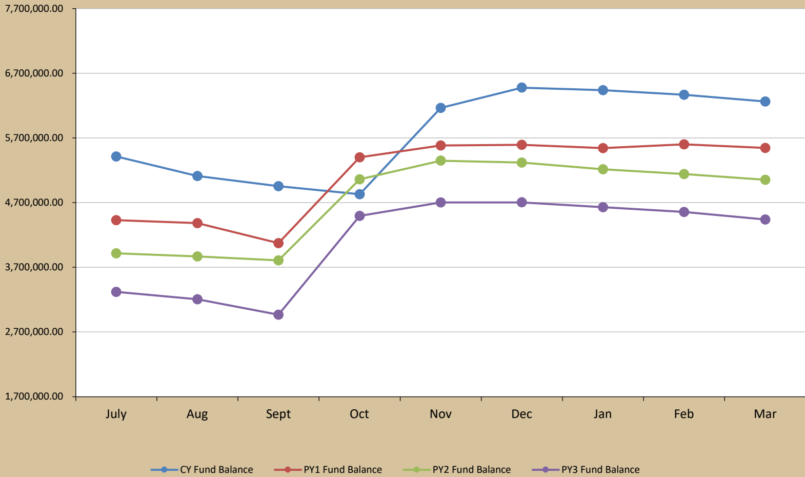
History of General Fund (Fund Balance)