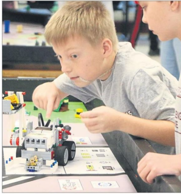
A member of the Calvary Elementary RCX team pushes the start button on their robot during Saturday's state qualifier at the Knight Academy. West Marion won the elementary division and will advance to state along with Calvary Elementary, who placed second.