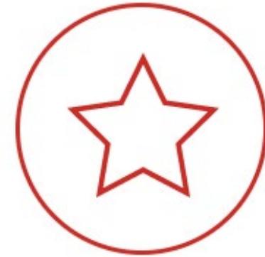
June Scholastic Events