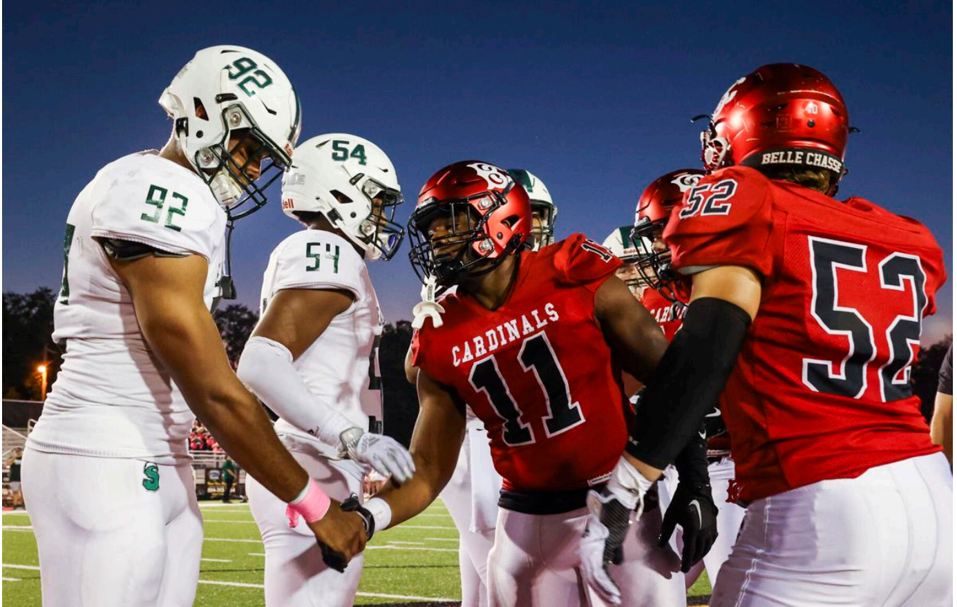
Belle Chasse against Shaw players shake hands before a varsity football game at Belle Chasse High School in Belle Chasse, La., Friday, Oct. 14, 2022.