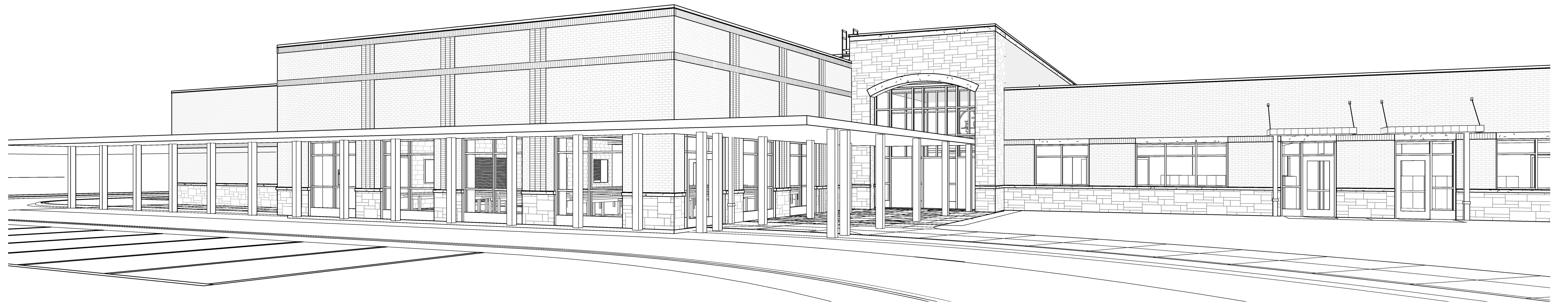
REAR ELEVATION/ CAR LANE