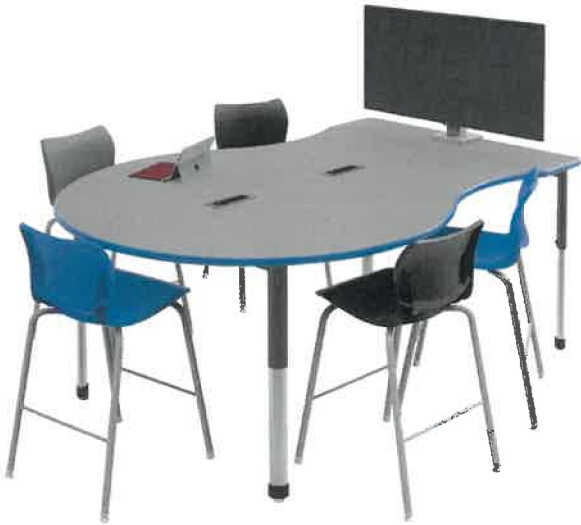
Shown With Pewter Mesh Laminate Top, Persian Blue Edge, and Black Frame. Shown. Optional TV Mount Sold Separately.