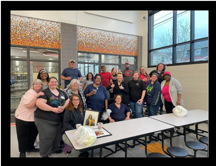
People Stronger Together End of Year Celebration March 2023

People Stronger Together (PST) in conjunction with Born Learning ended on 3/24/23 (20 parents)-End of year celebration.