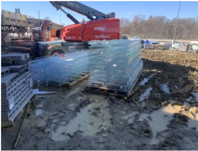
2022.11.30 – Cable tray