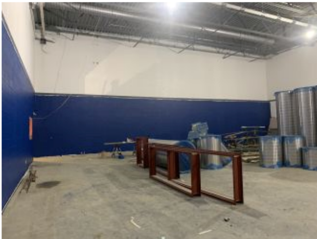
2022.12.14 – Practice gym North wall