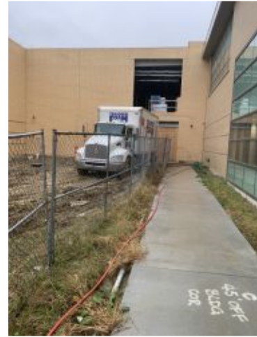
2022.12.14 – Spray foam insulation truck