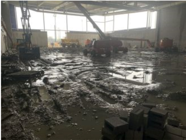
2022.12.14 – Pool space looking Northeast