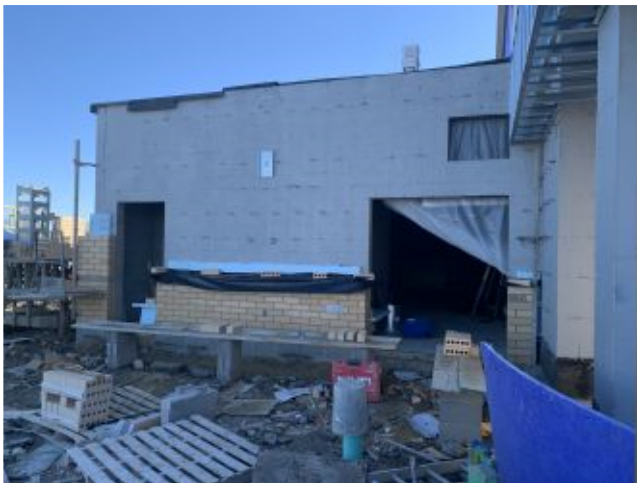
2022.11.30 – North wall of pool equipment room