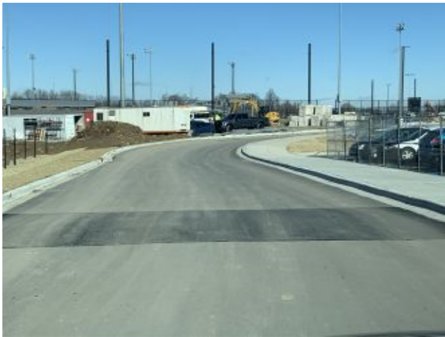
2022.11.30 – Speed hump