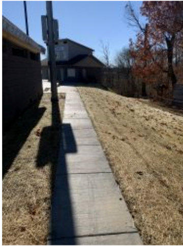
2022.11.30 – Sidewalk behind home dugout