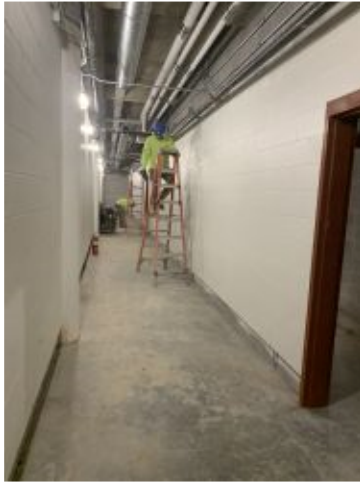
2022.12.14 – Corridor 1800C