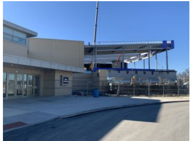
2022.11.30 – East wall of Pool