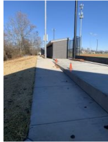
2022.11.30 – Pad for baseball grandstands