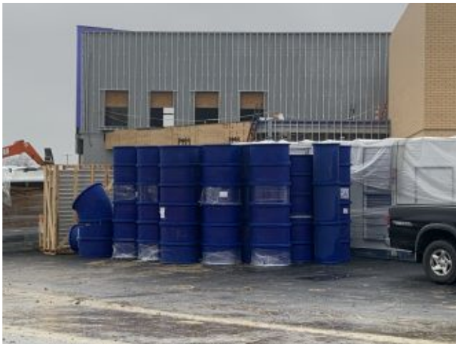
2022.12.14 – Fiberglass duct