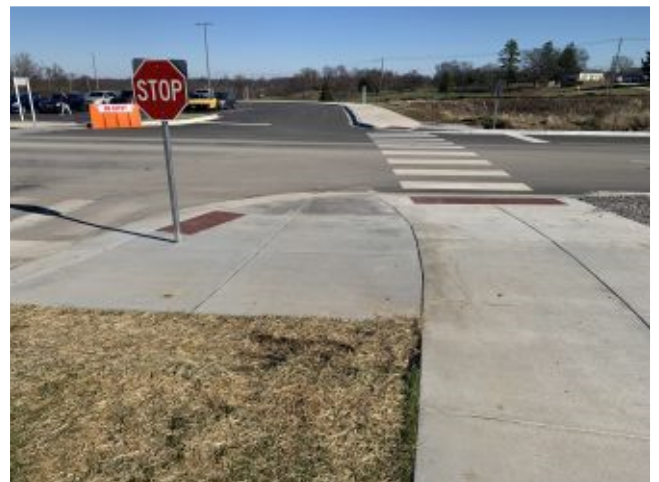
2022.11.30 – Additional sidewalks near entrance