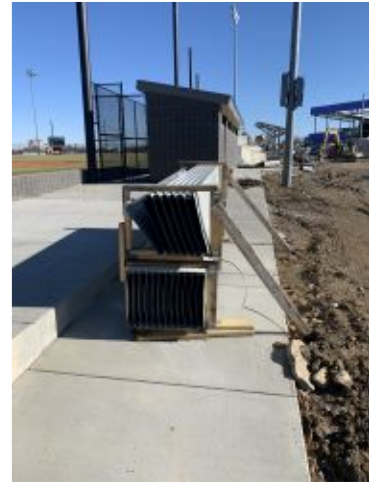
2022.11.30 – Metal roofing panels