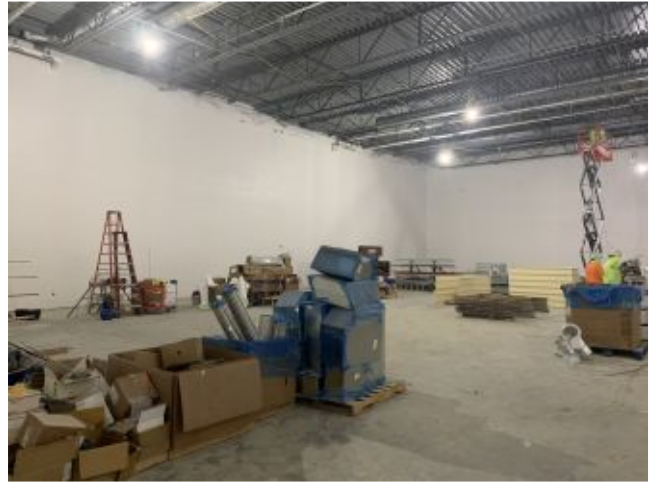
2022.11.30 – Practice gym