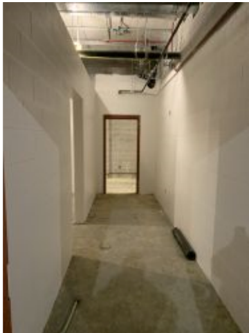
2022.12.14 – Vestibule #1880