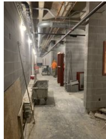
2022.11.30 – Corridor 1800C