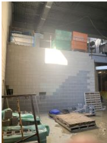
2022.11.30 – Ductwork in monumental stair area

32.05: 2022.12.14 – Walks in the area of the fire department steps had been completed, as had the concrete pad near the cellular transmission tower.