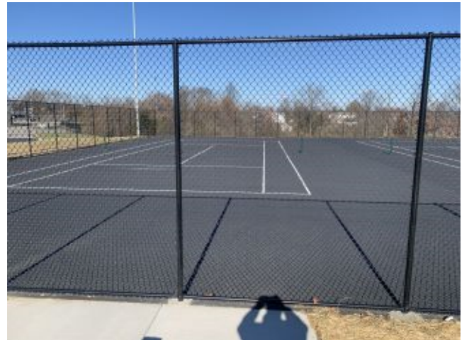
2022.11.30 – Tennis courts