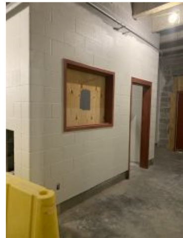
2022.12.14 – Outside of Boys' Coach #1850