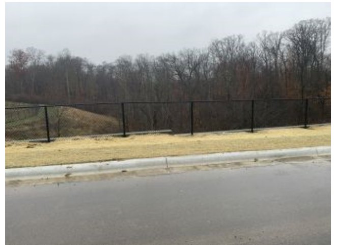
2022.12.14 – Fence at cross-country path wall