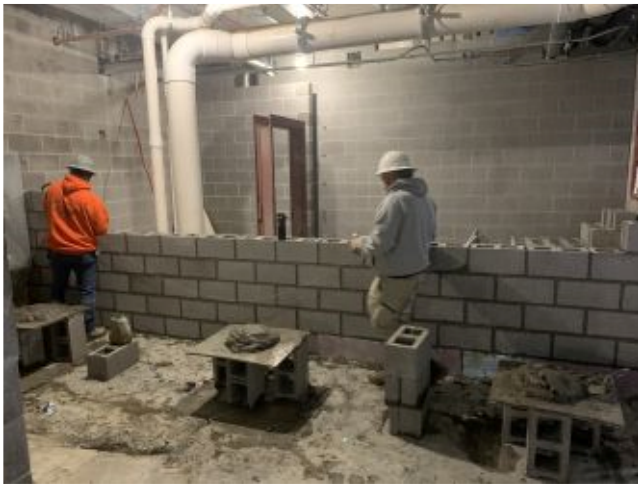
2022.11.30 – Girls' P.E. Office