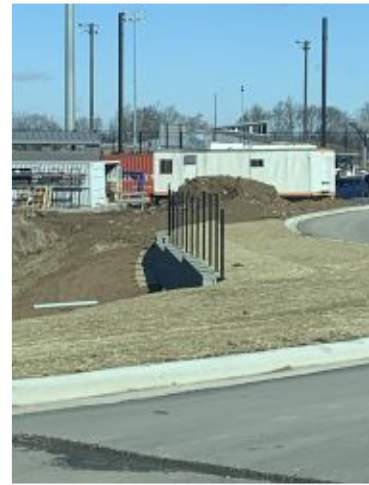
2022.11.30 Fence posts at cross-country path wall