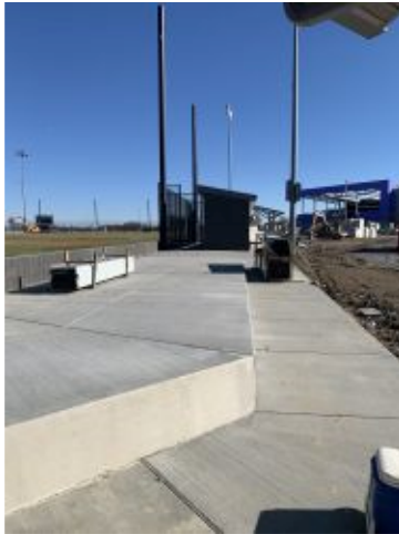
2022.11.30 – Pad for baseball grandstands