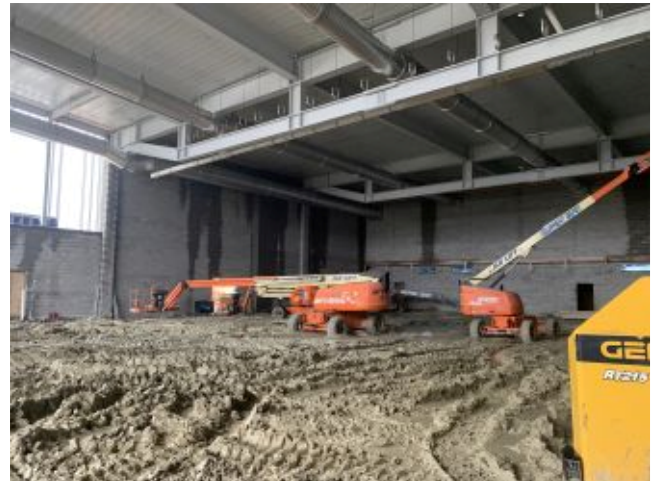
2022.12.14 – Pool looking Southeast