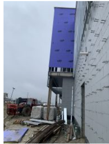
2022.12.14 – Northwest corner of pool