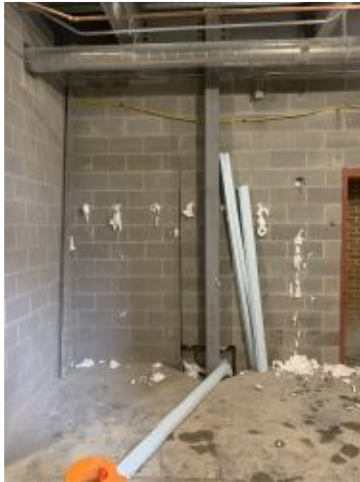
2022.12.14 – Spray foam between monumental stair and existing gym