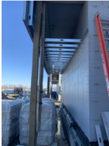
2022.11.30 – Soffit framing, North of pool