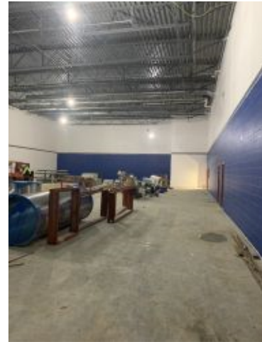
2022.12.14 – Practice gym South wall