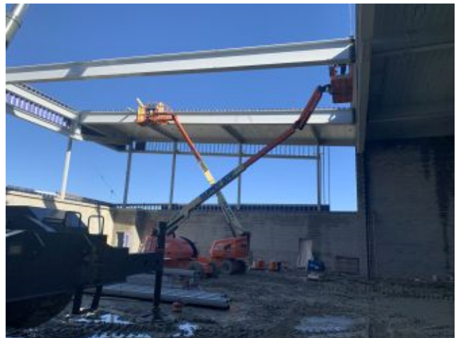
2022.11.30 – Installing roof deck