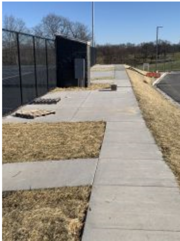
2022.11.30 – Outside of tennis courts