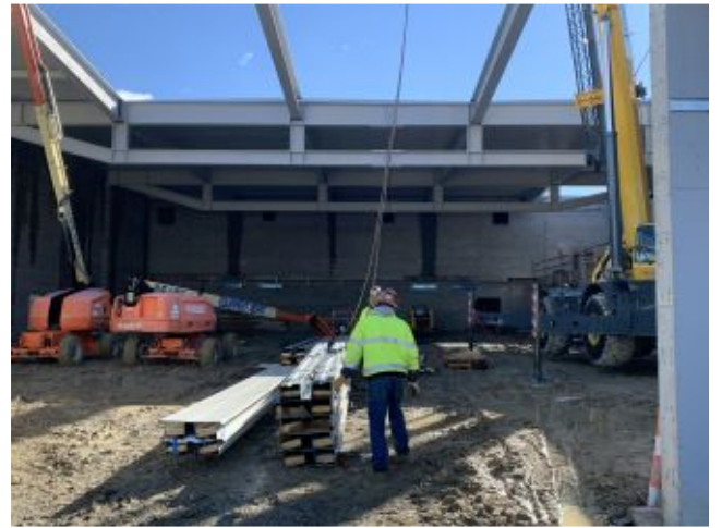
2022.11.30 – Rigging long span deck for lifting