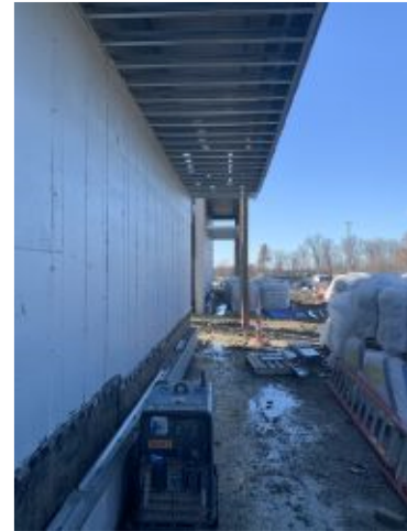
2022.11.30 – Soffit framing North of pool