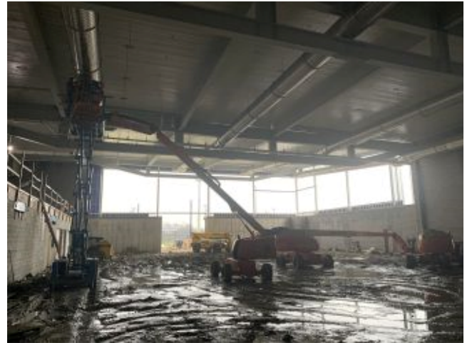
2022.12.14 – Installing duct in pool space