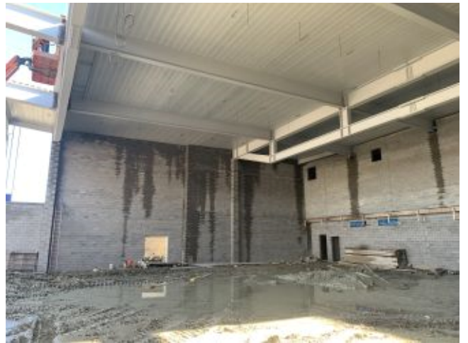
2022.11.30 – Pool looking East