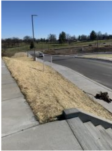
2022.11.30 – Outside of tennis courts