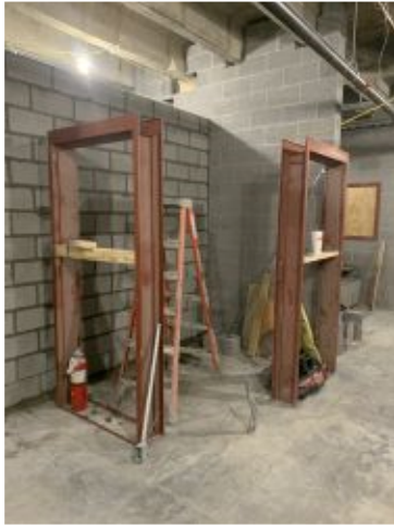
2022.11.30 – Boys' Athletic Locker Room