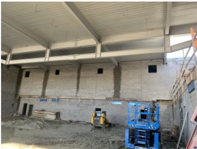
2022.11.30 – Pool looking South