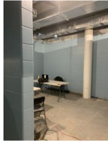
2022.12.14 – Girls' Athletic Locker Room #1821