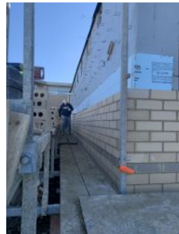
2022.11.30 – East wall of pool equipment room