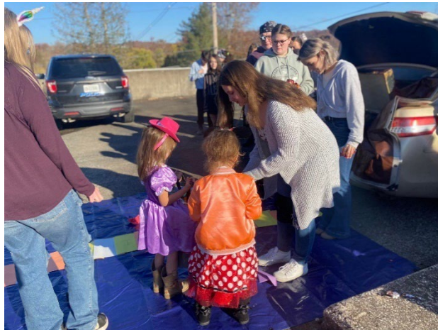
Breathitt County ATC Future Business Leaders of America (FBLA) students had a great time at Trunk or Treat for Head Start. The students enjoy being an active part of their community.