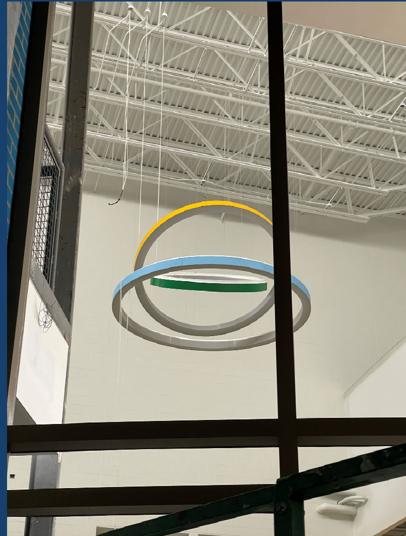
NEW OLD MILL ELEMENTARY SCHOOL – CONSTRUCTION UPDATE

December 23 rd – Substantial Completion - Gym