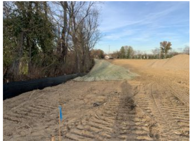
2022.11.09 – Grass netting at Taylor Mill