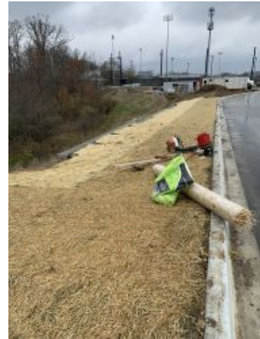
2022.11.16 – Cross-country retaining wall