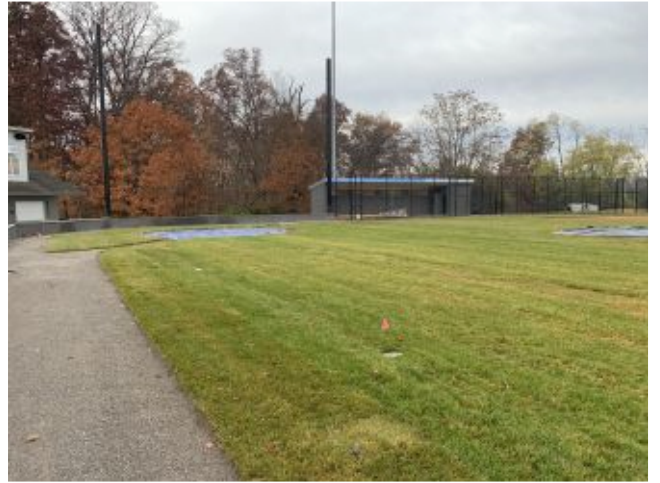
2022.11.02 – Baseball field