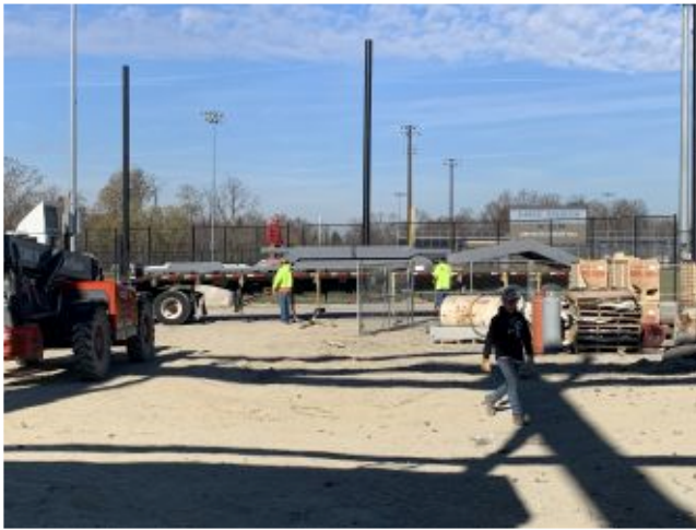
2022.11.09 – Monumental stair arriving