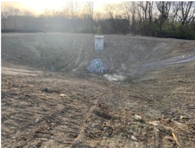
2022.11.09 – Taylor Mill detention basin