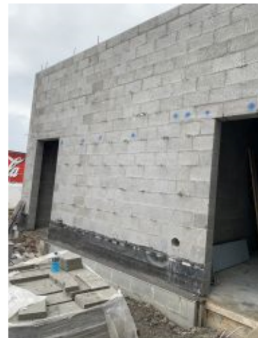
2022.11.16 – North wall of pool equipment room