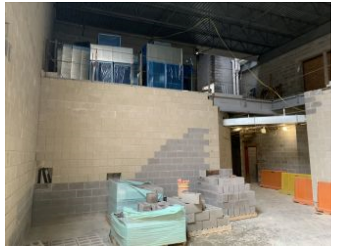
2022.11.16 – Monumental stair area