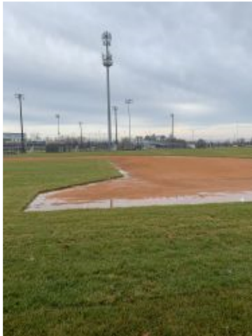
2022.11.02 – Baseball field