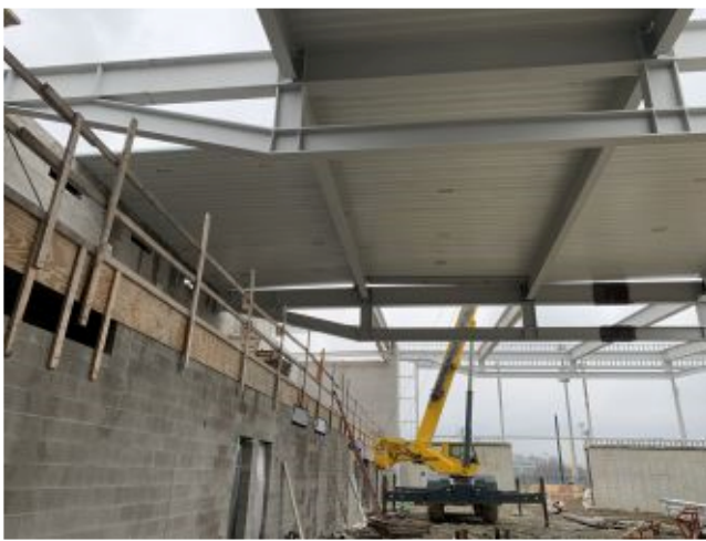
2022.11.16 – Pool space looking North