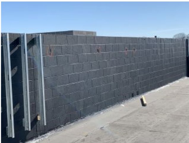
2022.11.09 – Air/weather barrier needing repair