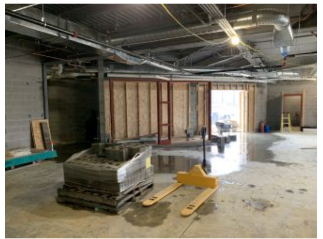
2022.11.16 – Pool lobby