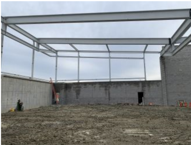
2022.11.02 – Looking east in pool space