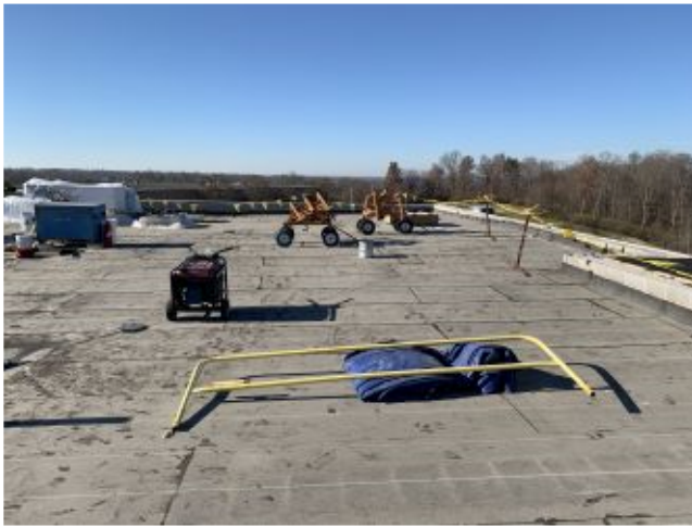
2022.11.09 – Practice gym roof