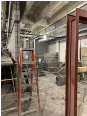
2022.11.16 – Varsity locker rooms