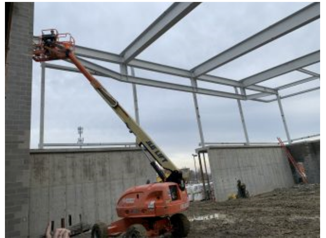
2022.11.02 – North wall of pool space