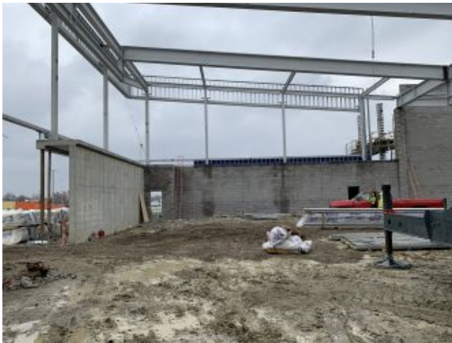
2022.11.16 – Pool space, looking East