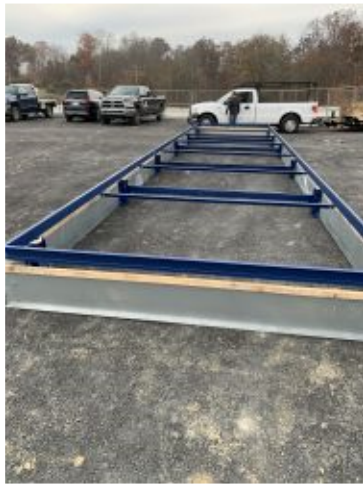
2022.11.02 – Dehumidification unit roof curb