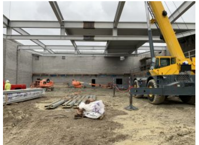
2022.11.16 – Pool space, looking South