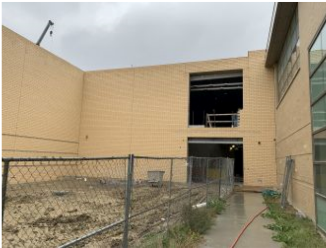
2022.11.16 – Exterior of monumental stair