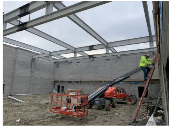
2022.11.02 – Looking southeast in pool space