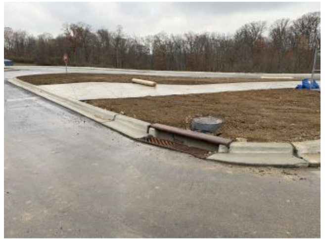
2022.11.16 – Outside of Woodland