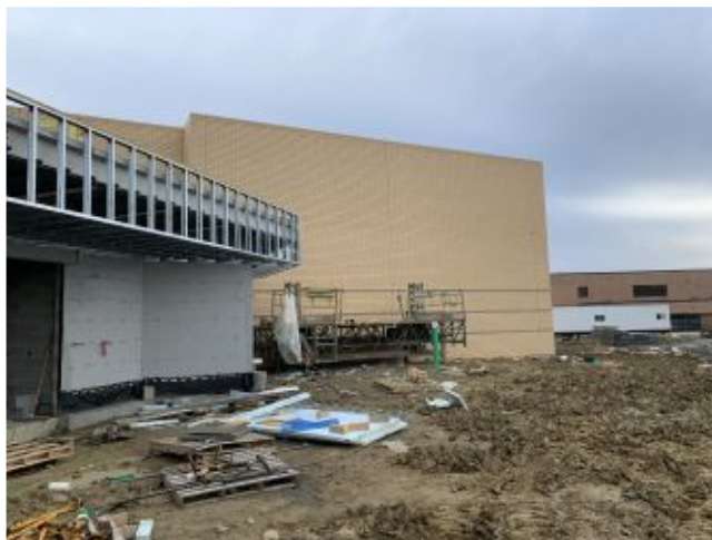
2022.11.02 – North wall of practice gym

32.04: 2022.11.16 – Grass seed netting was in the process of being put down at the cross-country path retaining wall. Topsoil was prepped near the Woodland islands.