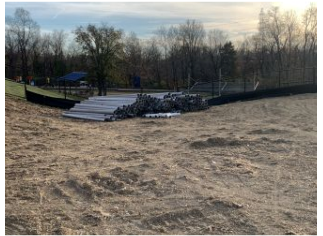
2022.11.09 – Conduit staged at Taylor Mill