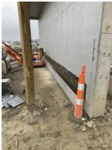
2022.11.16 – North wall of pool