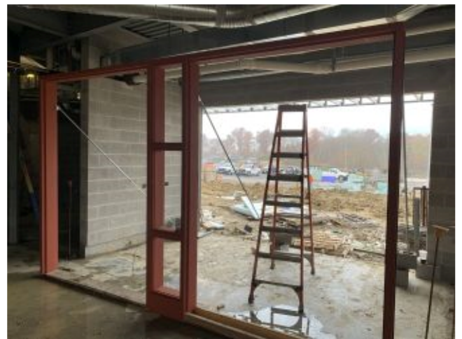
2022.11.02 – Pool entrance vestibule