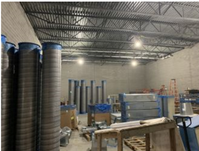
2022.11.02 – Practice gym