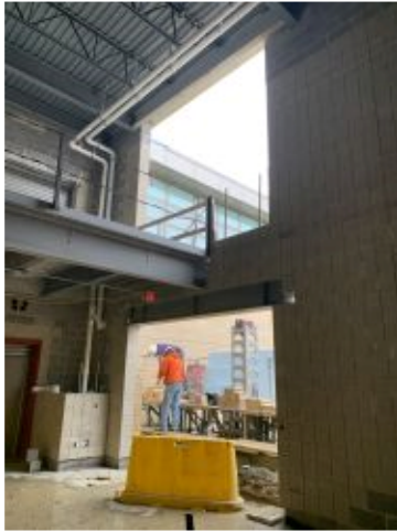
2022.11.02 – Masons working on brick veneer outside of monumental stair