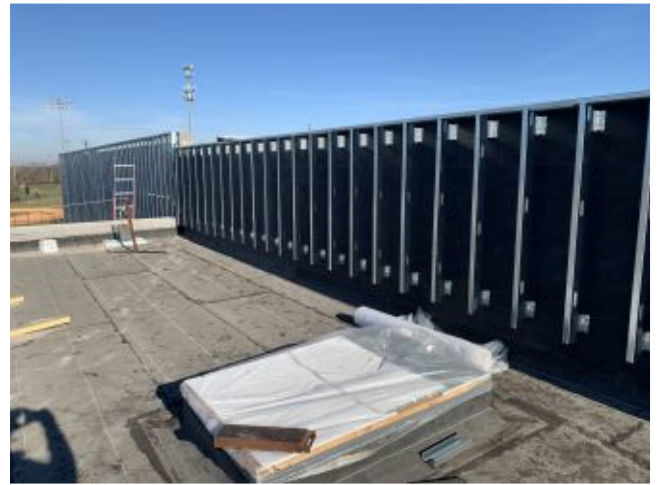
2022.11.09 – Practice gym roof