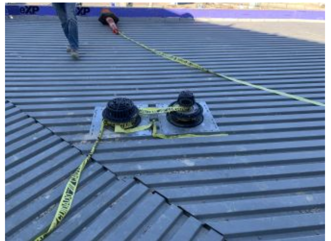
2022.11.09 – Roof drains above pool lobby