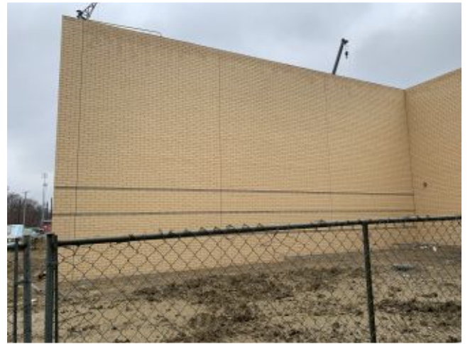
2022.11.16 – South wall of practice gym