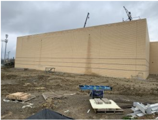
2022.11.16 – West wall of practice gym