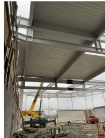
2022.11.16 – Pool space looking North