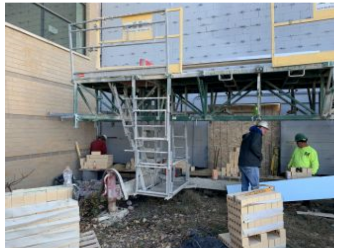
2022.11.09 – Near Phase 2A tie-in