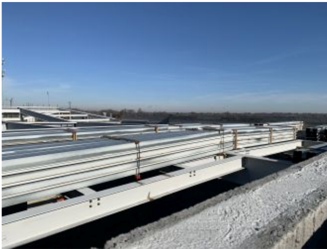
2022.11.09 – Long span deck stage on pool structure