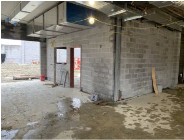
2022.11.02 – Looking towards pool office