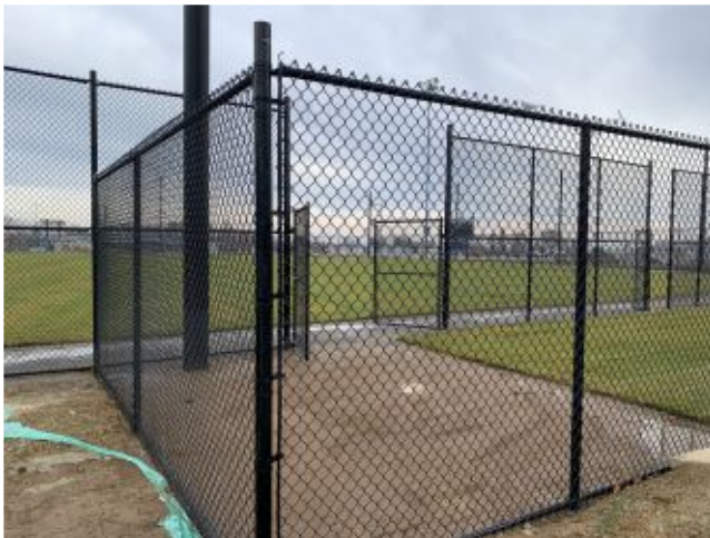
2022.11.02 – Visitor bullpen