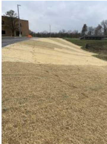
2022.11.16 – Outside of Woodland