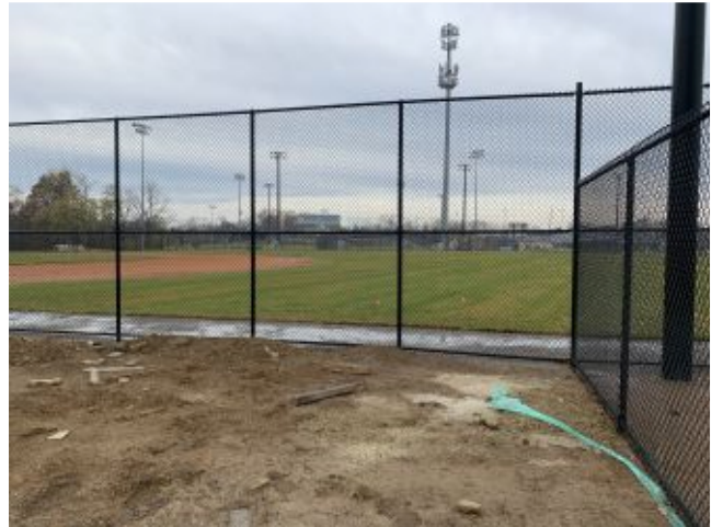
2022.11.02 – Baseball field