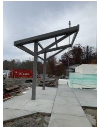
2022.11.02 – Ticket shade structure