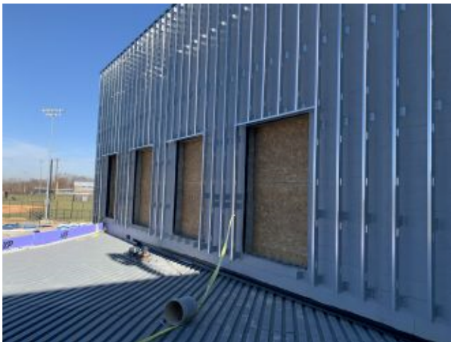
2022.11.09 – CFMF above pool lobby