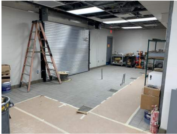
Kitchen – servery area