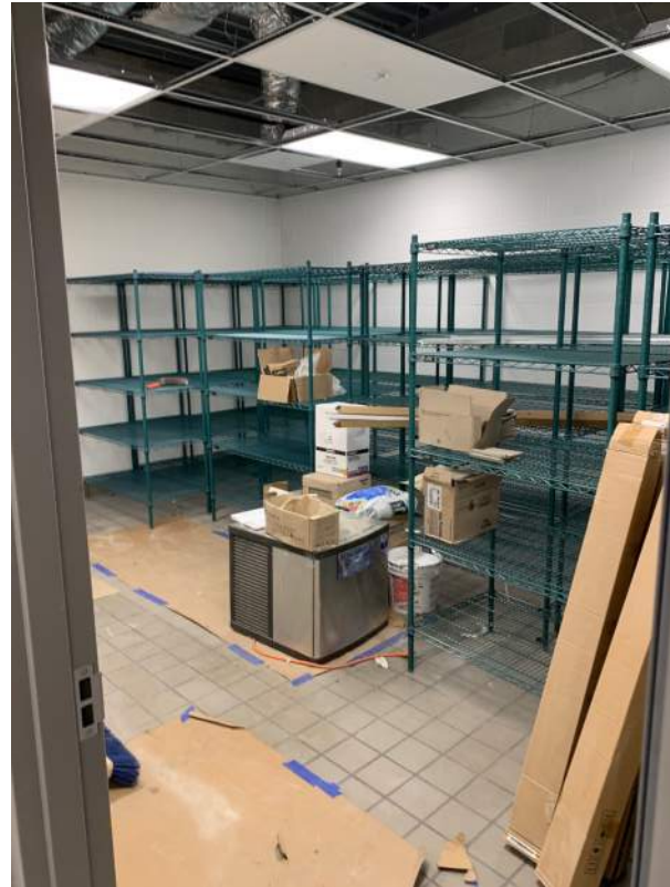
Kitchen – food storage room