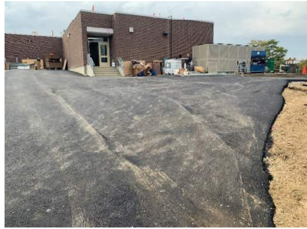
Final asphalt wear course