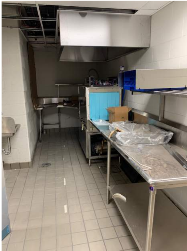
Kitchen – dishwashing area