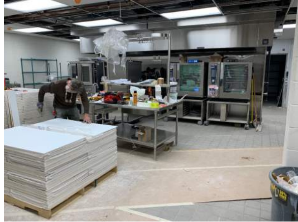
Kitchen – food prep area