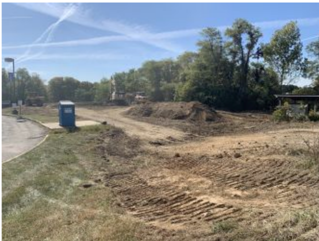
2022.10.15 – Taylor Mill site work