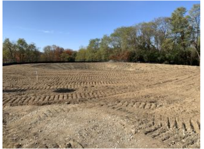
2022.10.19 – Taylor Mill detention basin