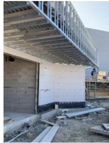
2022.10.19 – Pool entry