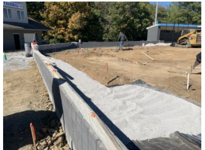
2022.10.15 – Installing warning track