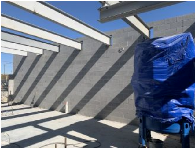
2022.10.15 – Inside pool equipment room