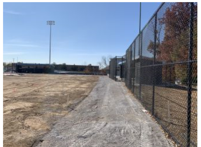
2022.10.19 – Third base line