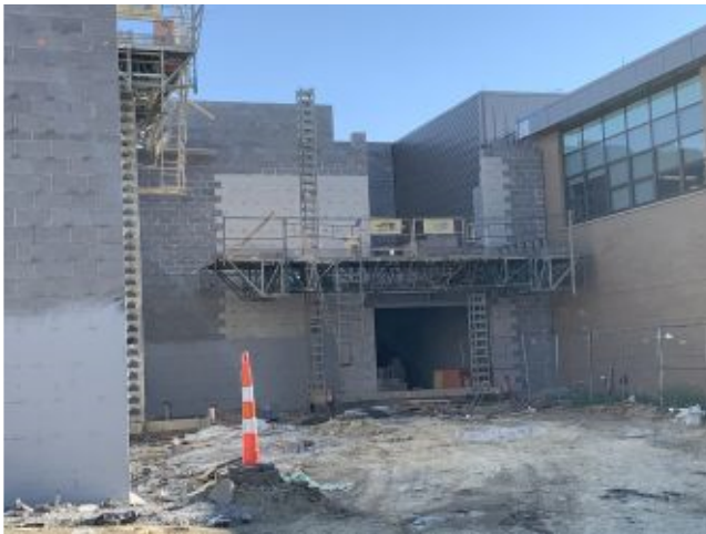
2022.09.21 – Exterior at monumental stair