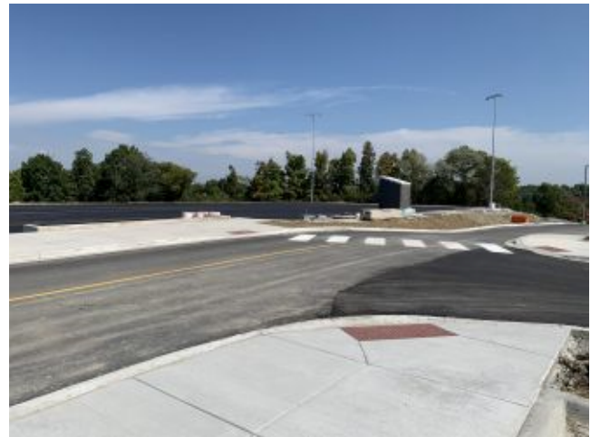
2022.09.21 – Tennis courts