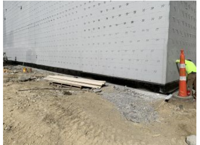
2022.10.17 – Southwest corner of practice gym