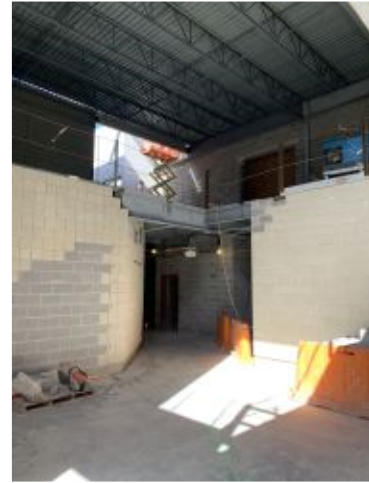
2022.10.17 – Monumental stair area