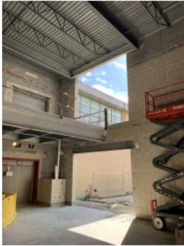
2022.10.17 – Monumental stair area