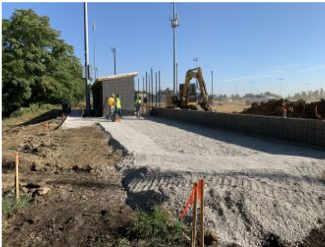
2022.09.21 – Gravel base near home dugout