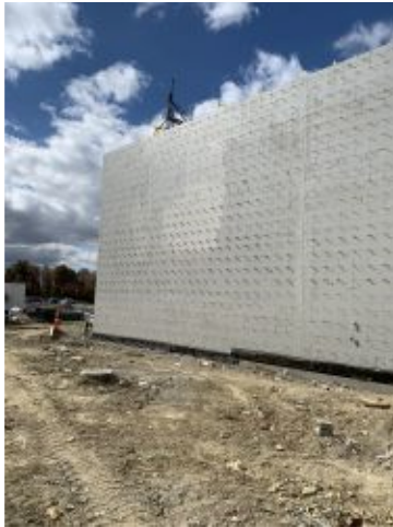
2022.10.17 – South wall of practice gym