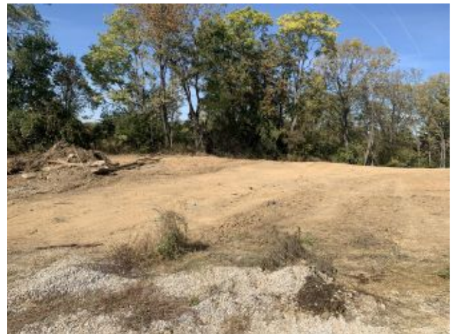
2022.10.15 – Taylor Mill site work