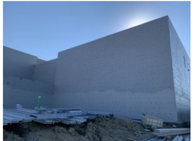
2022.09.21 – Practice gym