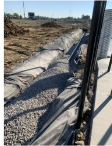
2022.09.21 – Installation of French drain