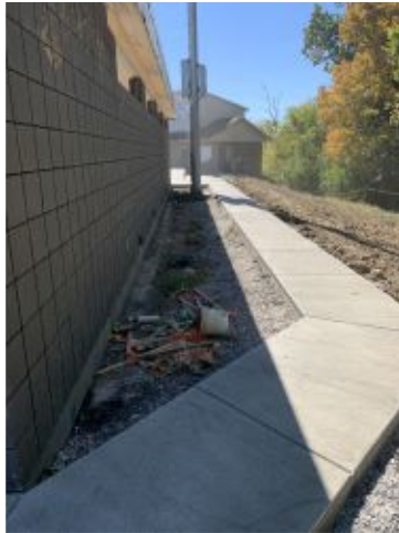
2022.10.15 – Behind home dugout