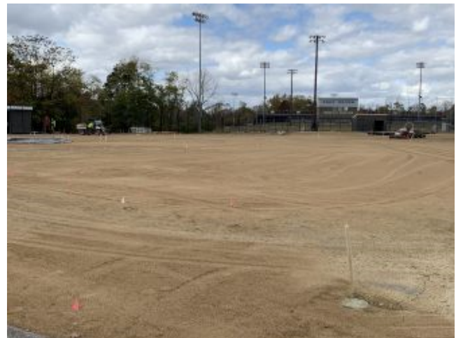
2022.10.17 Baseball field