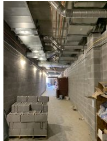
2022.10.19 – Corridor 1900C