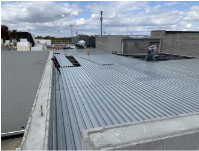
2022.10.17 – Roof over monumental stair