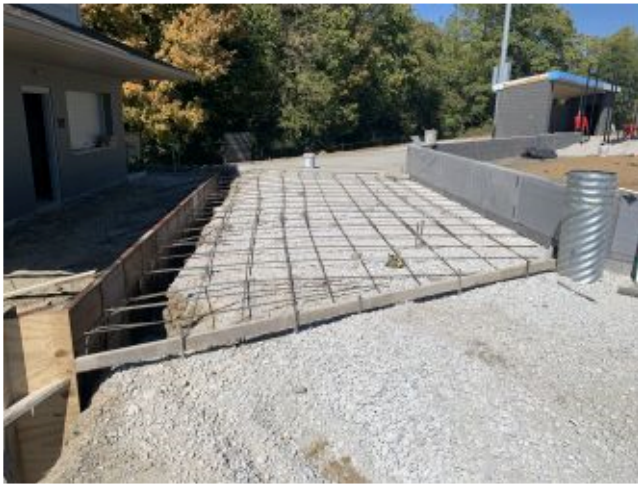
2022.10.15 – Grandstand pad preparation