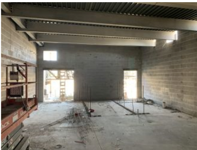
2022.10.19 – Pool equipment room