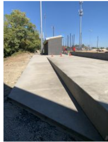
2022.10.15 – Looking towards home dugout