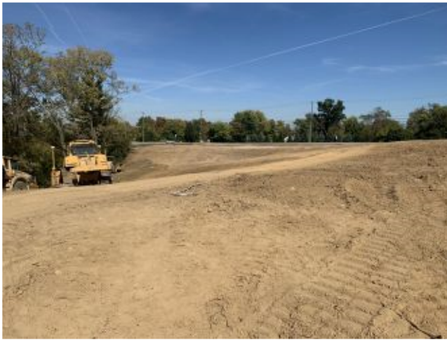
2022.10.15 – Taylor Mill site work