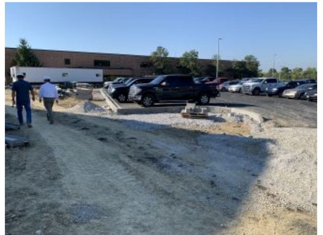
2022.09.21 – Contractor parking