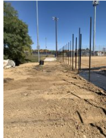
2022.10.15 – Home bullpen and batting cage area