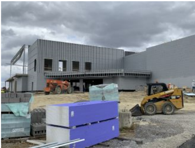
2022.10.17 – Pool entry