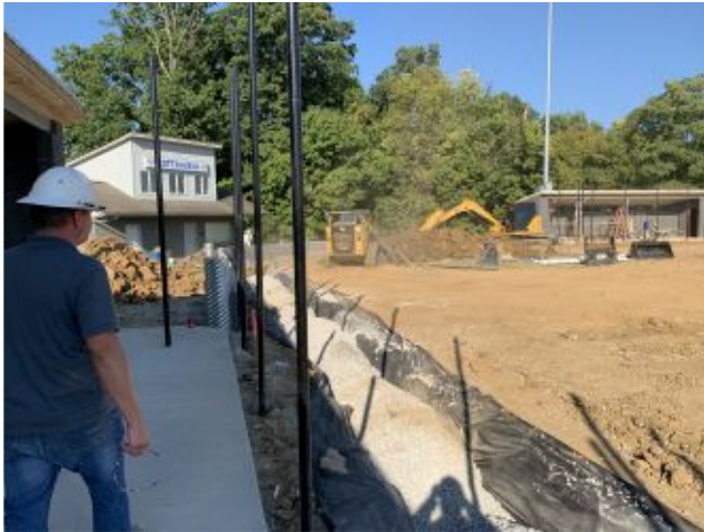
2022.09.21 – Installation of French drain