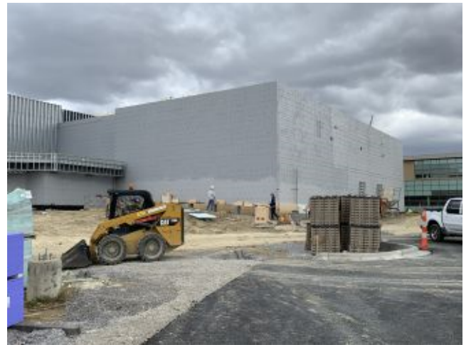
2022.10.17 – Practice gym