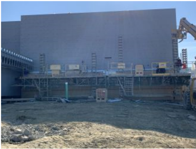
2022.10.19 – North wall of practice gym