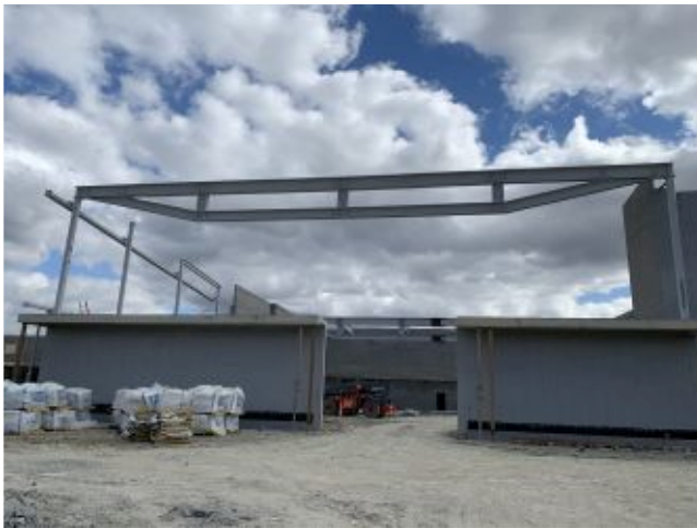
2022.10.17 – North wall of pool