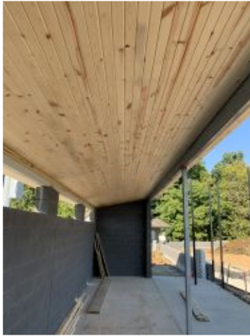
2022.09.21 – Visitor dugout