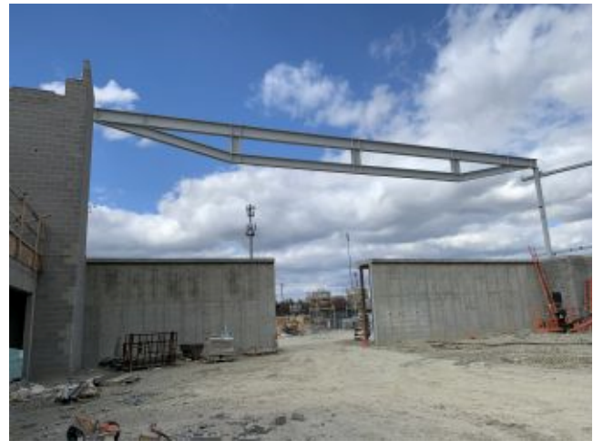
2022.10.17 – North wall of pool from interior