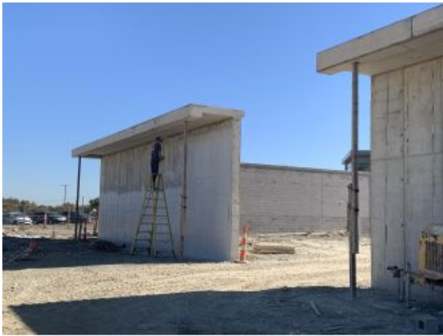
2022.10.05 – North wall of pool