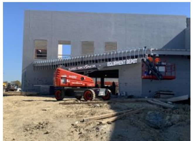
2022.10.05 – Pool entry