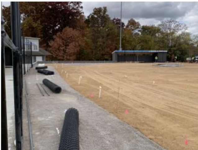
2022.10.17 – Baseball field