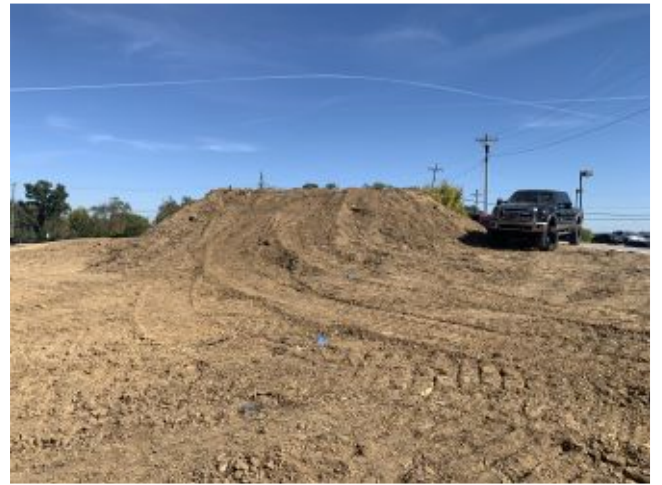
2022.10.15 – Taylor Mill site work