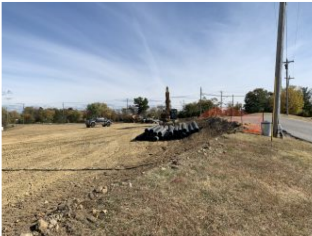
2022.10.19 – Storm piping at Taylor Mill