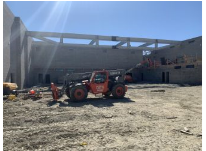
2022.10.15 – Looking South inside pool space