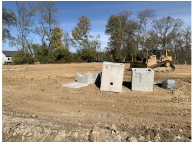
2022.10.19 – Storm structures at Taylor Mill