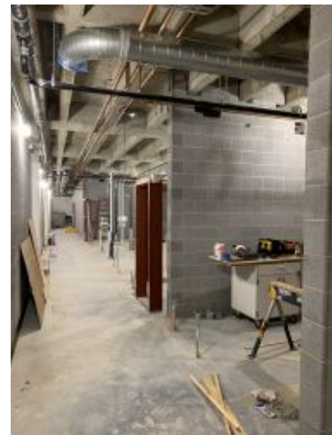
2022.10.17 – Existing locker room area