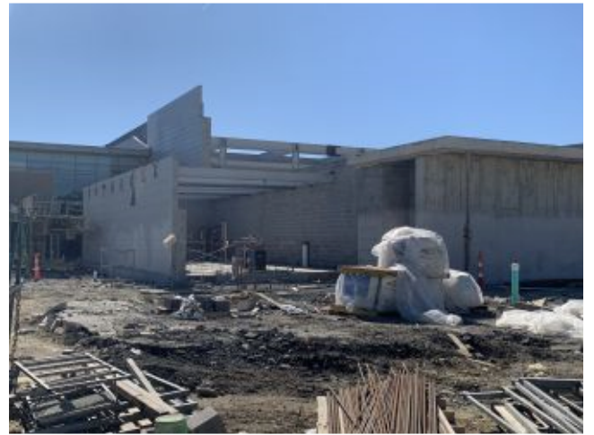
2022.10.15 – Looking toward pool equipment room