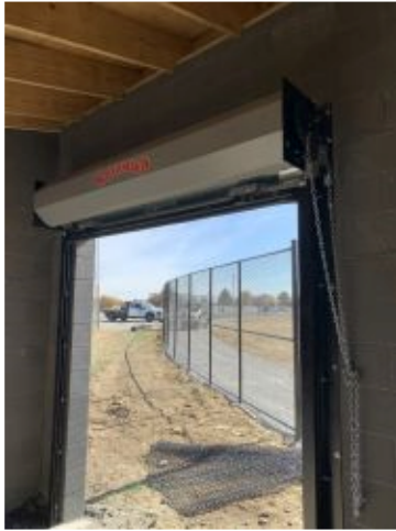
2022.10.19 – Baseball/soccer storage building