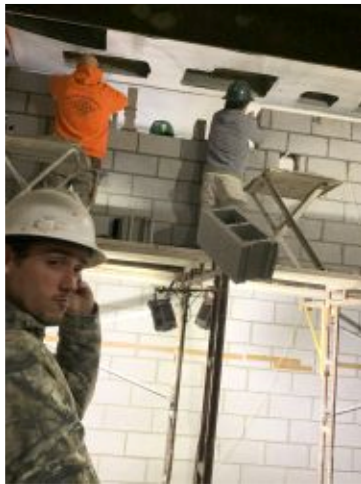
2022.10.19 – Pool lobby