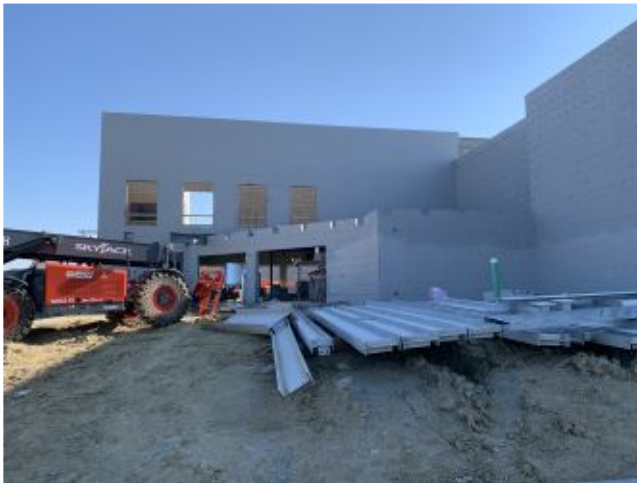
2022.09.21 – Pool entry