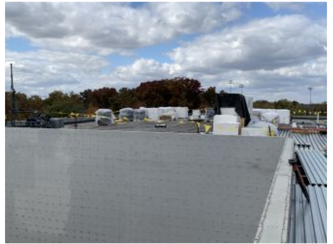
2022.10.17 – Practice gym roof