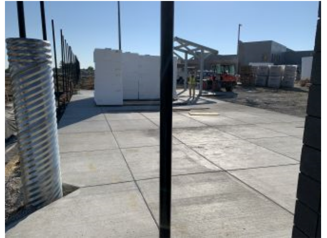
2022.09.21 – Bleacher seating area East of visitor dugout