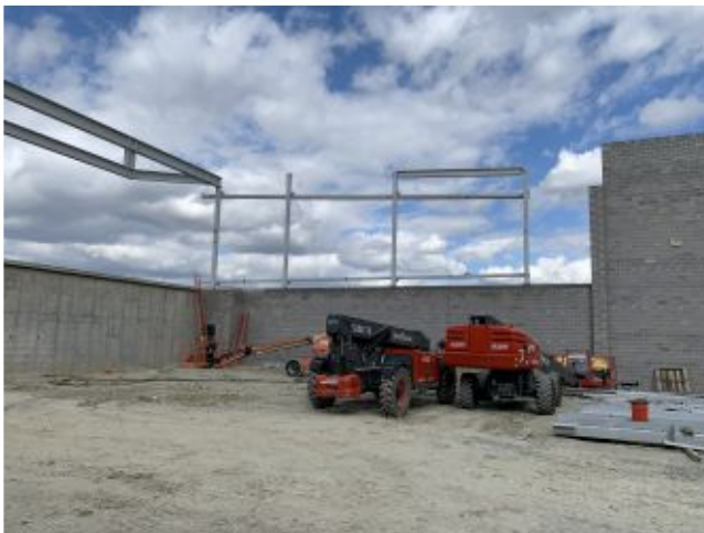
2022.10.17 – East wall of pool from interior