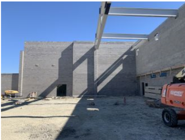
2022.10.15 – Looking East inside pool space