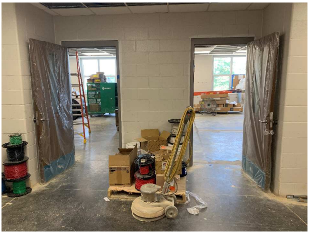
Typical classroom doors

Please acknowledge receipt of transmitted items.