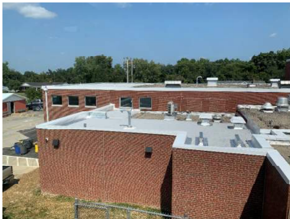
Cafeteria and kitchen additions roof