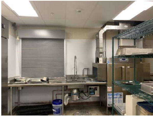
New dishwashing equipment & tray return