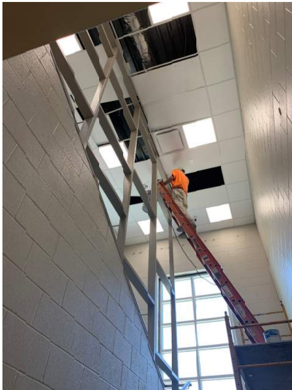
New west stairwell