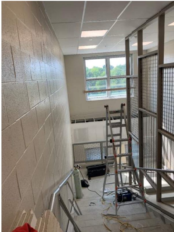
New east stairwell at second floor