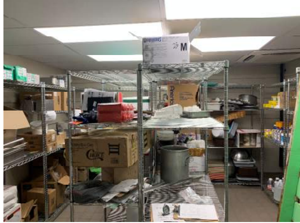
Remodeled kitchen dry storage