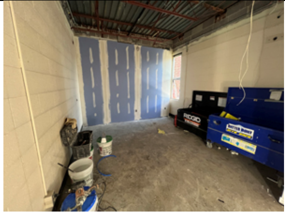
Gypsum board finishing is in progress throughout the second floor.