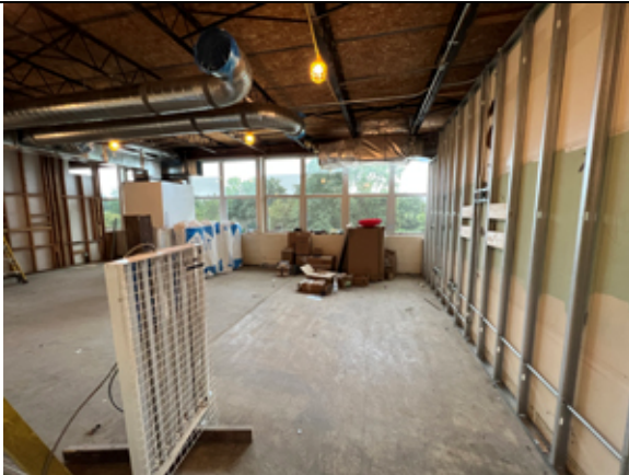
MEP rough-ins are in progress on the second floor