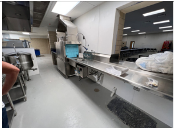
A view of the kitchen.