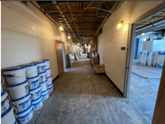
Gypsum board finishing is in progress throughout the second floor.