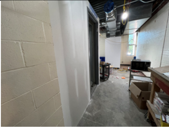
A view of a second floor classroom.