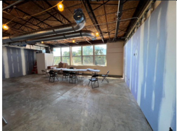
A view of a second floor classroom.