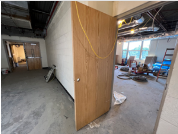
New doors have been installed.