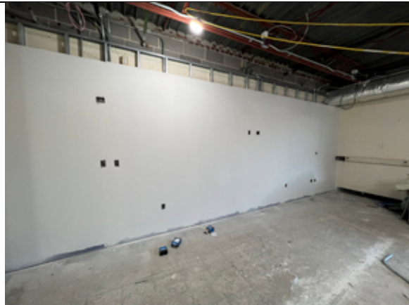
A view of a second floor classroom.