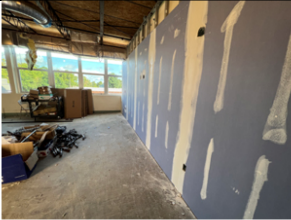
Gypsum board finishing is in progress throughout the second floor.