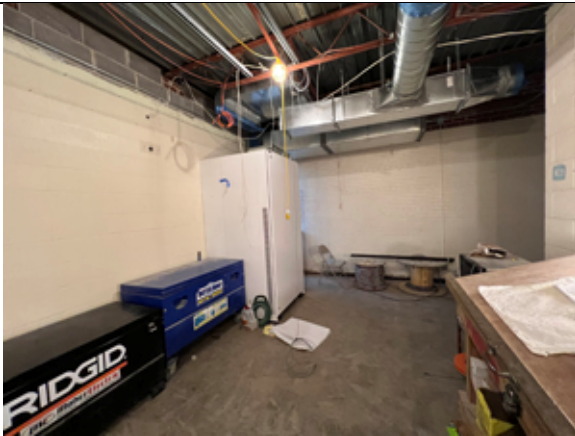
MEP rough-ins are in progress on the second floor.