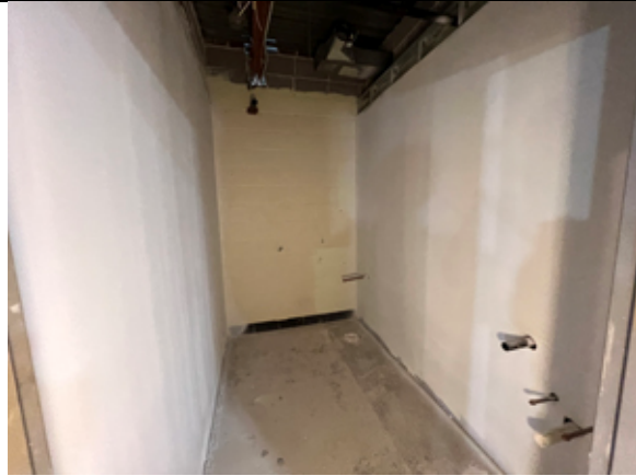
A view of the new second floor floor staff toilet room.