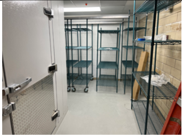
A view of the kitchen storage room.