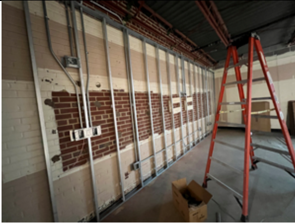
MEP rough-ins are in progress on the second floor