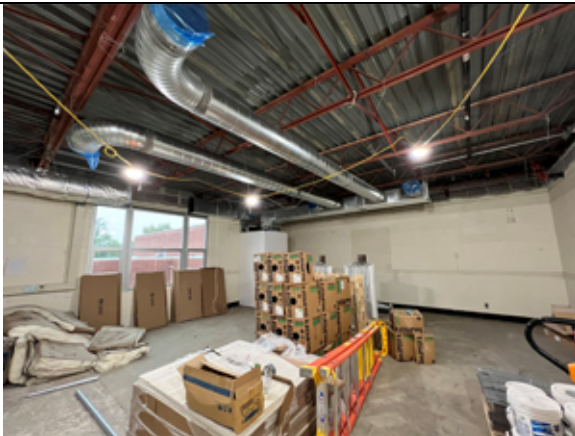
MEP rough-ins are in progress on the second floor.