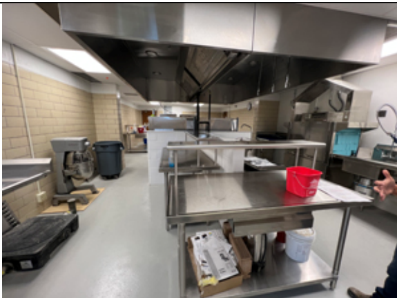
A TCO has been obtained for the kitchen.