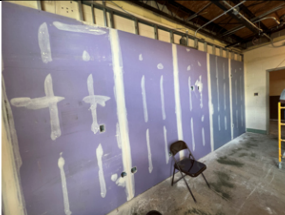
Gypsum board finishing is in progress throughout the second floor.