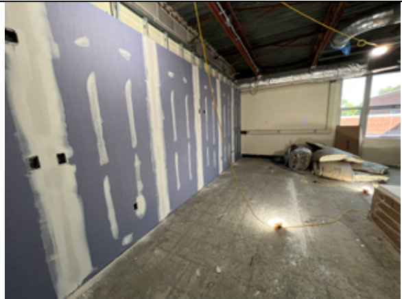
Gypsum board finishing is in progress throughout the second floor.