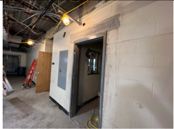
Entrance into the new staff toilet room on the second floor.