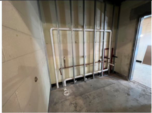
MEP rough-ins are in progress on the second floor.