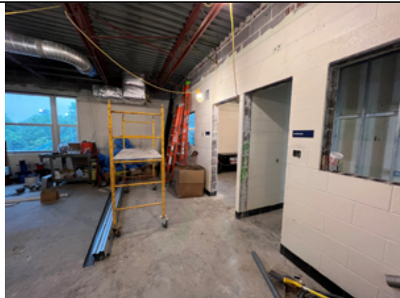
MEP rough-ins are in progress on the second floor.