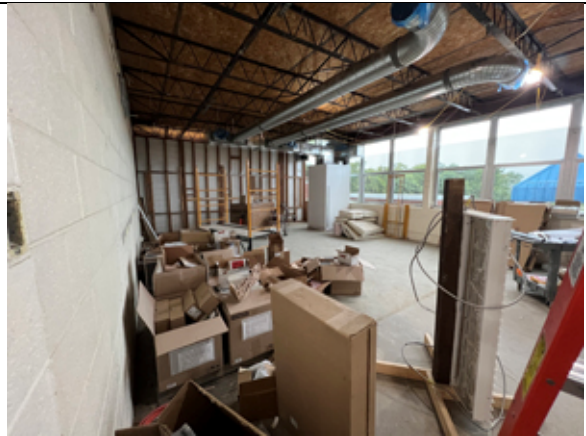
MEP rough-ins are in progress on the second floor.