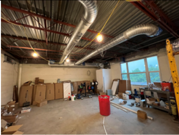
MEP rough-ins are in progress on the second floor.