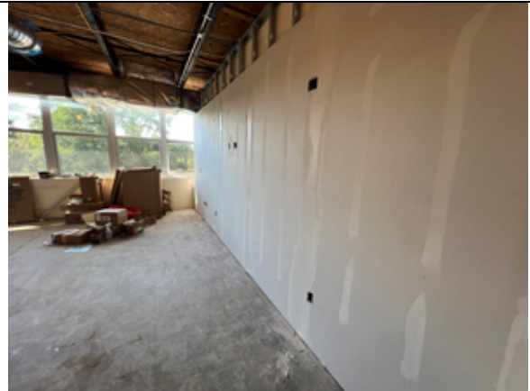
Gypsum board finishing is in progress throughout the second floor.