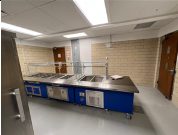
A view of the serving line.