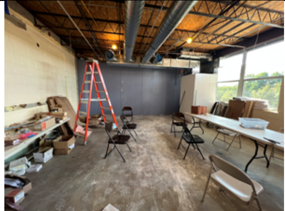
Gypsum board finishing is in progress throughout the second floor.