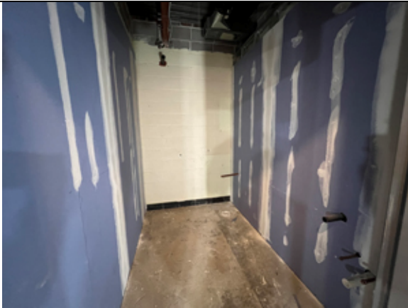
Gypsum board finishing is in progress throughout the second floor.