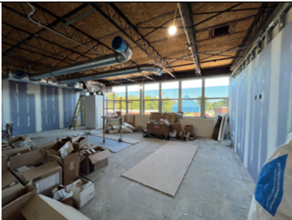
A view of a second floor classroom.