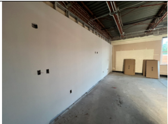
A view of a second floor classroom.