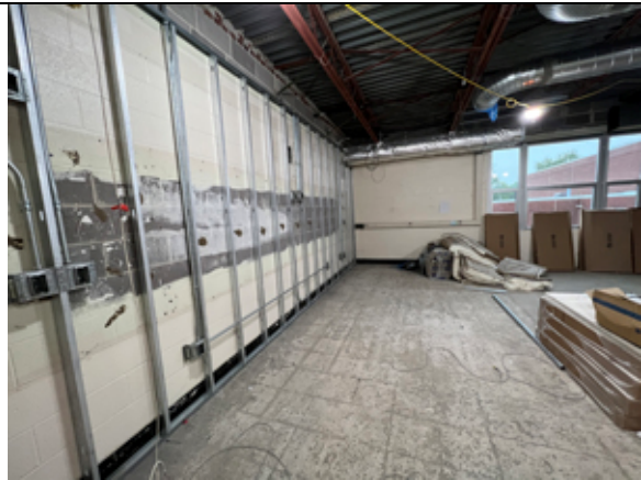
MEP rough-ins are in progress on the second floor.