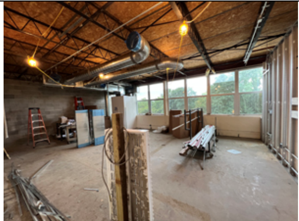
MEP rough-ins are in progress on the second floor