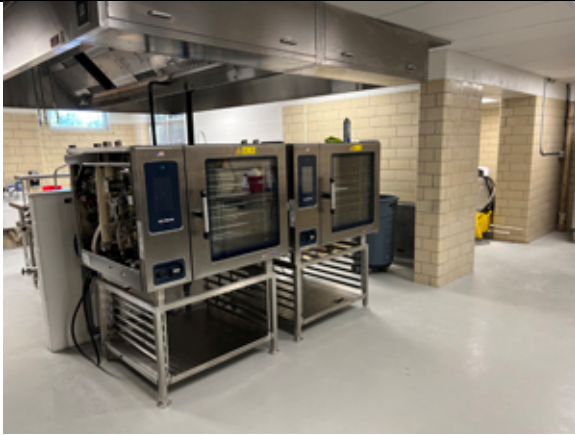
A view of the kitchen.