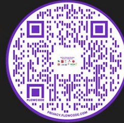
SCAN HERE TO REGISTER

Nov. 17, 2022 // 6:30pm -8pm at Notre Dame Academy