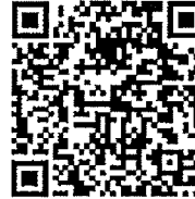
High School Trainings