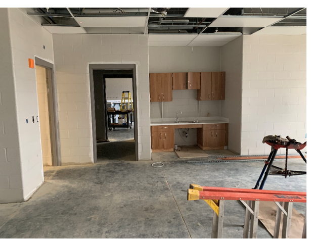
Typical preschool classroom