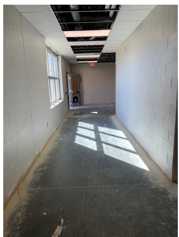
North-south corridor of addition – looking south