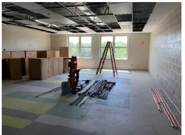
Typical new second floor classroom