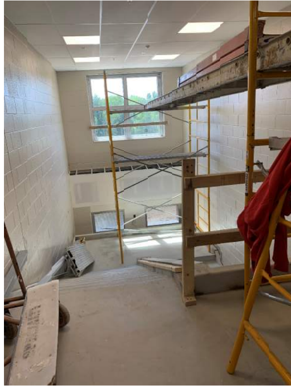
East stairwell – south classroom wing