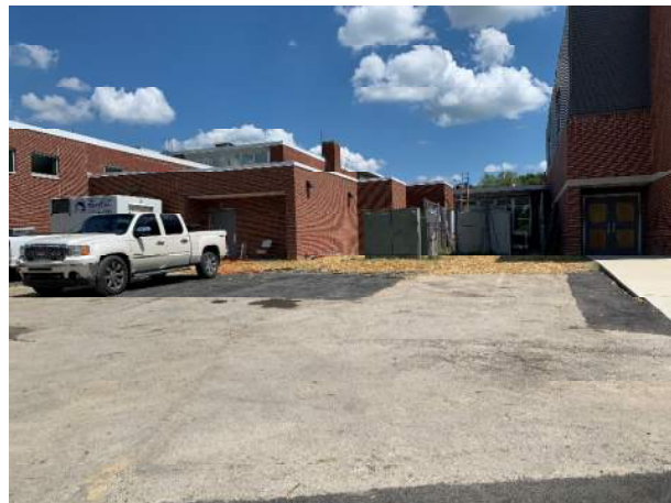
Cafeteria/kitchen/classroom wing additions – west