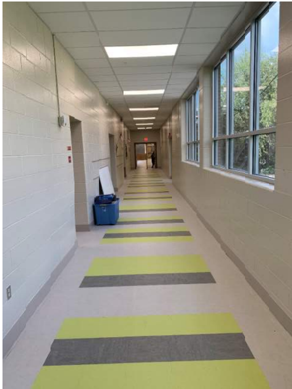
First floor corridor – south classroom wing