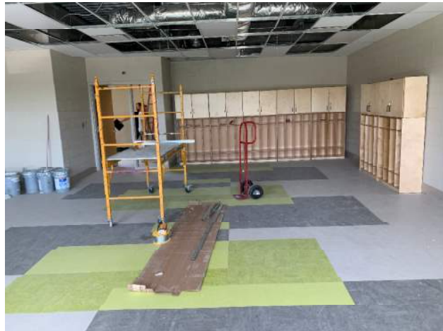
Typical new second floor classroom