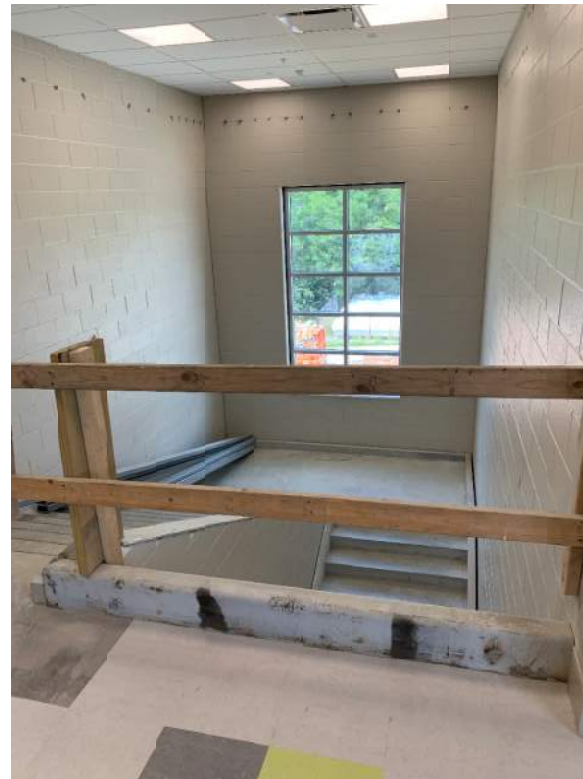
West stair – classroom wing addition