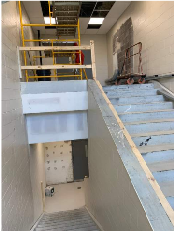
East stairwell – south classroom wing