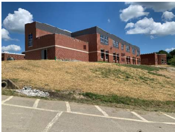
Classroom wing addition