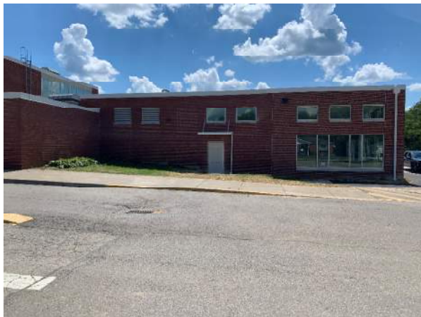
Cafeteria addition – north elevation

32.04 Wastewater treatment plan installation is progressing. New tank is installed