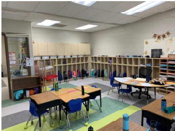
Typical restored first floor classroom