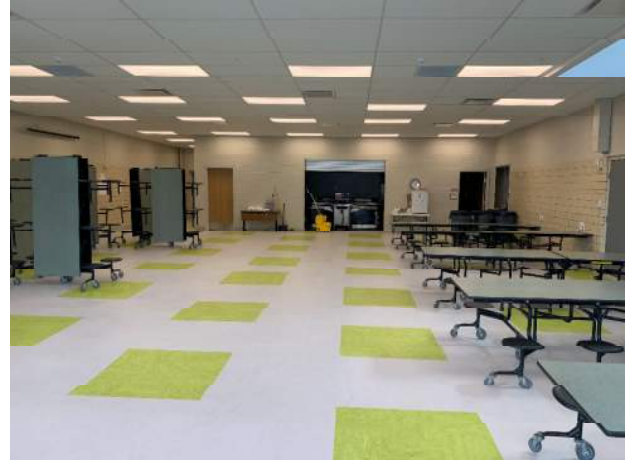
Cafeteria looking towards new Servery