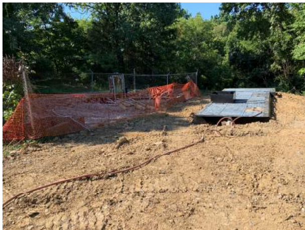
Wastewater treatment plan