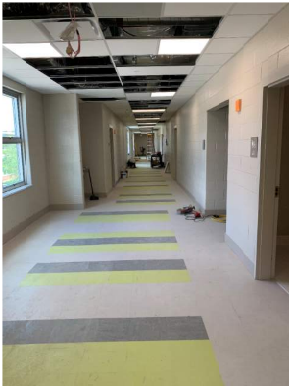
Second floor corridor – south classroom wing