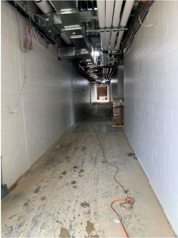
New addition north-south corridor