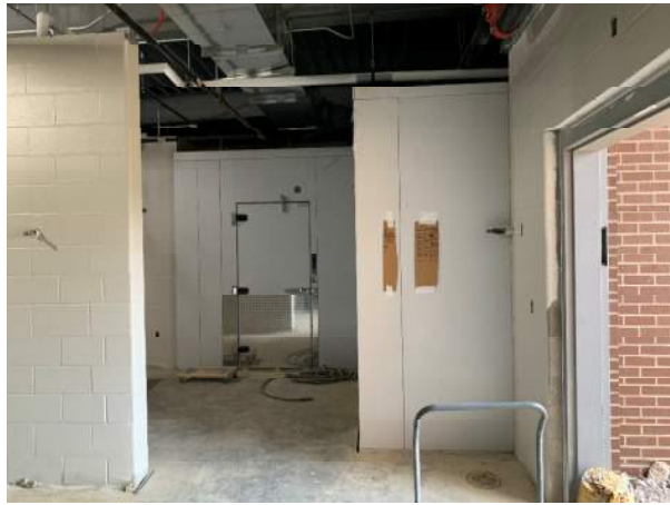
New kitchen walk-in cooler/freezer