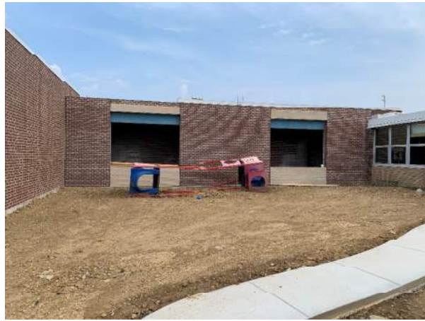
New connector corridor