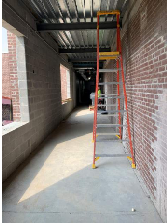
New connector corridor