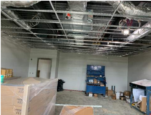
Typical new classroom