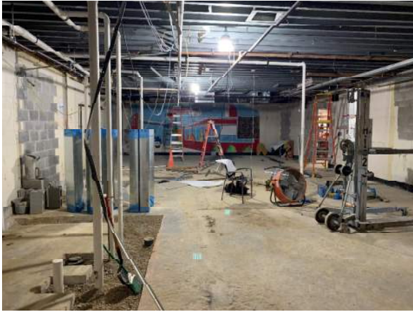
New administration suite (former kitchen)