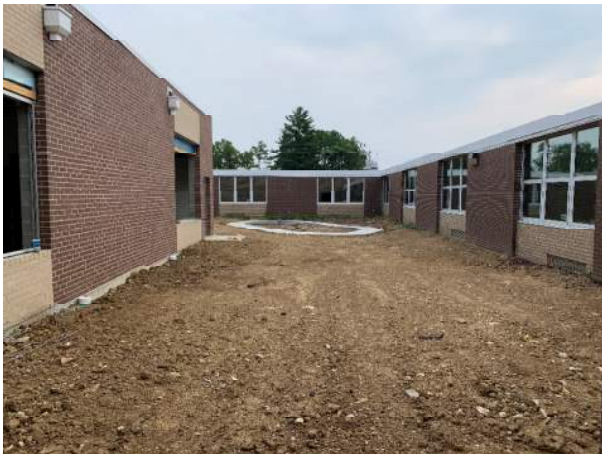
Preschool courtyard – bike track