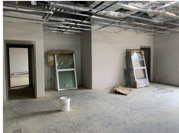
Typical preschool classroom