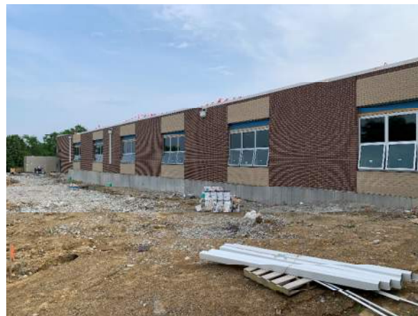
Classroom addition – west elevation